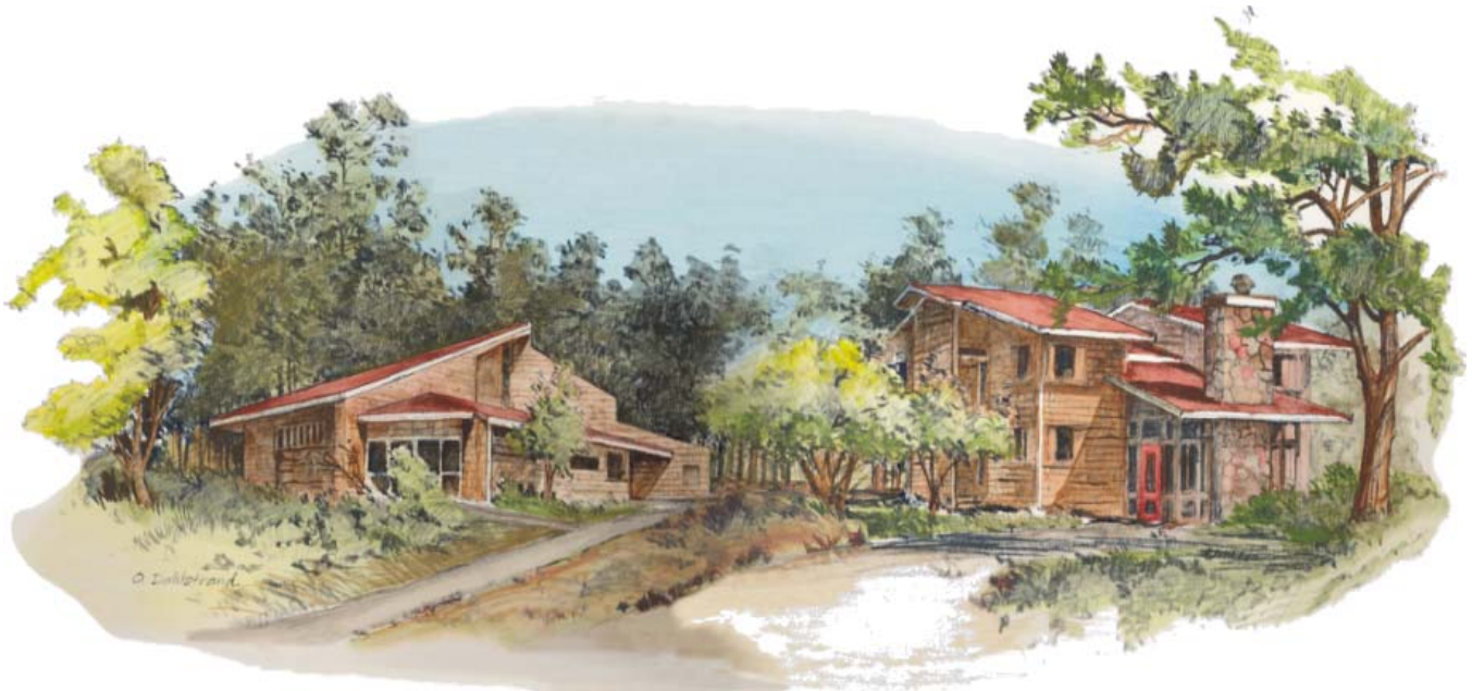
William Penn Mott Jr. Training Center