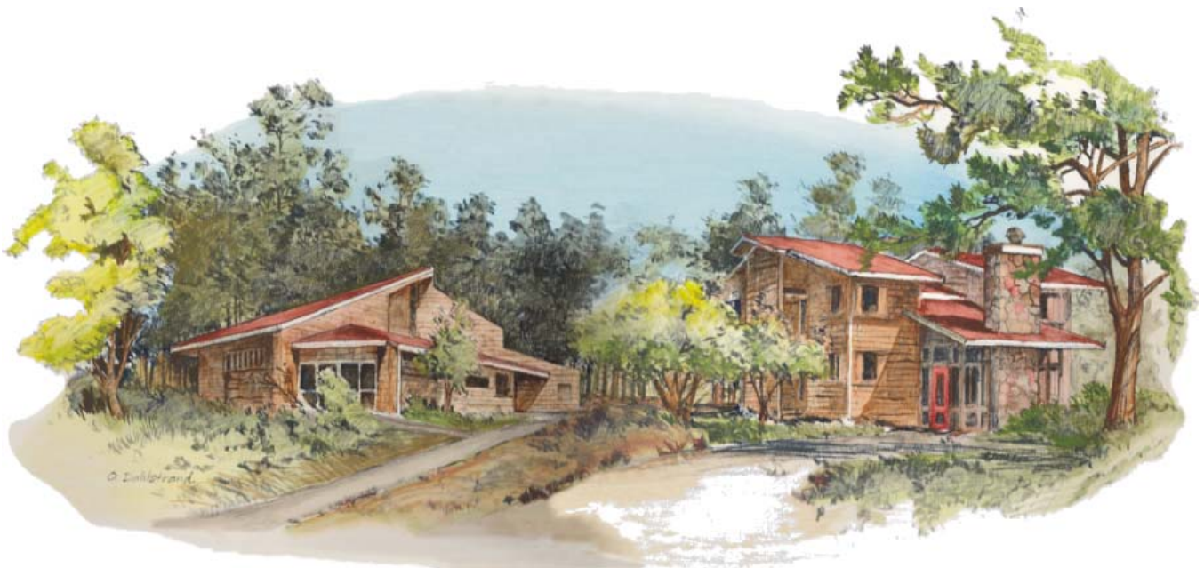
William Penn Mott Jr. Training Center