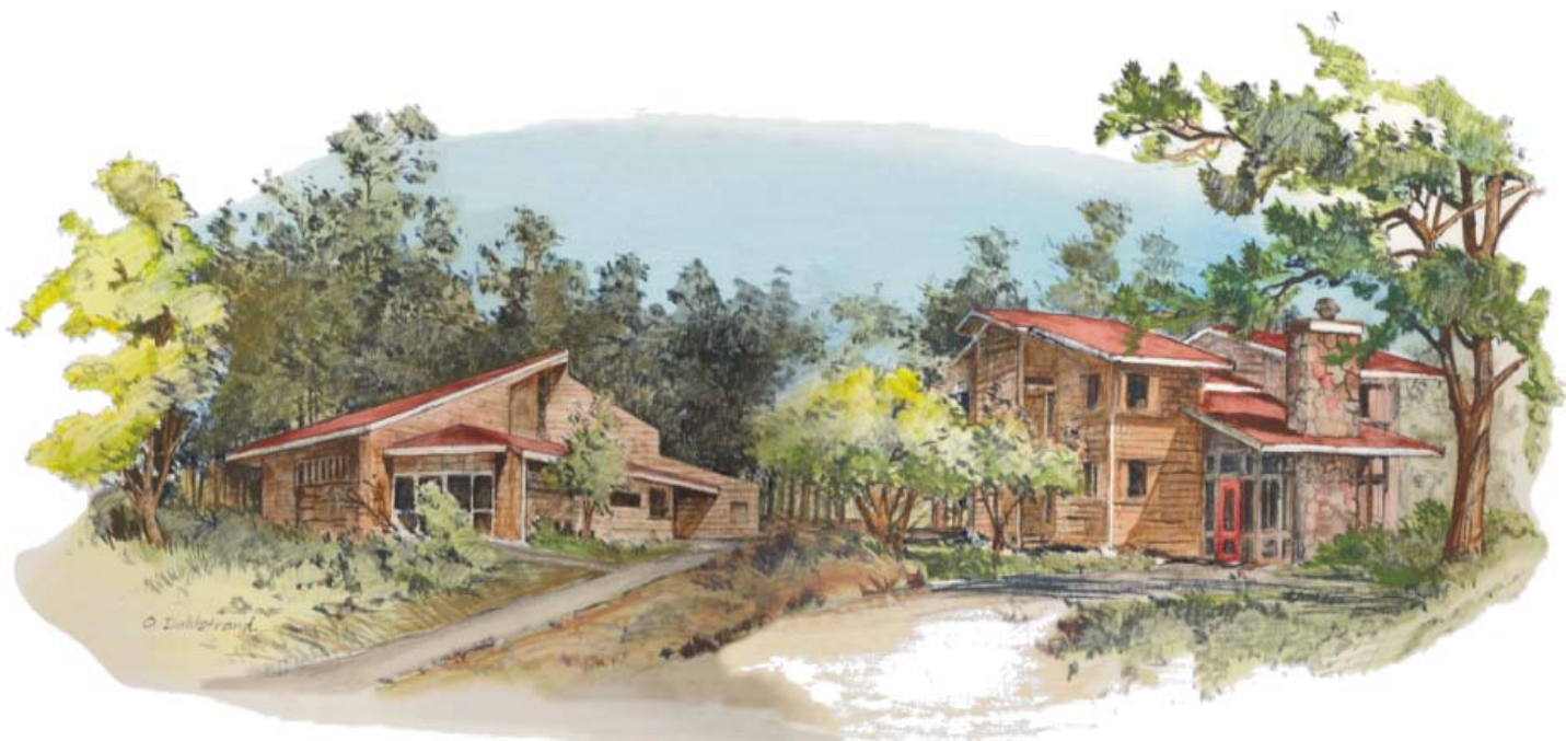
William Penn Mott Jr. Training Center