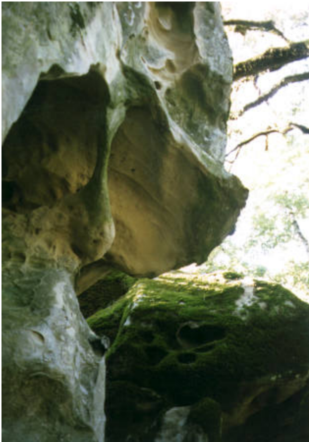
Tafoni rock formations in the Lion Caves