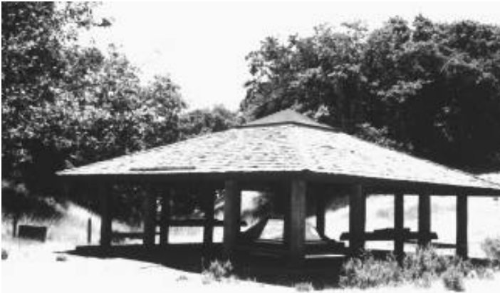
Interpretive Shelter at Partridge Farm