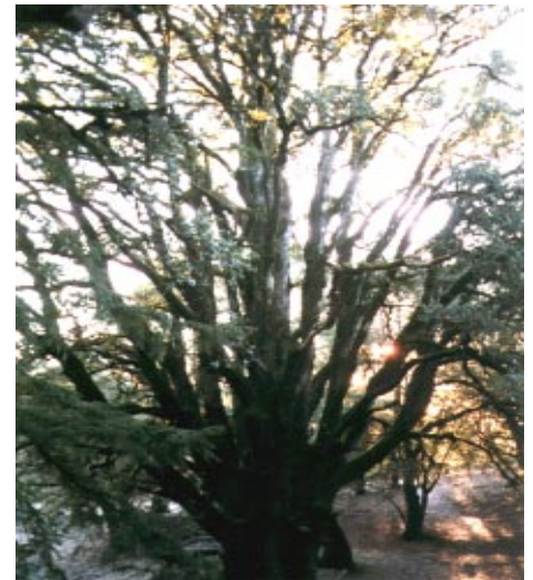
Ridge top oak woodland community

Throughout the general plan process, the public is a vital member of the planning team. With your participation, we can learn how this park should be improved to meet your needs and protect resource values. At our first planning workshop and through surveys of park users, many people expressed the importance of preserving wilderness characteristics and improving interpretation of resource values. People also want access to open space and recreation opportunities that complement activities available in other nearby parks.