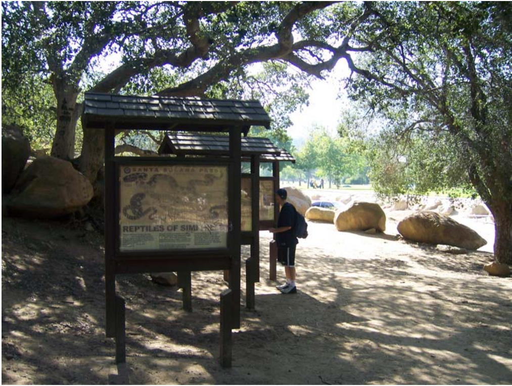
Above: Three interpretive kiosks located at trailhead adjacent to Chatsworth Park South