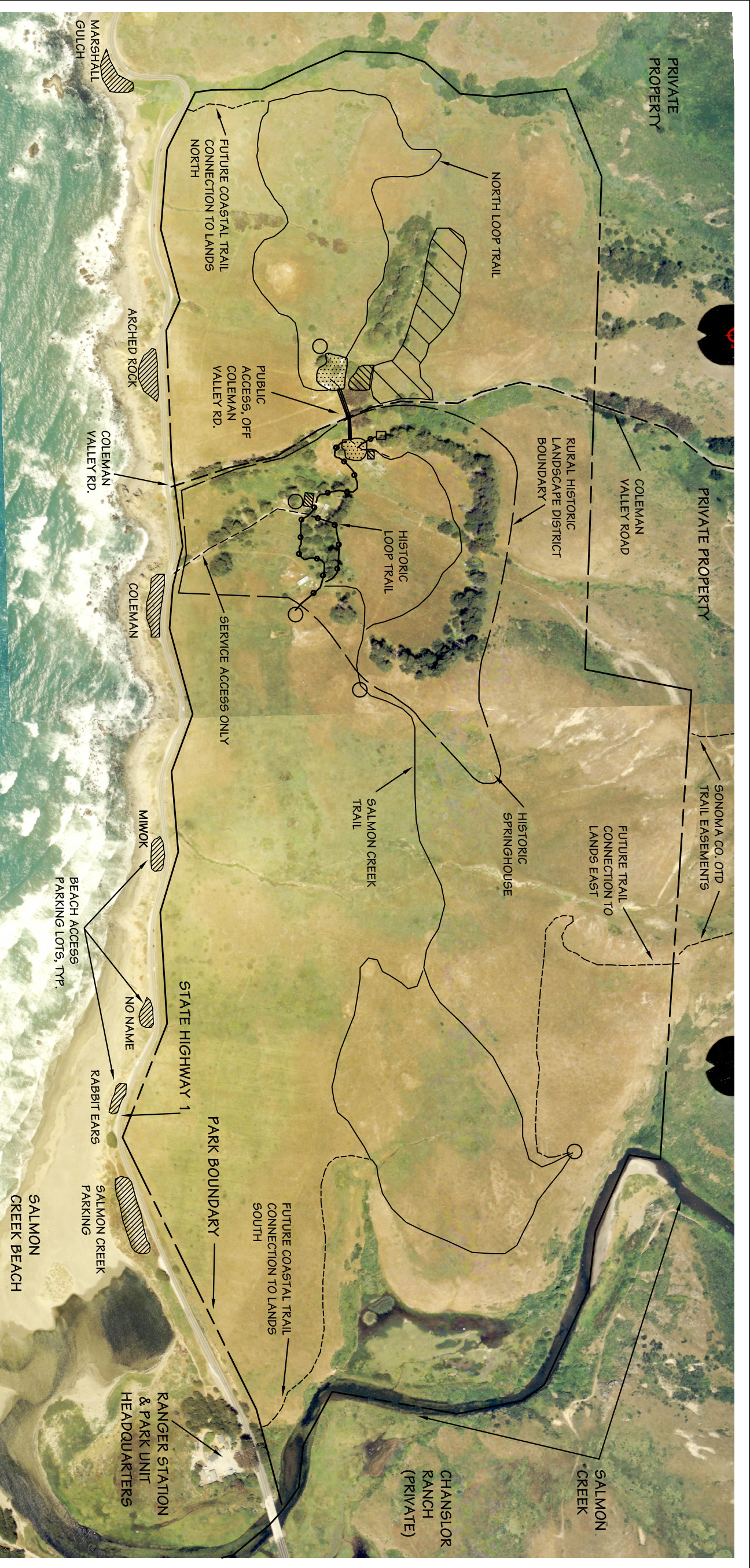
AERIAL PHOTO 06-04-01