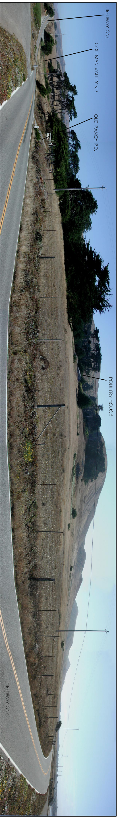
VIEW FROM COLEMAN PARKING LOT