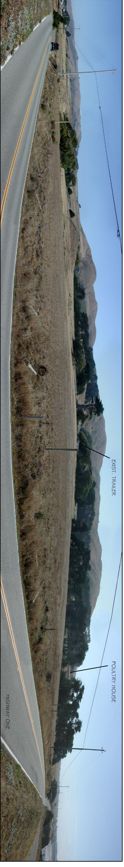
VIEW FROM ARCHED ROCK PARKING LOT