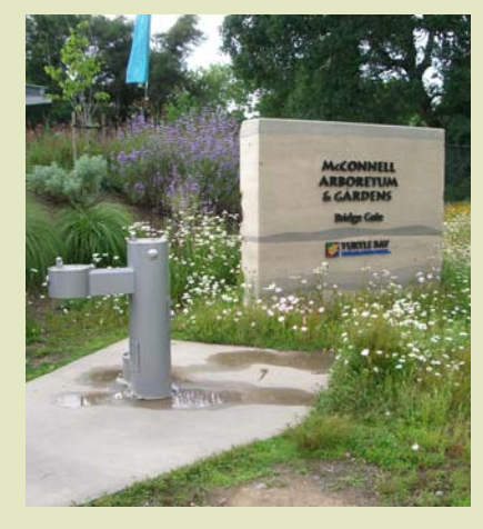
Signage and Pedestrian Amenities