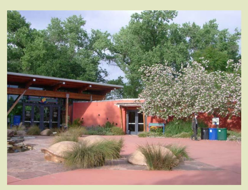
Phase 1 Building