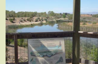
Educational and Interpretive Exhibits