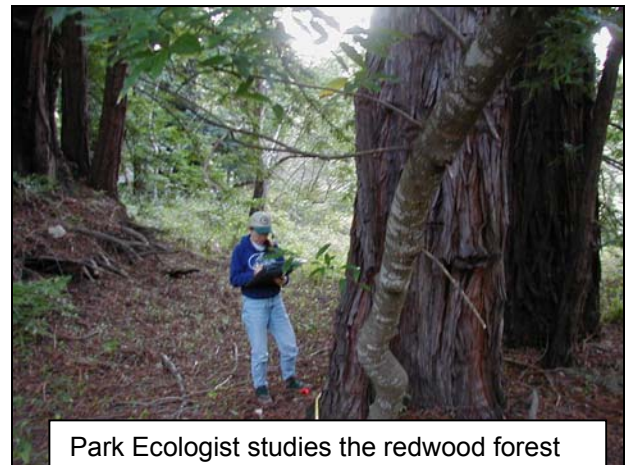
Park Ecologist studies the redwood forest

Though the focus of this planning process is on Big Basin, to be effective the general plan must address important surrounding regional influences. The general plan team is working with other public agencies, trusts, adjacent property owners, and groups and individuals to integrate our planning with regional concerns, efforts, trends, and opportunities. The resource inventory includes regional influences on natural and cultural resources and recreational opportunities.