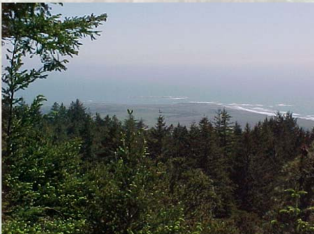
Ocean view from the backcountry