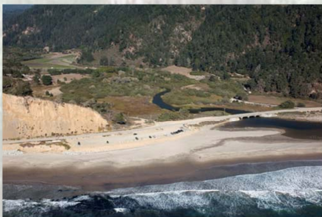
Waddell Beach and the T. J. Hoover Natural Preserve