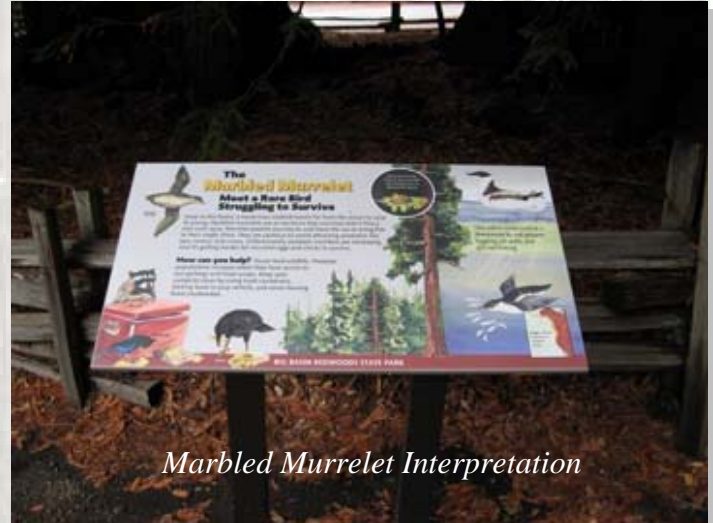
Marbled Murrelet Interpretation