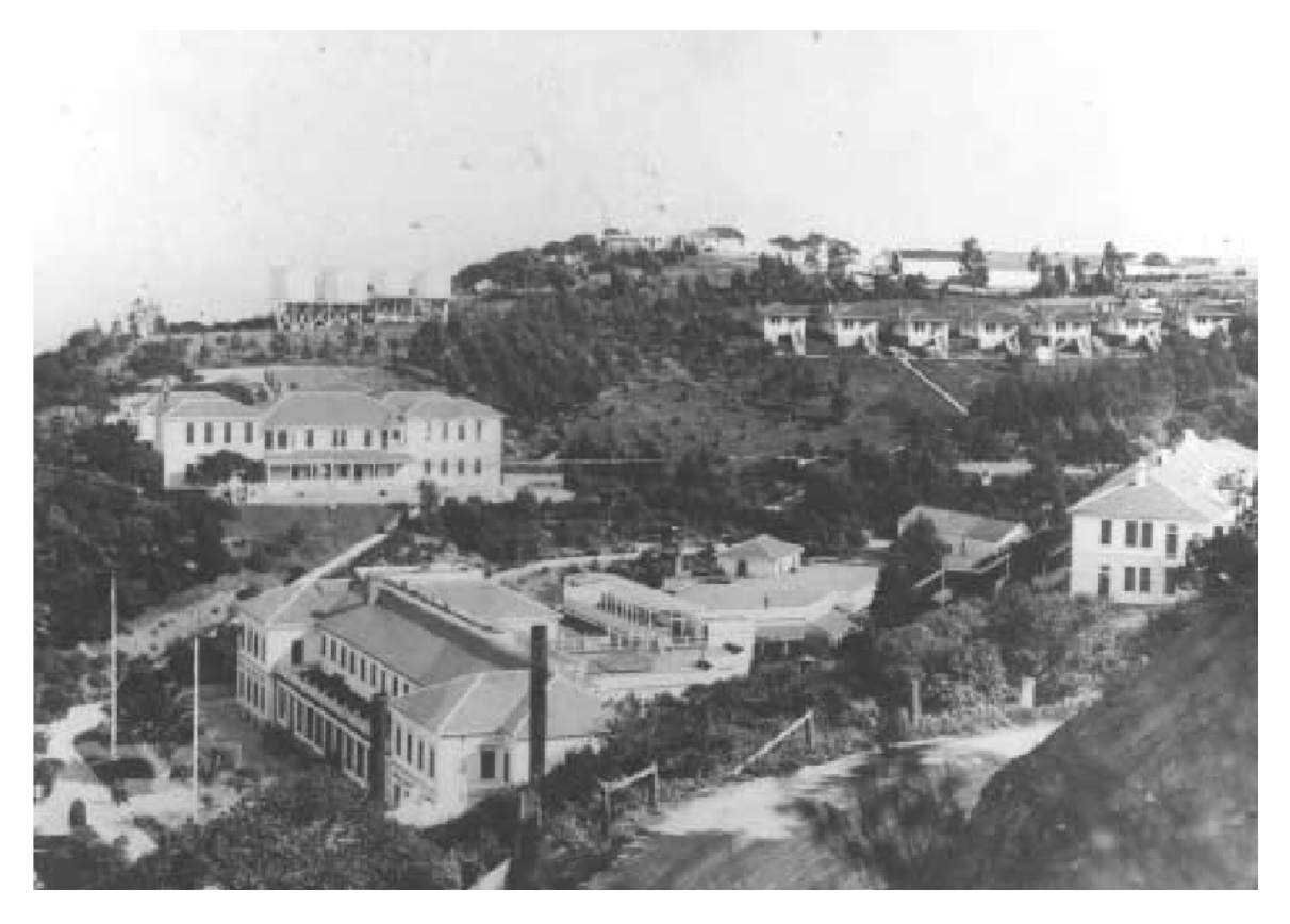
This image illustrates the view looking east towards the Hospital. Although the trees and shrubs are quite well established the current perception and views of the building starkly contrast with this view.

The 1979 General Development Plan (GDP) did not fully recognize this building's historic significance and its interpretive importance in restoring the Angel Island Immigration Station. Due to the poor condition of the Hospital building, the 1979 plan called for preservation treatment and indicated that it would remain closed to public use. The plan also refers to other buildings that remain from the significant interpretive period. All are considered having interpretive importance to the primary and secondary interpretive periods and potential for future adaptive uses (see proposed revisions to the 1979 GDP on the following page).