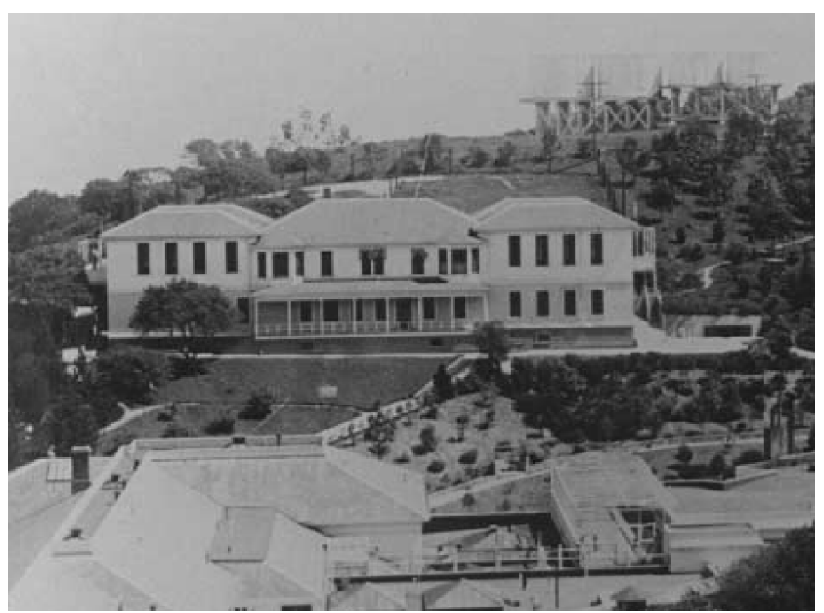
This image illustrates the view looking east over the cottages and Administration Building towards the Hospital. The west or principal elevation of the Hospital is the most imposing with a tripartite arrangement of narrower flanking pavilions alongside a central, more prominent core.

The Angel Island Immigration Station was listed as a National Historic Landmark in 1997. Many of the original buildings are still standing, including the Hospital Building, constructed in 1910.