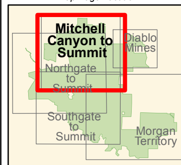
Map Page Location

Mileage of Roads, Trails by Designated Use in Mitchell Canyon Road: Hike, Horse: 1.8 mi Road: Hike, Bike, Horse: 35.2 mi Trail: Hike: 0.8 Trail: Hike, Horse: 24.5 Trail: Hike, Bike, Horse: 3.3 Non-system: 4.9