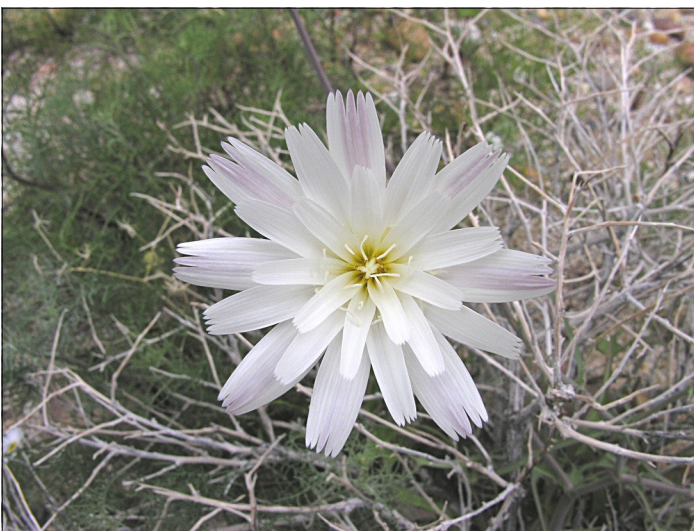
Desert Chicory, Rafinesquia neomexicana Common, under shrubs in sandy, gravelly soils