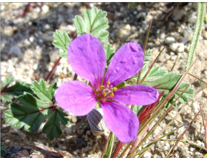
Desert Heron's Bill, Erodium texanum Occasional, in sandy soils near Ranger Station