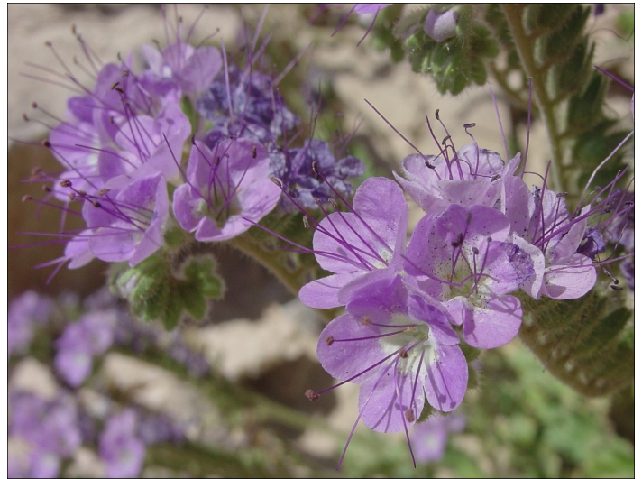
Phacelia, Phacelia crenulata Common, under shrubs in sandy, gravelly soils