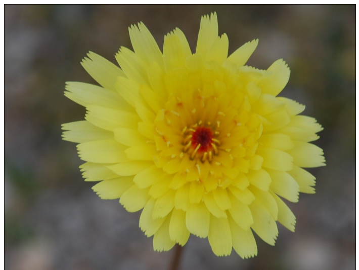
Desert Dandelion, Malacothrix glabrata Rare, in western area of the park