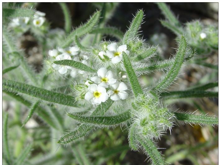
Popcorn Flower, Cryptantha sp. Common, in sandy, gravelly soils