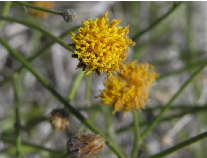
SweetBush, Bebbia juncea Frequent, on plains east of County Line