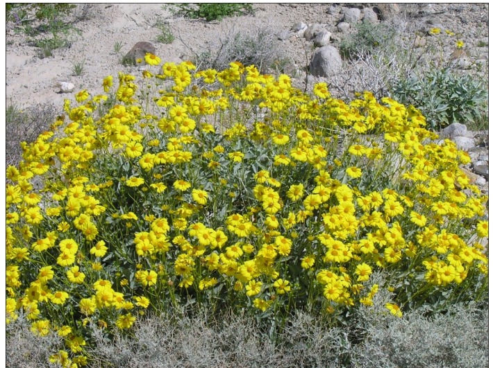
Brittlebush, Encelia farinosa Occasional, in rocky soils in western area of park