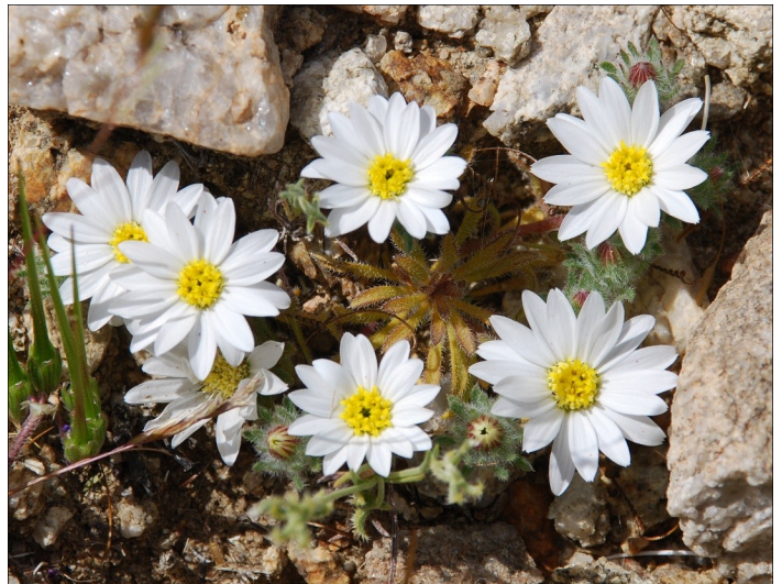
Desert Star, Monoptilon bellioides Fairly common, throughout the park