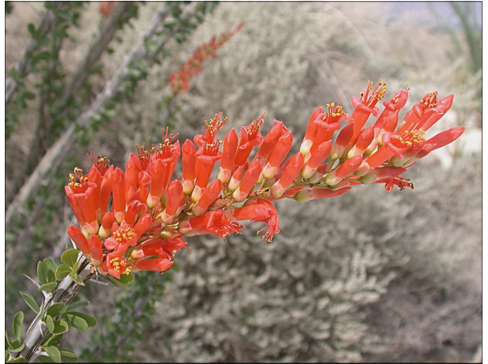
Ocotillo, Fouquieria splendens Common, in dry rocky soils