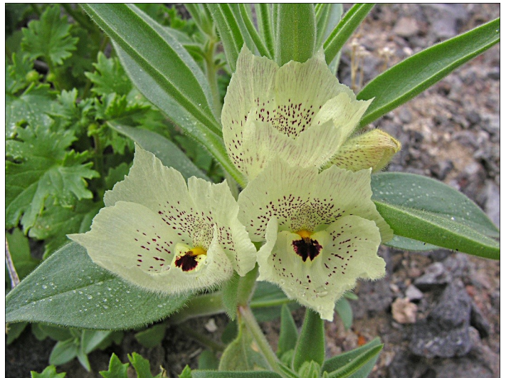
Ghost Flower, Mohavea confertiflora Unusual, in sandy washes and gravelly slopes