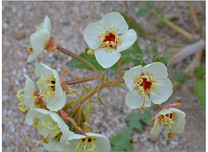
Brown-Eyed Primrose, Camissonia claviformis Common, in sandy, gravelly soils