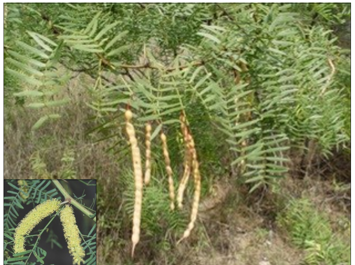
Honey Mesquite, Prosopis glandulosa Common, in sandy washes