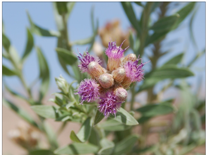
Arrow Weed, Pluchea sericea Abundant, in washes throughout the park