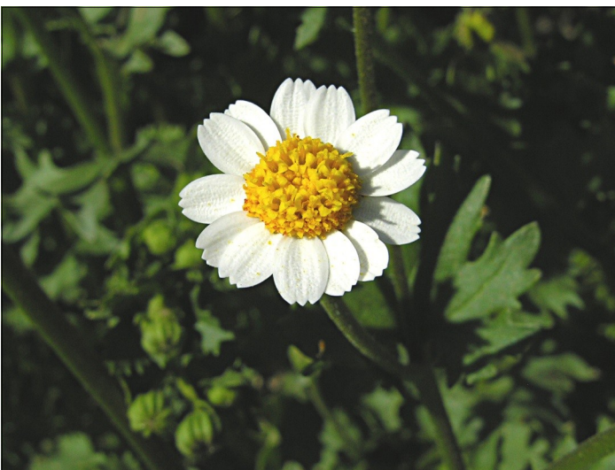
Rock Daisy, Perityle emoryi Fairly common, in the western area of the park