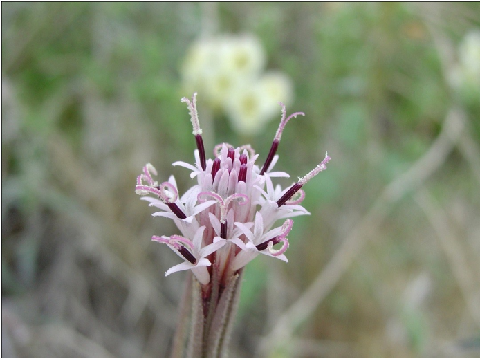
Spanish Needles, Palafoxia arida Common, all areas of the park except badlands