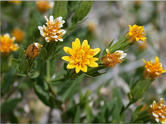
Chinchweed, Pectis papposa Common, throughout the park after summer rains