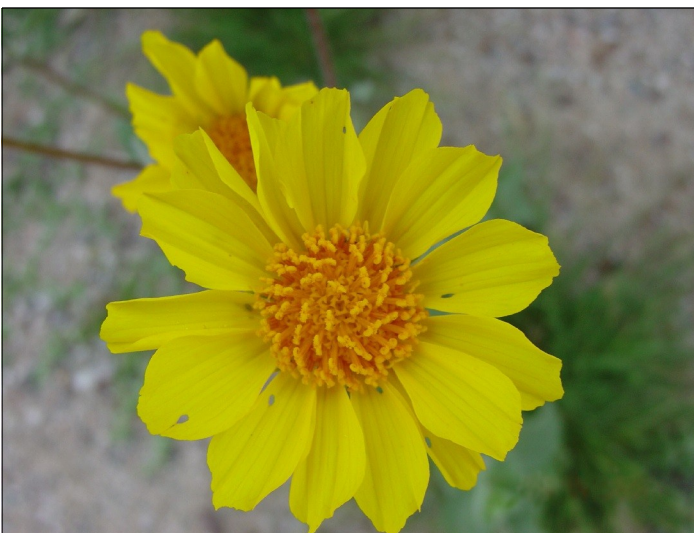
Desert Sunflower, Geraea canescens Common, throughout the park