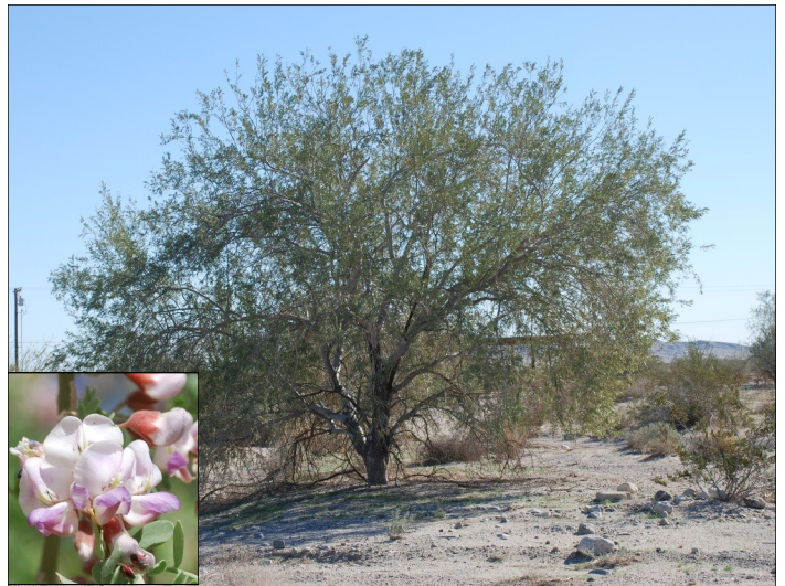
Desert Ironwood, Olneya tesota Common, in western low plains and near washes