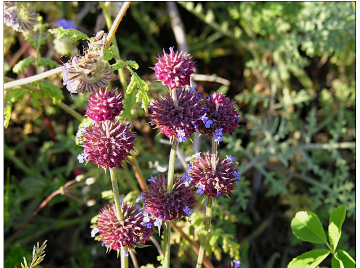
Chia, Salvia columbariae Unusual, seen a few times near Barrel Springs