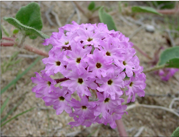
Sand Verbena, Abronia villosa Common, in sandy soils throughout the park