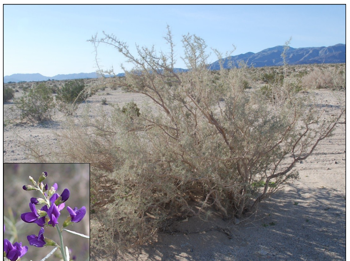
Indigo Bush, Psoralethamnus schottii Common, on slopes, benches and in washes