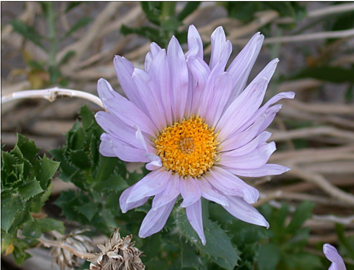
Orcutt's Aster, Xylorhiza orcuttii Common, in washes in northern area of the park