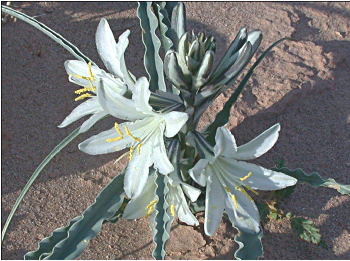
Desert Lily, Hesperocallis undulata Uncommon, in sandy soils throughout the park