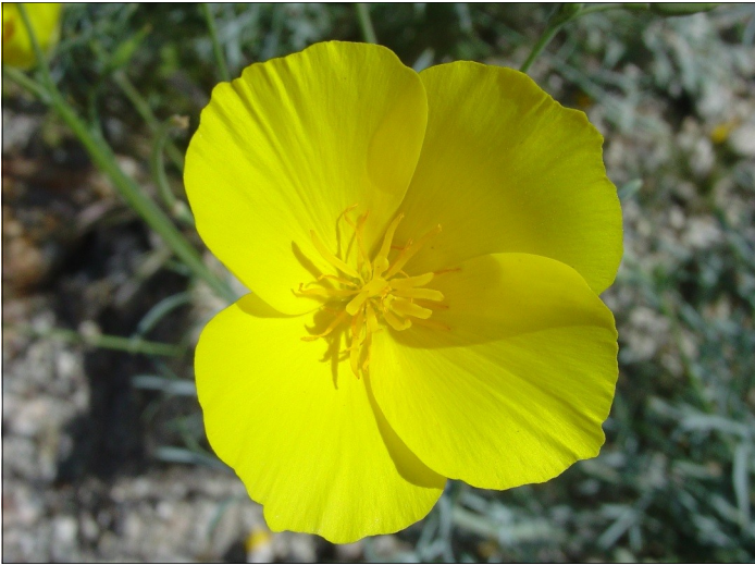
Little Gold Poppy, Eschscholzia minutiflora Occasional, in washes and disturbed soils