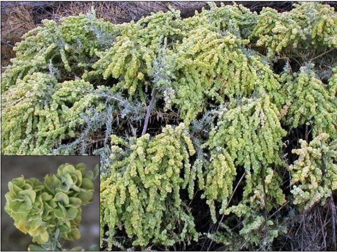
Fourwing Saltbush, Atriplex canescens Common, throughout the park