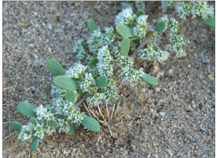
Frost Mat, Achyronychia cooperi Common, in sandy areas