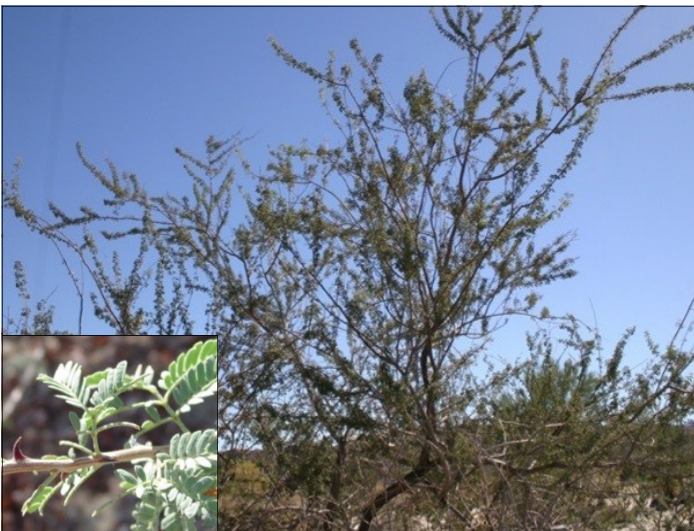
Catclaw, Acacia greggii Occasional, in sandy soils in western area