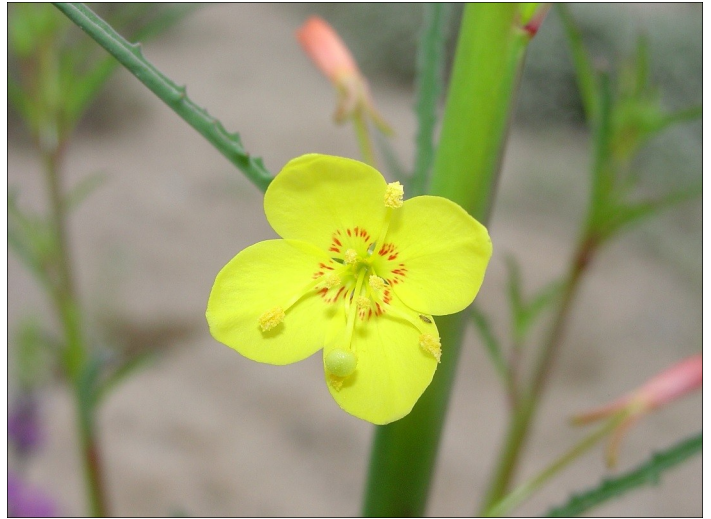
Evening Primrose, Camissonia californica Occasional, around Ranger Station