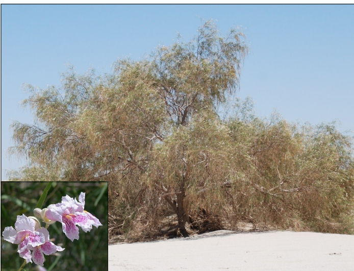
Desert Willow, Chilopsis linearis Common, in San Felipe Creek wash