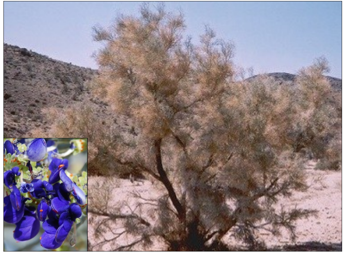
Smoke Tree, Psoralea argophylla Occasional, in washes