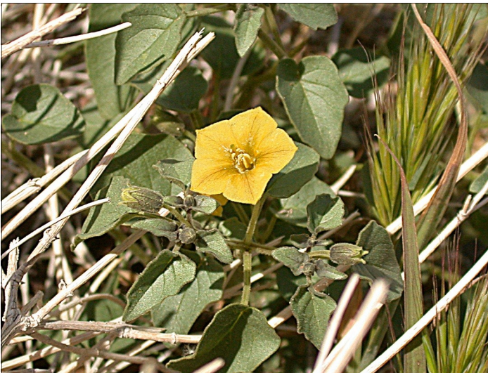
Ground Cherry, Physalis crassifolia Common, in rocks at base of East Butte