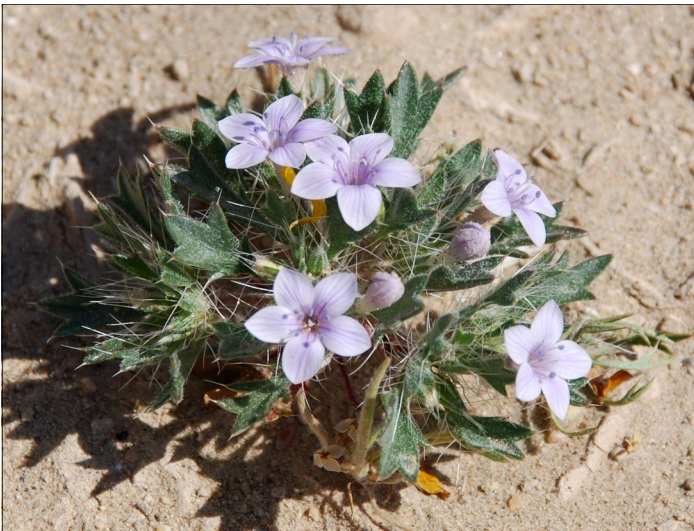
Bristly Gilia, Langloisia setosissima Occasional, in sandy, gravel soils in western area