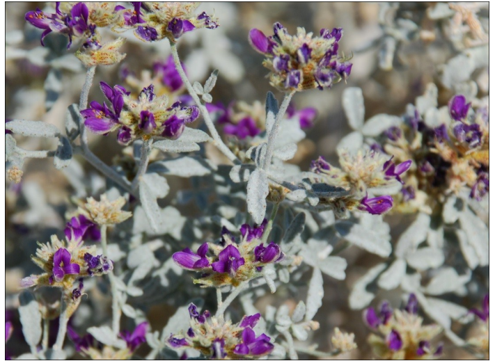
Dyeweed, Psoralethamnus emoryi Common, throughout the park except badlands