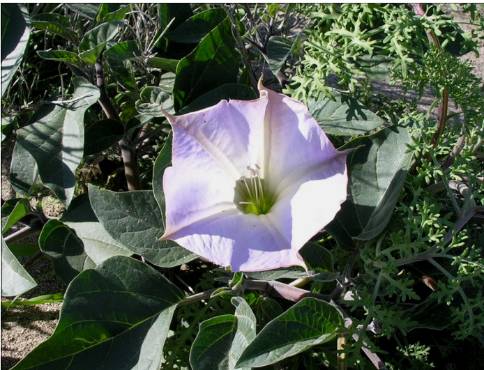
Jimson Weed, Datura wrightii Uncommon, near Benson Dry Lake