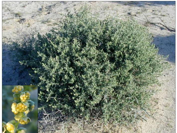
Burro Bush, Ambrosia dumosa Abundant, throughout the park