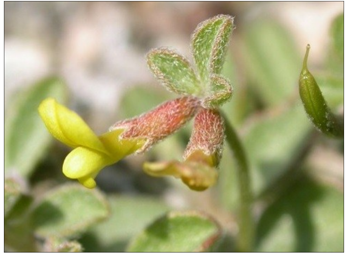
Hairy Lotus, Lotus spigosus Frequent, on flats and plains