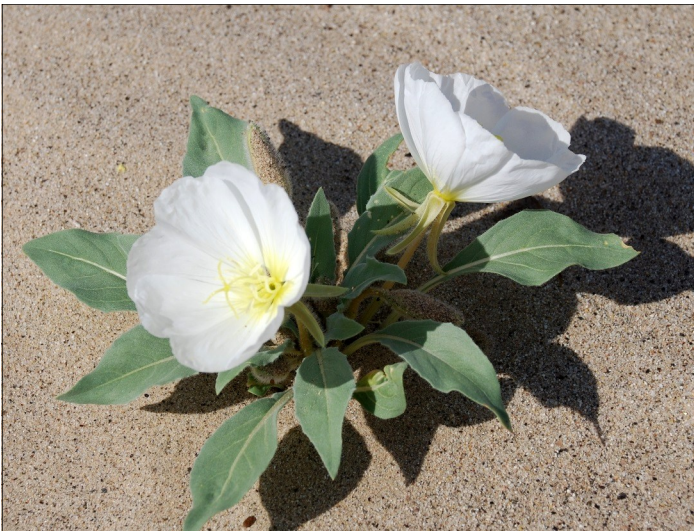
Dune Evening Primrose, Oenothera deltoides Common, in deeper sandy washes and dunes