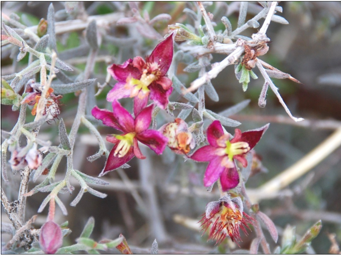
White Rhatany, Krameria grayi Occasional, in dry sandy, gravelly soils