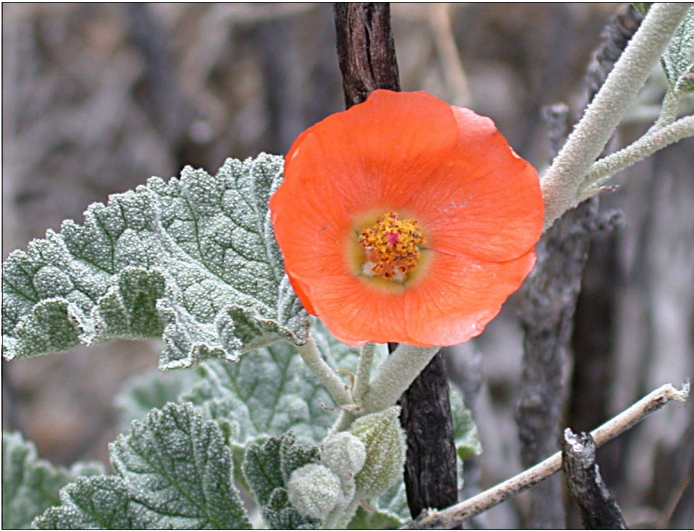
Apricot Mallow, Sphaeralcea ambigua Common, in southeastern area in disturbed soils