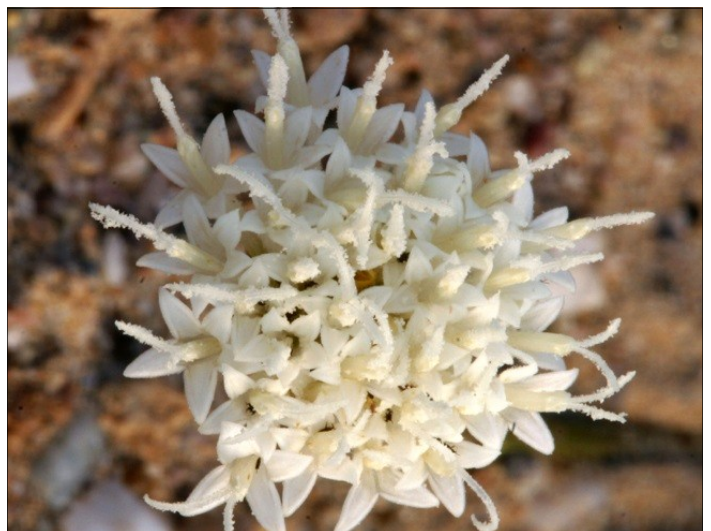
Pebble Pincushion, Chaenactis carphoclinia Occasional, in western alluvial and sandy areas