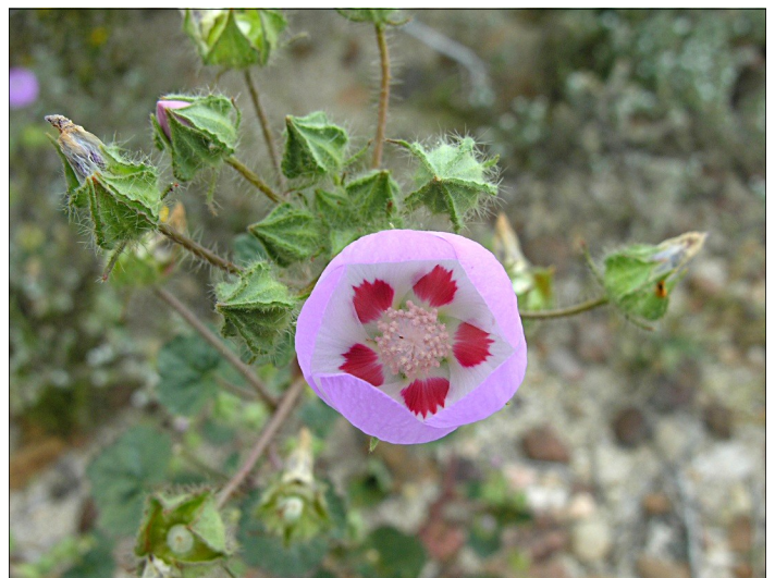
Desert Five-Spot, Eremalche rotundifolia Occasional, in gravelly soils east to County Line