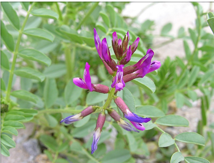
Salton Milkvech, Astragalus crotalariae Occasional, throughout the park