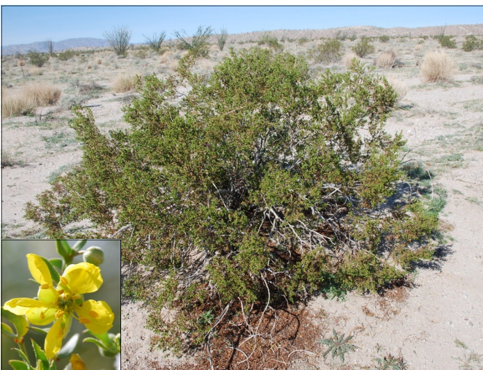
Creosote Bush, Larrea tridentata Common, throughout the park