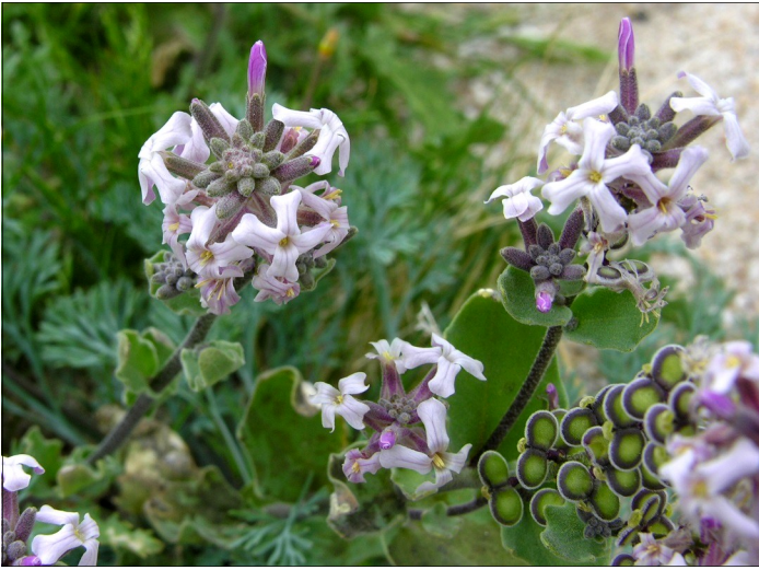
Spectacle Pod, Dithyrea californica Occasional, in southern area of the park