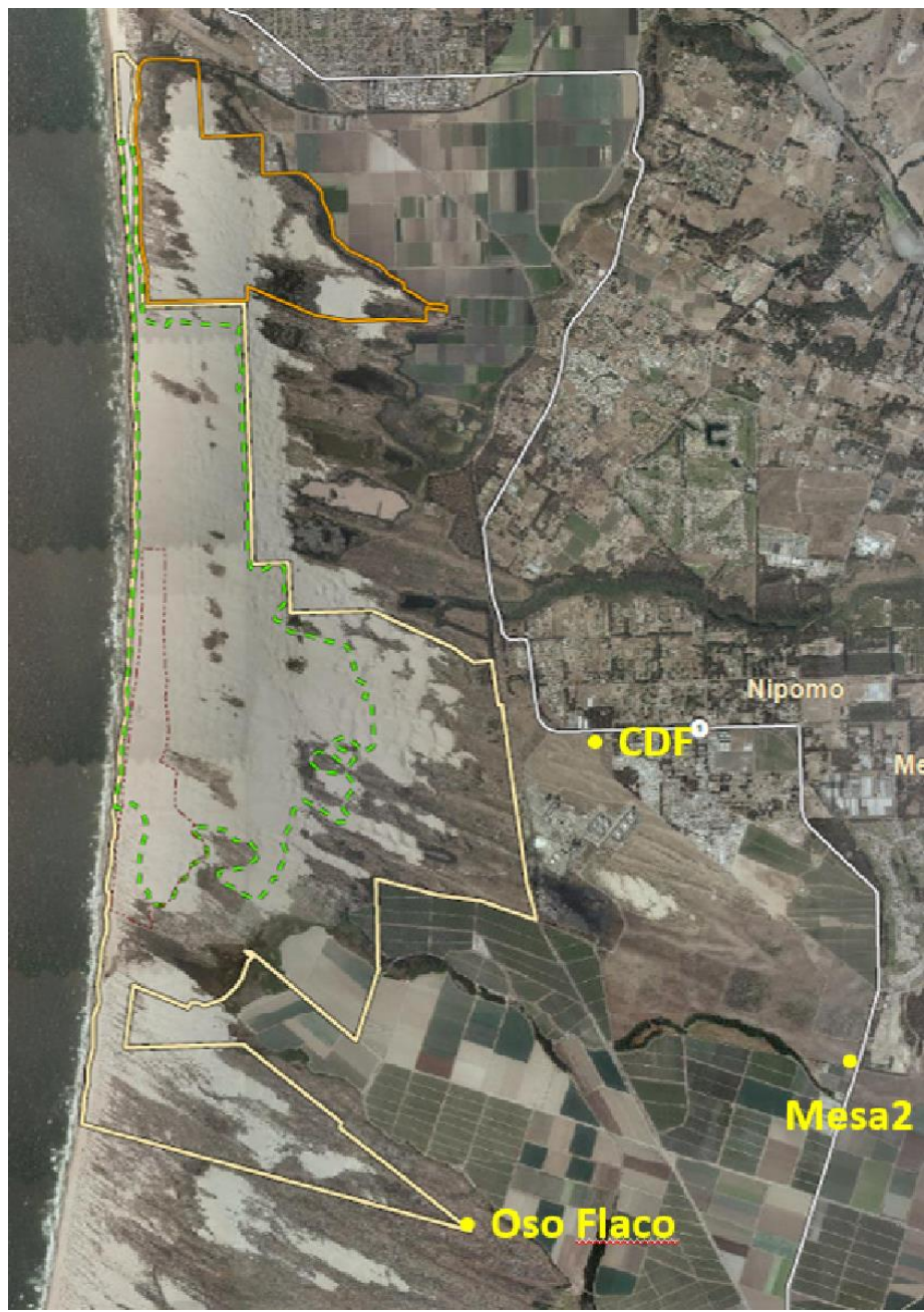
Figure C1. The locations of the APCD monitoring sites CDF, Oso Flaco, and Mesa2.