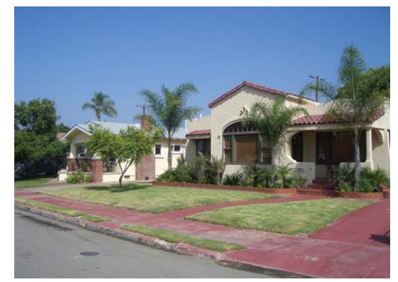
Burlingame Historic District

life and community character. Rehabilitation Tax Credits provide a ten or twenty percent tax credit on rehabilitation spending for income producing properties eligible for the National Register of