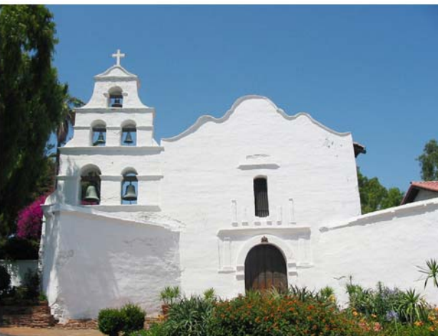
Mission San Diego de Alcala'