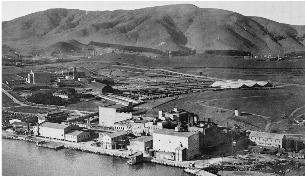
Western Meat Company, East Grand Avenue, 1922. The city's industrial history is significant, although no industrial buildings or sites are currently designated historic resources.

The conservation of this unique history is the objective of historic and cultural preservation in South San Francisco. In addition to Sign Hill, designated resources in South San Francisco include several residential and commercial buildings in the downtown area. The City's Municipal Code and State and federal law, protect these local, State, and national historic resources from alteration and demolition. The Historic Preservation Commission oversees the protection of these resources. As such, designation is an important tool for preserving reminders of the past that contribute to the City's identity. Equally central, and perhaps more difficult, is the broader goal of conserving the city's unique industrial heritage.