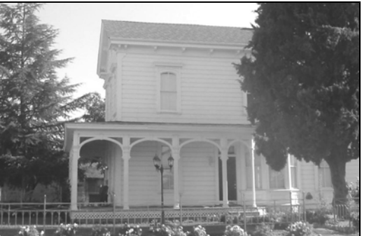
FIGURE 9.1 Historic Victorian Homes in Galt

One of the issues addressed through the Historic Preservation Specific Plan's design guidelines is the extent to which the guidelines encourage the authenticity of architectural styles and materials. This is important to promote the vitality of Downtown Galt and to establish a special commitment to the visual quality of the area.