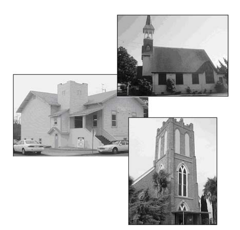
FIGURE 9.5 Collage of Galt's Churches

Clockwise from the top: St Luke's Episcopal Church, St. Christopher's Catholic Church, and the original Galt Christian Church that was moved from the town of Liberty.