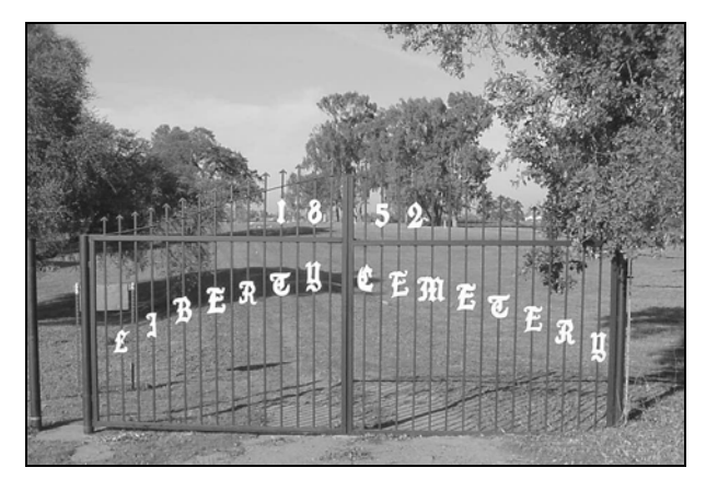
FIGURE 9.3 Liberty Cemetery