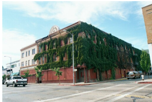
Awaiting funds: the Palace Hotel in Ukiah

Having sufficient financial tools and incentives is absolutely critical to the preservation efforts of every California city. More historic resources are lost because of lack of financial resources than any other reason. Buildings like the Palace Hotel in Ukiah (right) may ultimately be lost, not for lack of a sympathetic owner, but from