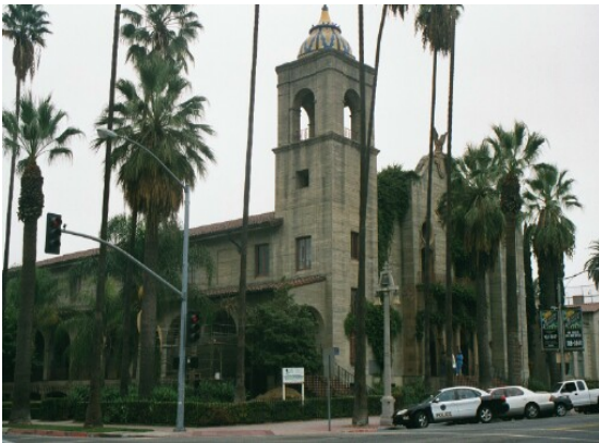
Riverside Civic Building

The need for such orientation is becoming more evident with time. The growing dissatisfaction with the suburbs and insatiable sprawl seems to be grounded in the sameness of it all. (Highsmith 1994, 15). The transience that has been the prominent part of American life for so long has eroded “community”. (Hamer 1998, 124). Not surprisingly therefore, the nostalgia of the small town is really a “quest for community- a nostalgia for a compassable and integral living unit”. (Moe, 1997, 176). 9 The more