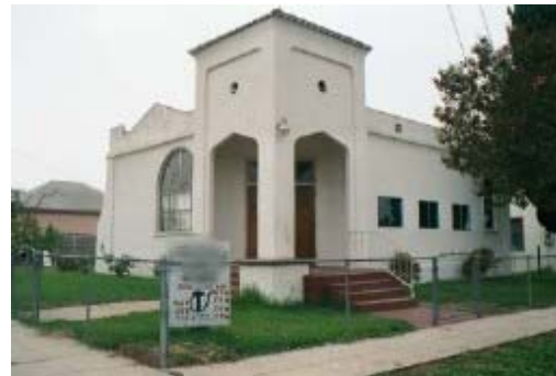
Iglesia De Dios Church Building in Redlands

highest in the city. The preservationists believe the building is historic and would probably be eligible for the local register of