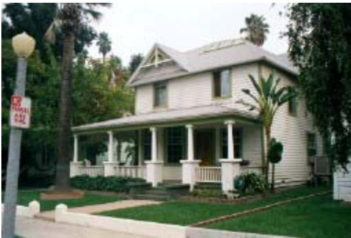
“Modified” Victorian in Redlands

designated. The city had not installed a computer database that would have alerted the front desk planner that the home was within an eligible historic district, which would ordinarily trigger a review by the local preservation commission for appropriateness. The homeowner received the over-the-counter permit and proceeded to install the skylight. Neighbors to the subject property immediately contacted the city to complain about the construction activity and the “inappropriateness” of installing a skylight in the front of a home in a historic district. The city notified the homeowner to cease and desist the construction activities pending review by the preservation commission. A lengthy and