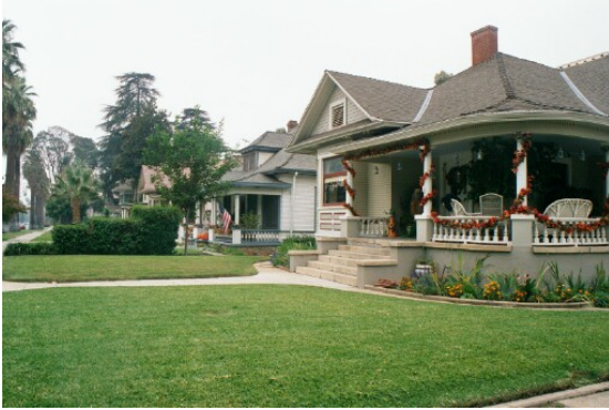
Historic District in Redlands

Another example shows how the element can predict the process positively. In