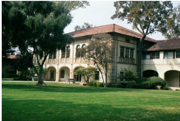
Circle City’s former high school: today the Corona Civic Center

In the city of Corona, much of the Circle City’s historic downtown was demolished in the days of urban renewal. Yet, its local high school (right) was facing the same fate as many of Corona’s older buildings, when the City