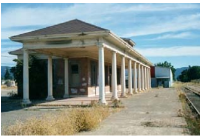
Ripe for development: A boarded up train depot in Ukiah

In City D, an old train depot sits adjacent to railroad tracks that carry passenger trains five times daily, but trains do not stop at the old depot. The building itself is in disrepair, but still retains its strong historic character and architectural elements. The depot is eligible for the State and local registers and therefore subject to the design guidelines in the local preservation ordinance. The preservation element mandated that design review standards "shall consider context when approving alterations to existing historic structures". The owners of the depot would like to convert the spacious building into a restaurant and build a sound wall adjacent to the depot so that the noise generated