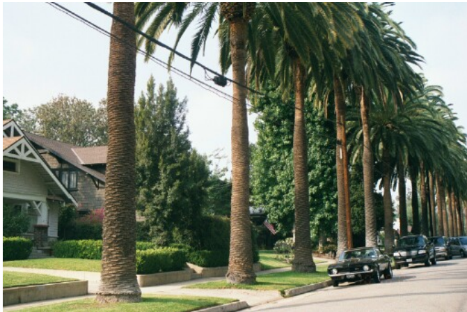
Tree lined historic district in South Pasadena

Part and parcel to history is a description of the city’s known historic resources, whether they are buildings, districts, trees, landscapes or street lamps. While not the