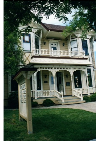
Victorian home converted to law offices: Adaptive Reuse in Ukiah

While it seems unnecessary, describing why the element has been adopted should be part of the foundation. The statement can be simple, but it should explain why the city is taking the extra step in developing a preservation element (discussed supra ) and why the city is adopting a preservation plan. Overall, there are three basic reasons for having a preservation plan (whether as a separate element or one included in some other part of the general plan): 1) the identification, designation, protection and preservation of local significant historic, archaeological and cultural sites, landmarks, buildings, districts and landscapes; 2) to guide new development, as well as the rehabilitation or adaptive reuse of historic and cultural resources; and 3) to contribute to the economic development and vitality of the locality. (Growing Smart, 2002, 7-0173). It may include a description of lost historic resources, pressures of growth and the sameness of sprawl. The impetus for the element is important. And as seen supra , when done well, the eloquence of the description can inspire. The purpose of the element should tie the program to follow to the purpose of historic preservation.