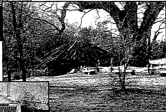
Chaw'se Indian Grinding Rock State Historic Park, Amador County