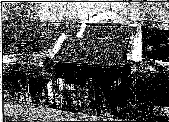
Bok Kai Temple, Marysville

Office of Historic Preservation California Department of Parks and Recreation