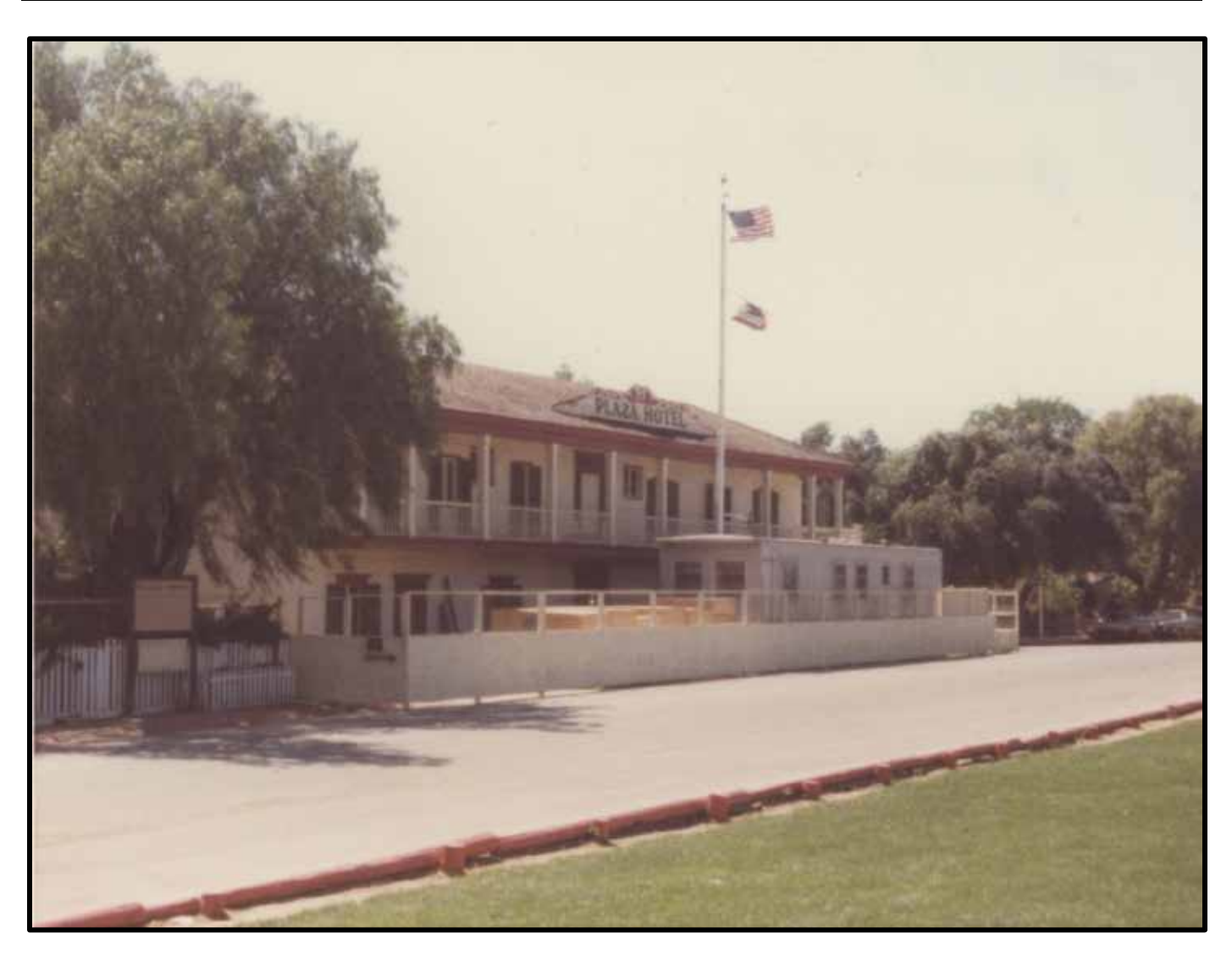
Plaza Hotel, San Juan Bautista Historic Park, 1979.

Property Name: Plaza Hotel (UPDATE) Page 10 of 11