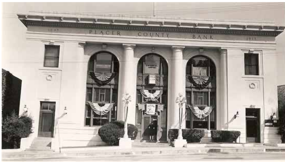
Figure 3 of 3: Placer County Bank circa 1946