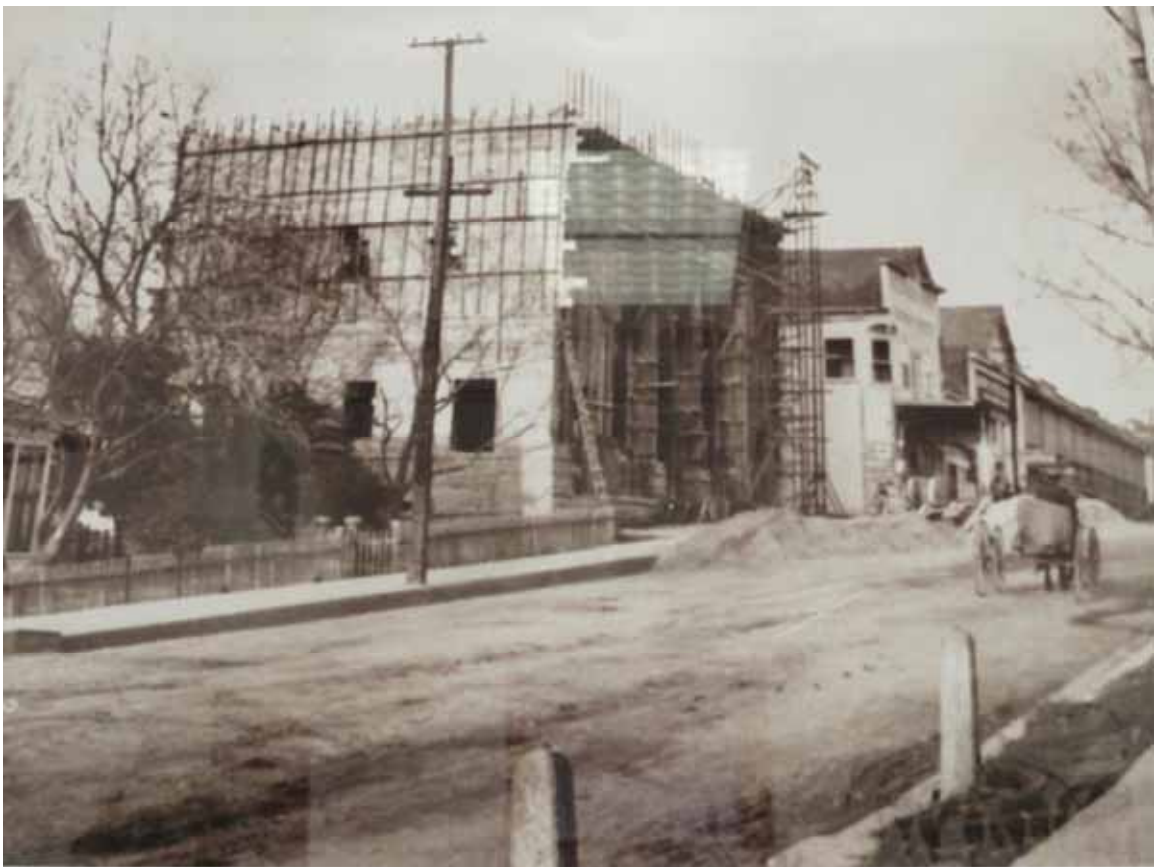
Figure 1 of 3: Placer County Bank construction 1912