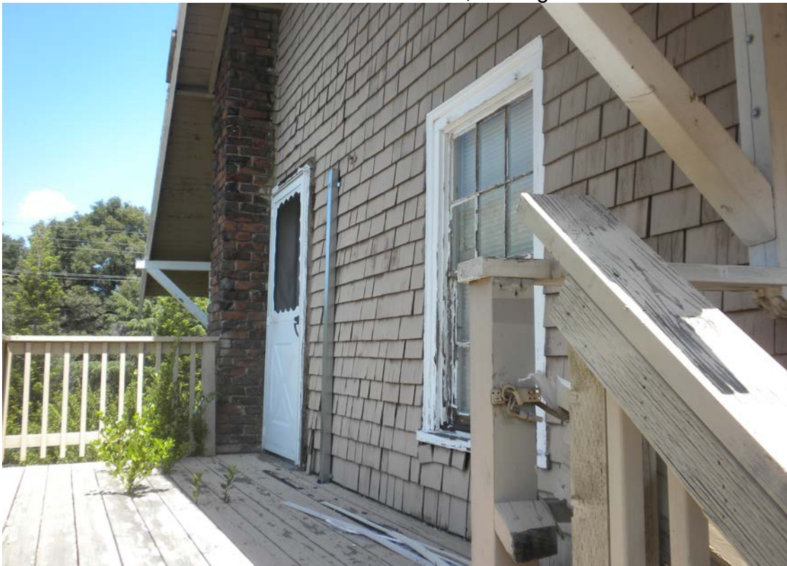
11. Southwestern elevation, detail of second floor looking north