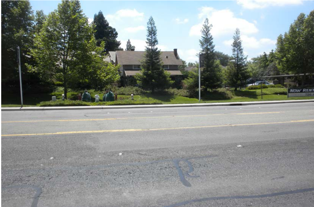
2. View across Auburn Boulevard, looking southeast