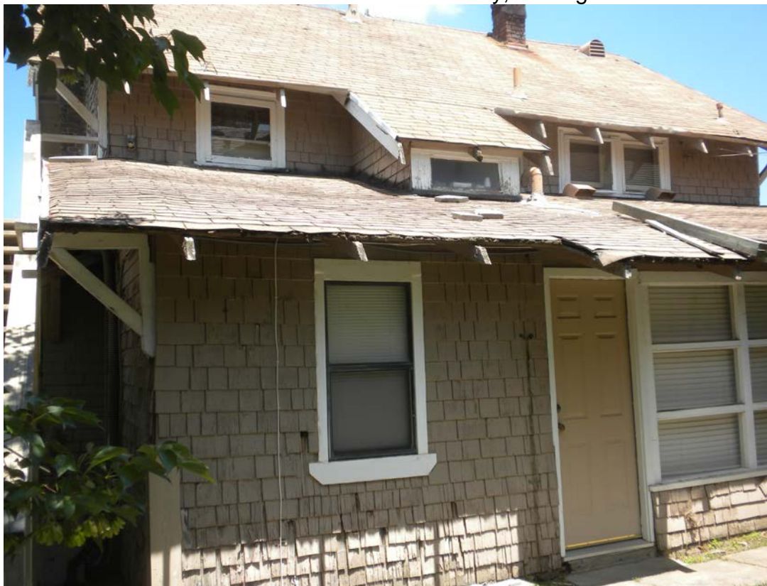
9. Detail of rear (southeastern) elevation, looking north