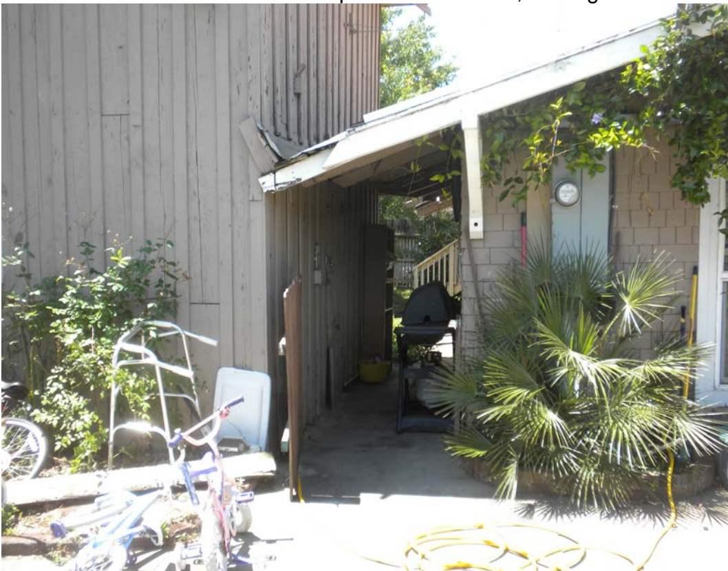
7. Connection between residence and tank house, looking southwest