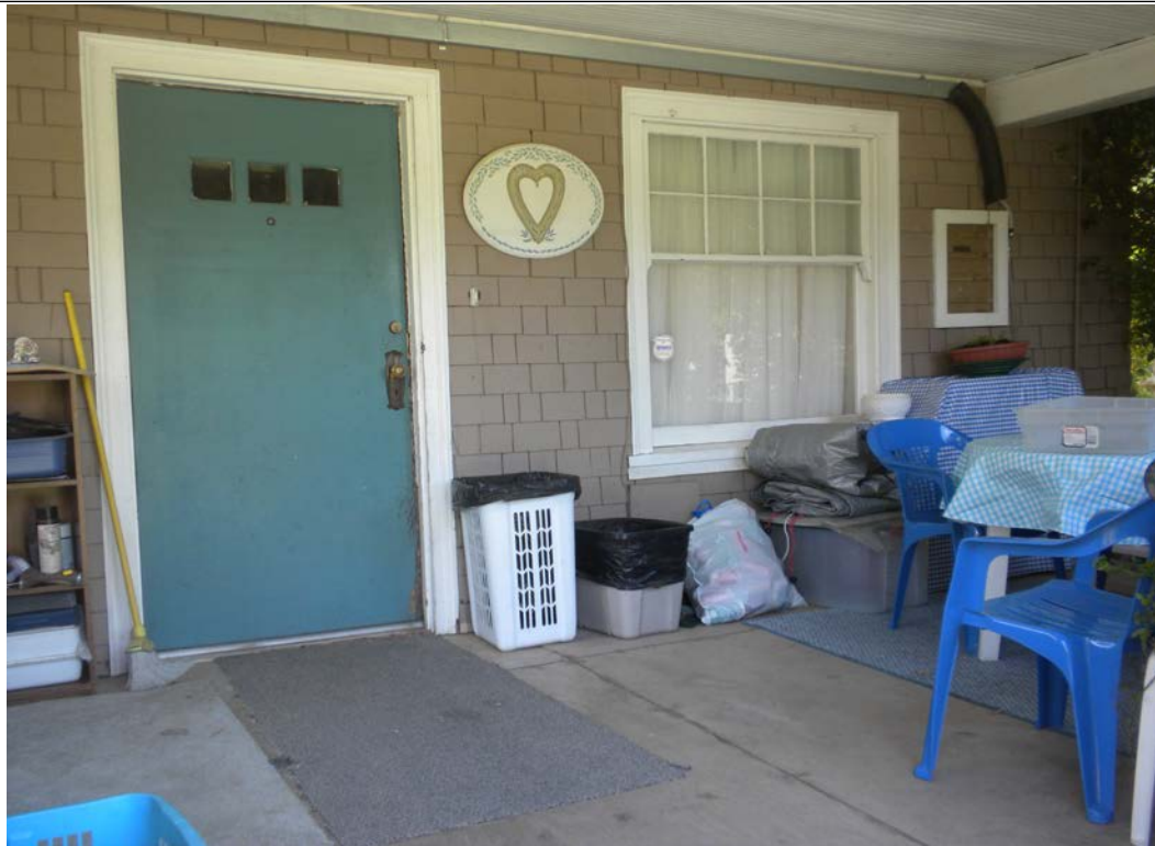
4. Detail of front, looking south