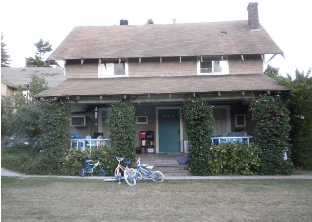
3. Looking southeast at front façade