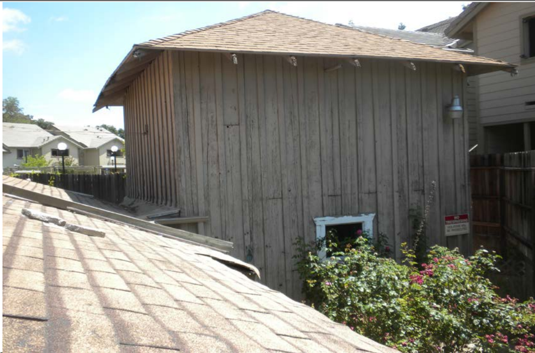
8. Tank house from exterior stairway, looking east