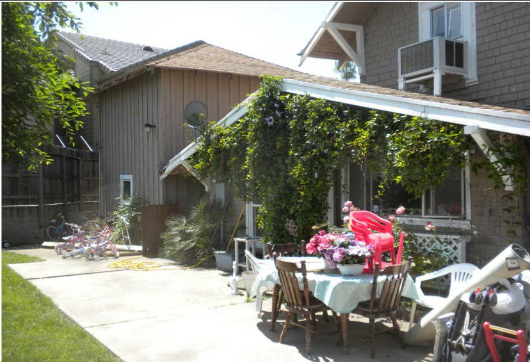
6. Northeast elevation and part of tank house, looking south