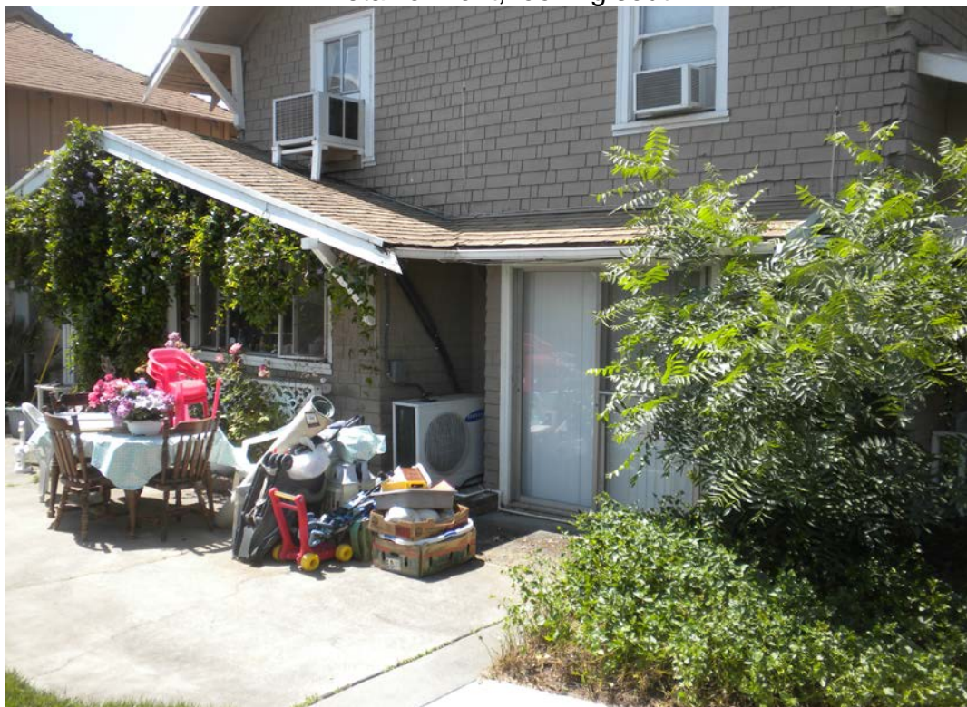
5. Northeast side of residence, looking south