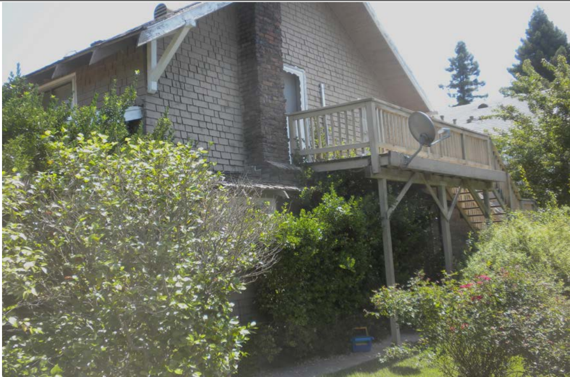
10. Southwestern elevation, looking east