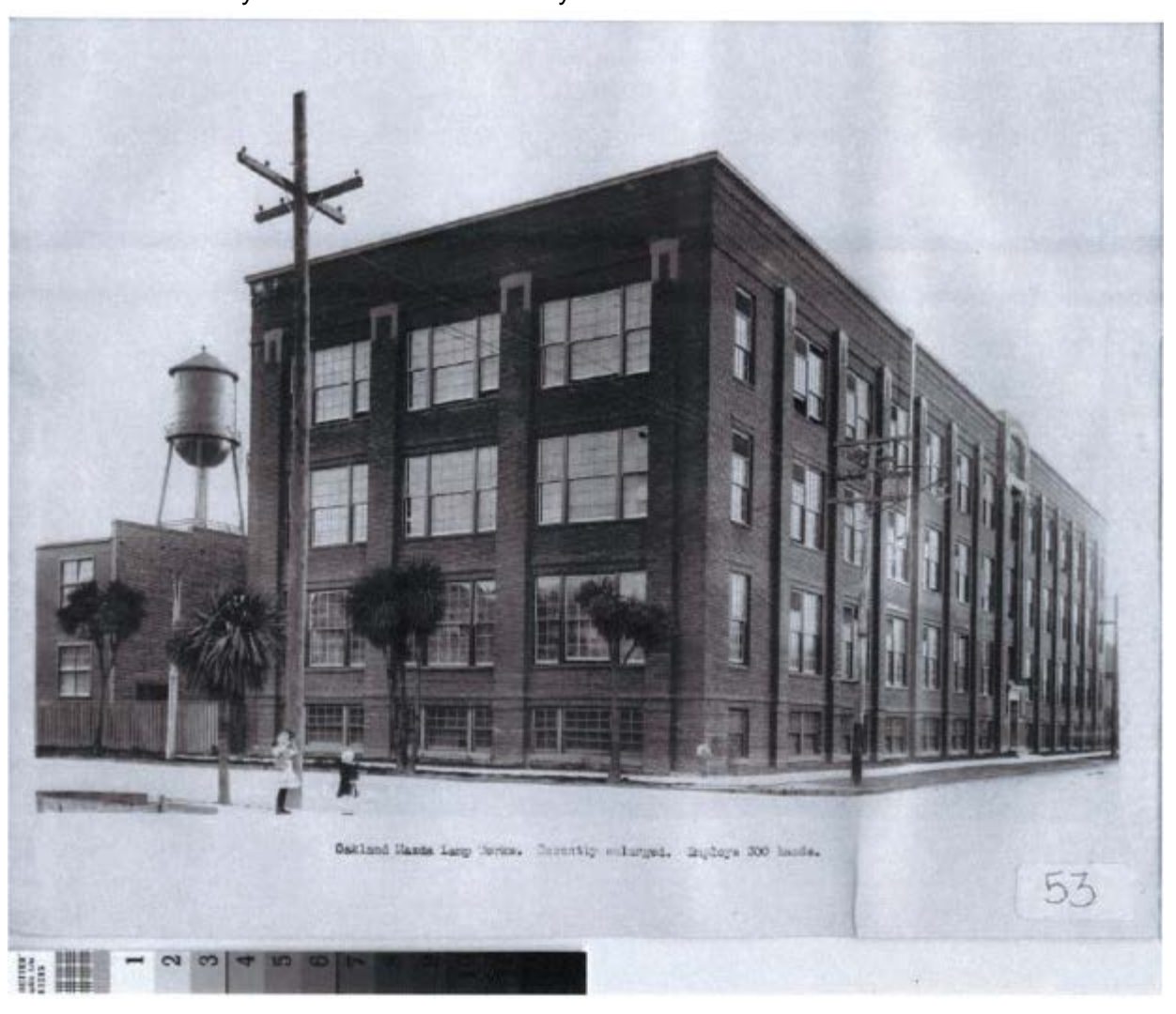
Figure 4 – Oakland Mazda Lamp Works, circa. 1914/1917