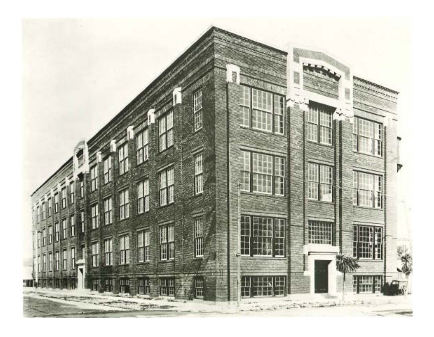
Figure 3 – National Lamp works, Oakland, California, c 1910 Greif, Martin, The new Industrial Landscape: The Story of the Austin Company , 1978