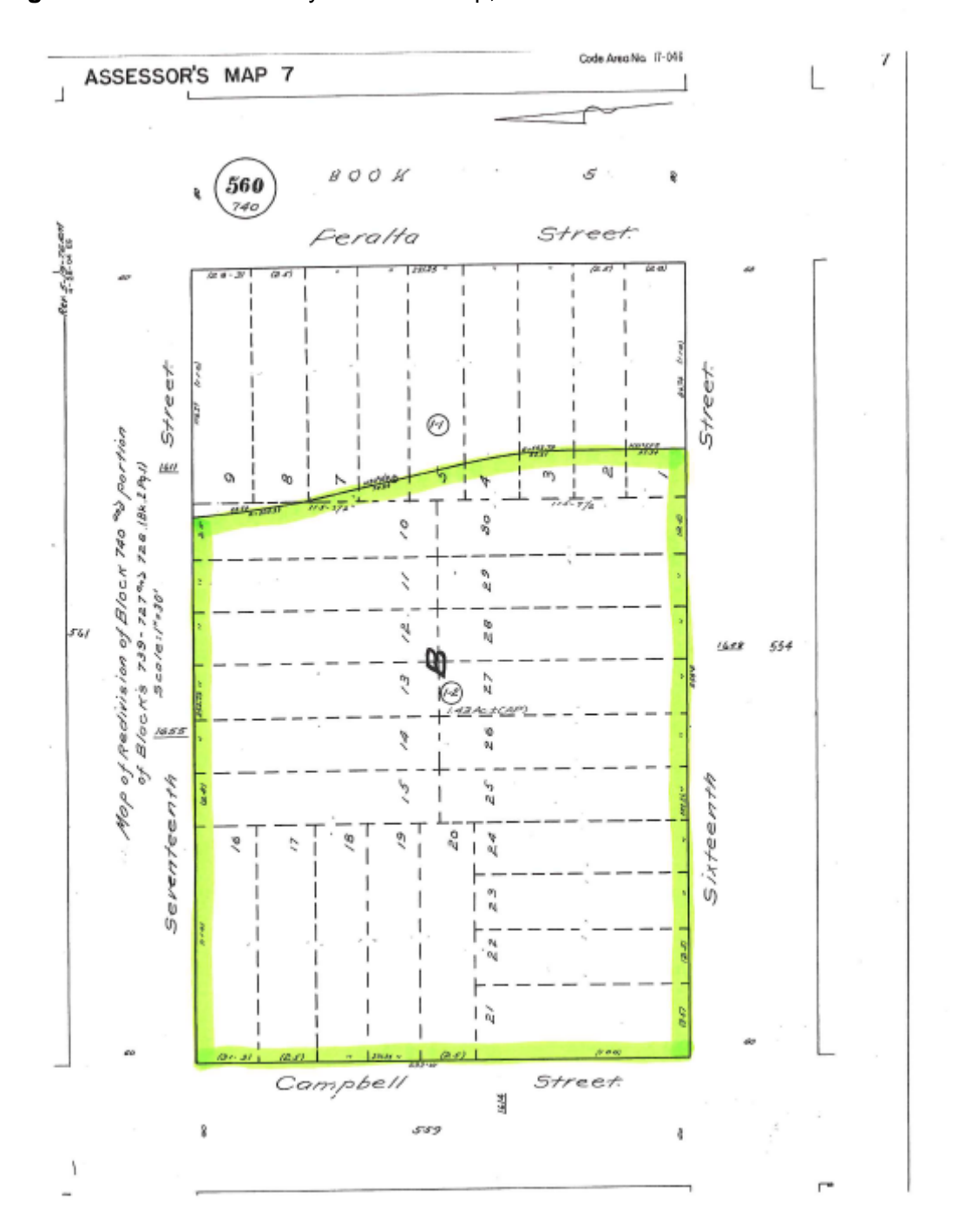
Figure 1 - Alameda County Assessor Map, 2014