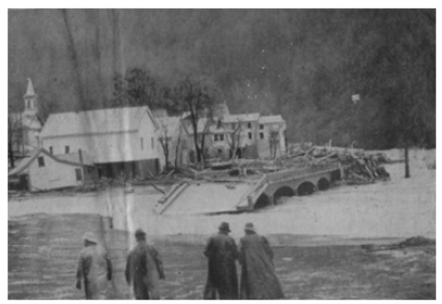
Figure 3. Historic photo of damaged highway bridge, 1937