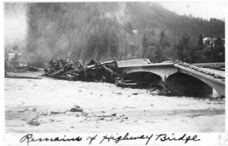
Figure 2. Historic photo of damaged highway bridge, 1937