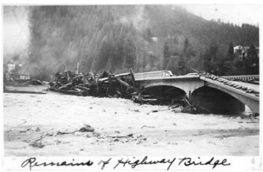
Figure 2. Historic photo of damaged highway bridge, 1937