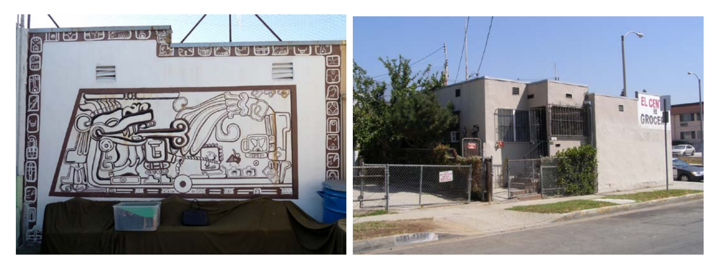
Mural adorning interior south wall of Maravilla Handball Court.