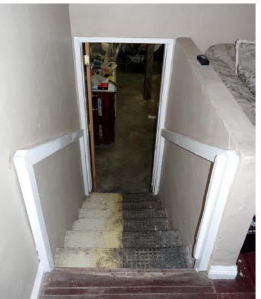
Entrance to El Centro Grocery from residence.