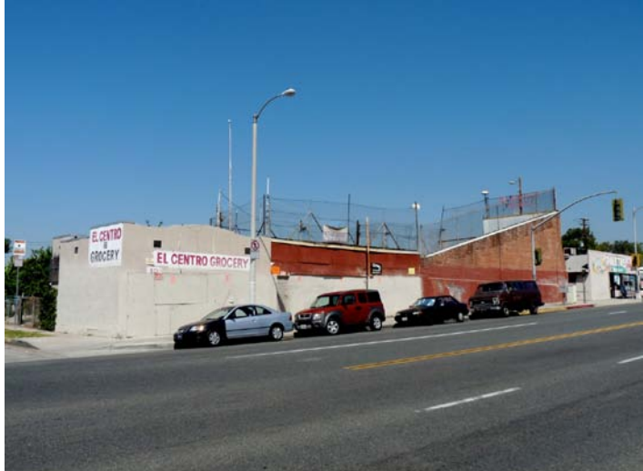
View of east façade of Maravilla Handball Court and El Centro Grocery.