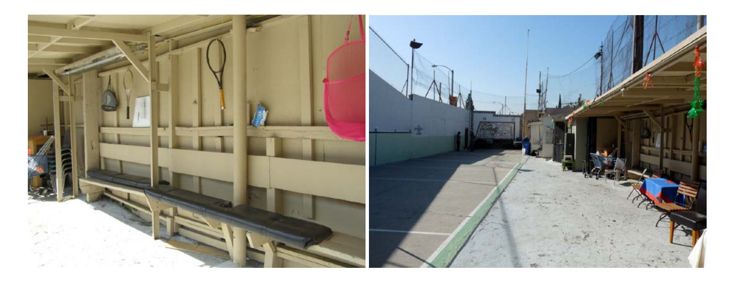
Interior of west wall and storage building at northwest corner of handball court.

West wall of Maravilla Handball Court, note built-in benches.