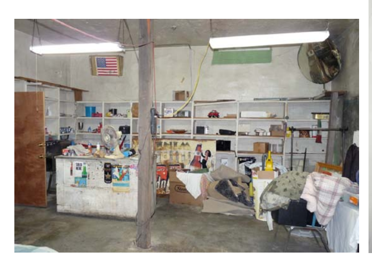
Interior of El Centro Grocery, note built-in shelving.