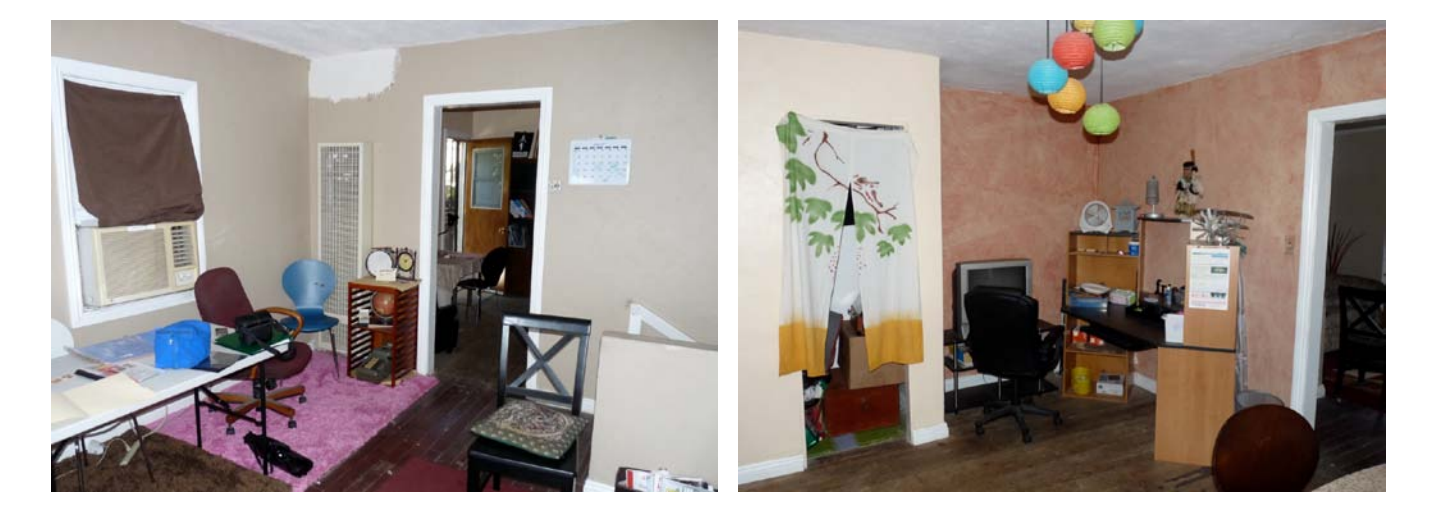
Interior of living room of residence, view looking north.

Interior of bedroom of residence, view looking east.