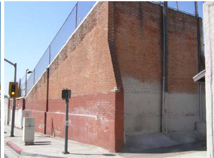
View of original north and east walls of Maravilla Handball Court.