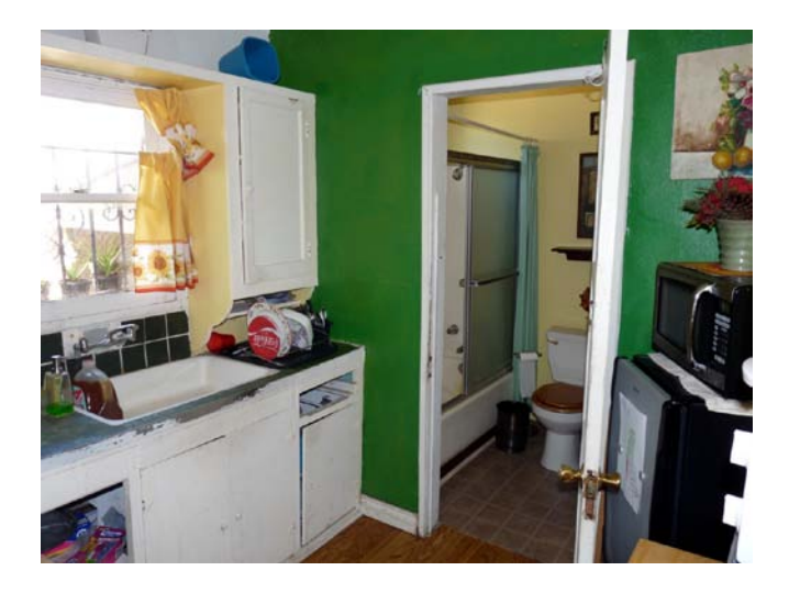
Interior of kitchen and bathroom of residence, view looking north.