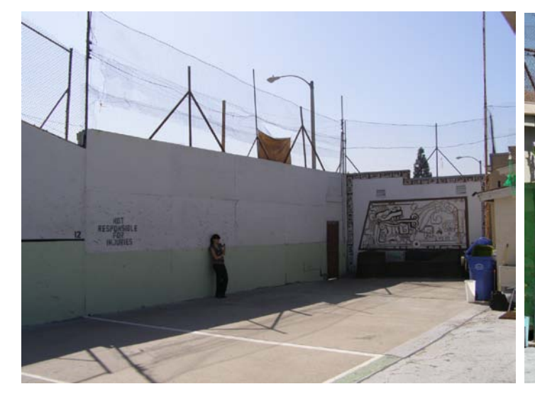
Interior of Maravilla Handball Court, view looking south.