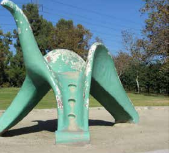
Figure 17: Tripod. View: S.