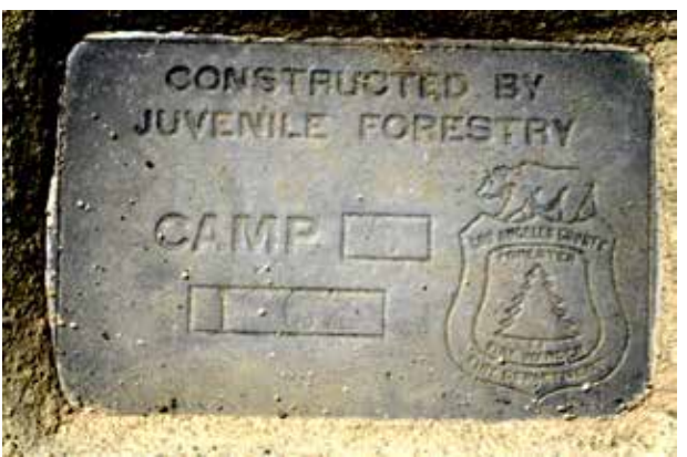
Figure 19: Juvenile Forestry Camp plaque in sandpit ring at the Mother Dragon