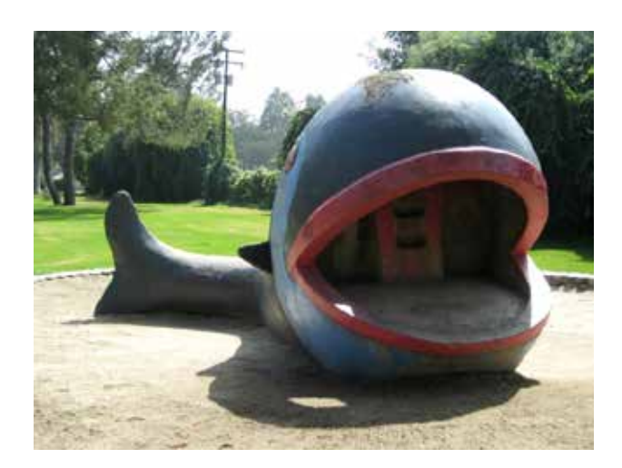
Figure 5: Fish. View: E.

*Date: Jan. 27, 2010 X Continuation • Update