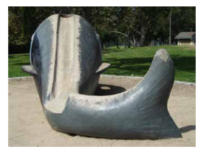
Figure 6: Fish. View: W, NW.