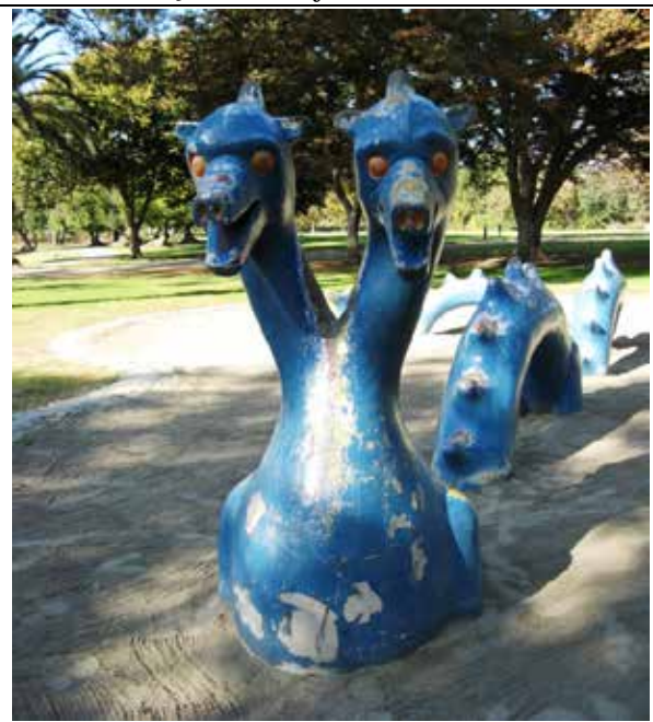
Figure 11: Two-Headed Dragon. View: NE