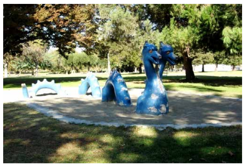
Figure 13: Two-Headed Dragon. View: NE

All photos on this sheet courtesy ICF International. November, 2008