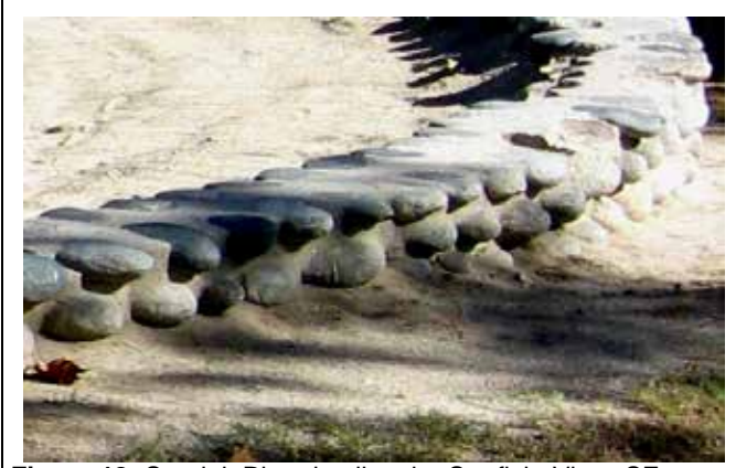
Figure 18: Sandpit Ring detail at the Starfish. View: SE