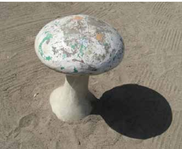
Figure 4: Mother Dragon, Mushroom Detail. View: SW/ downward

All photos on this sheet courtesy ICF International. August, 2008.