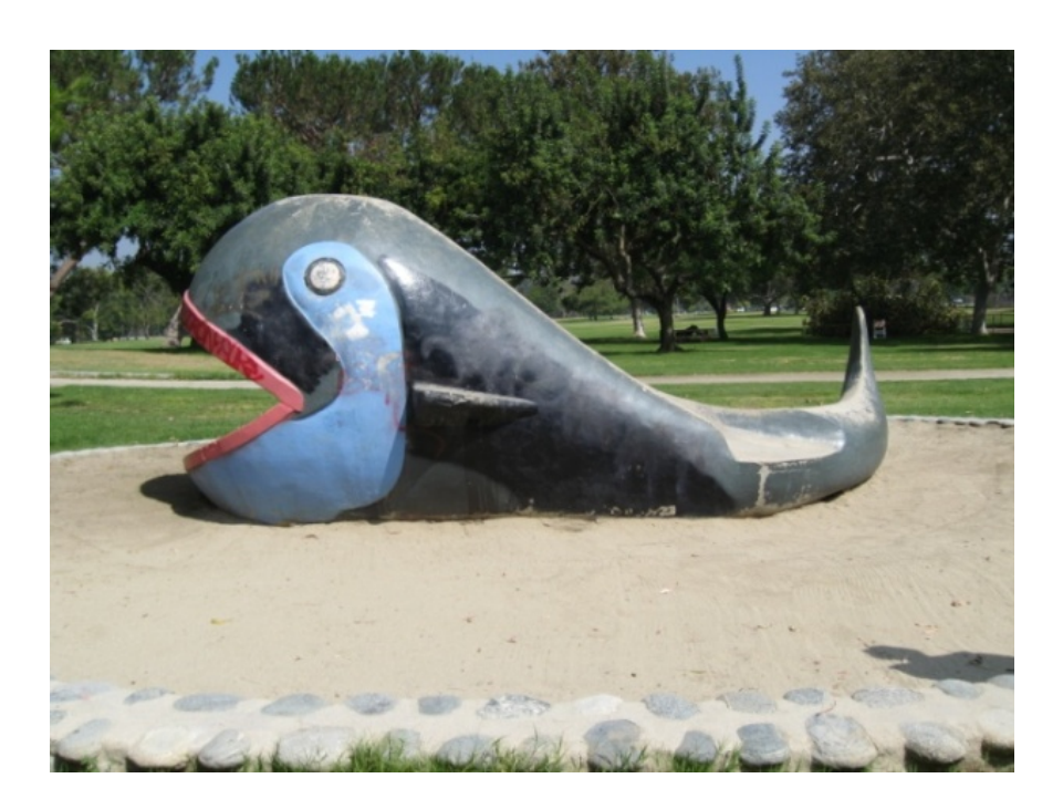
Figure 7: Fish. View: N, NE.

All photos on this sheet Courtesy ICF Jones & Stokes. August, 2008.