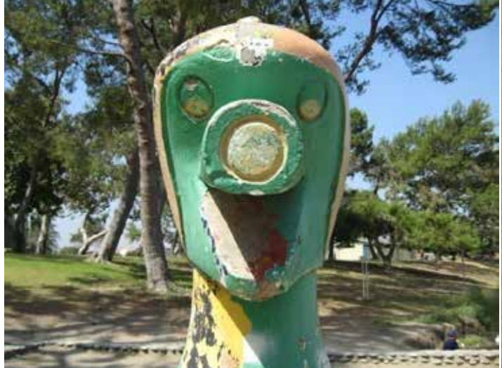
Figure 3: Mother Dragon, face detail. View: W