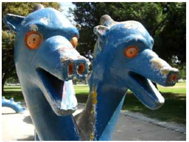
Figure 12: Two-Headed Dragon, face detail. View: NE