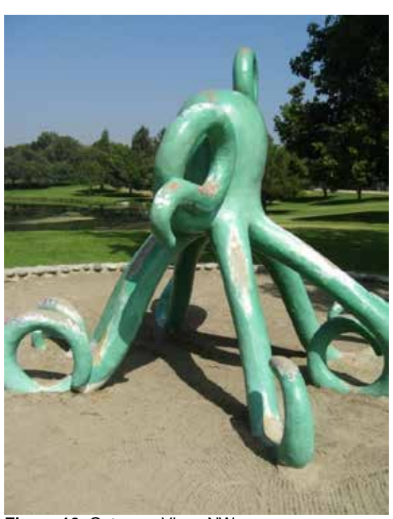
Figure 10. Octopus. View: NW.

All photos on this sheet courtesy ICF Jones & Stokes. August, 2008.