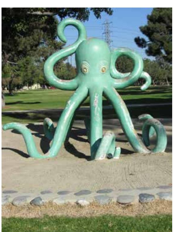
Figure 8: Octopus. View: E.