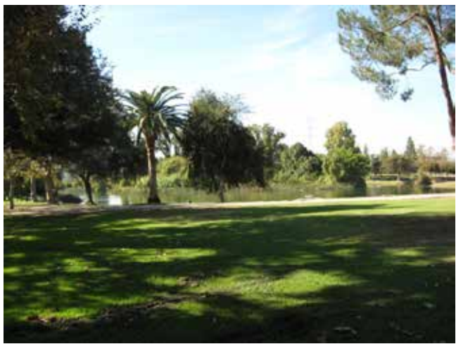
Figure 20: Lakes Area Parkland, E. of Center Lake. View: W Figure 21: Landscape and Center Lake. View: SW.