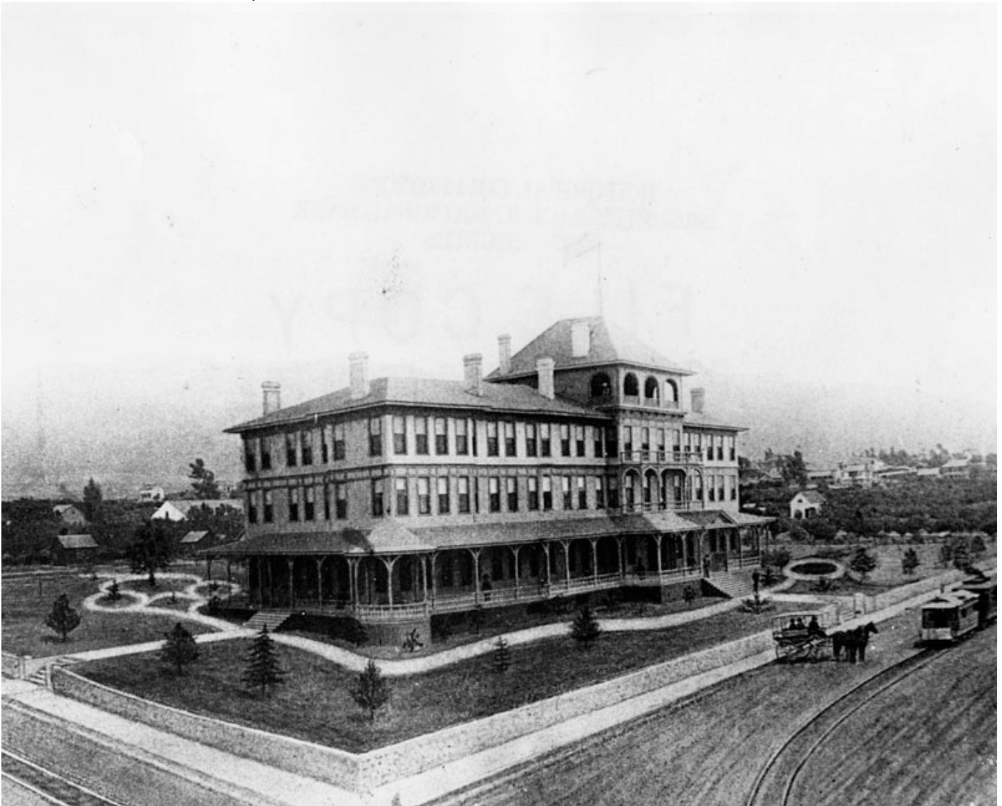
View facing northeast