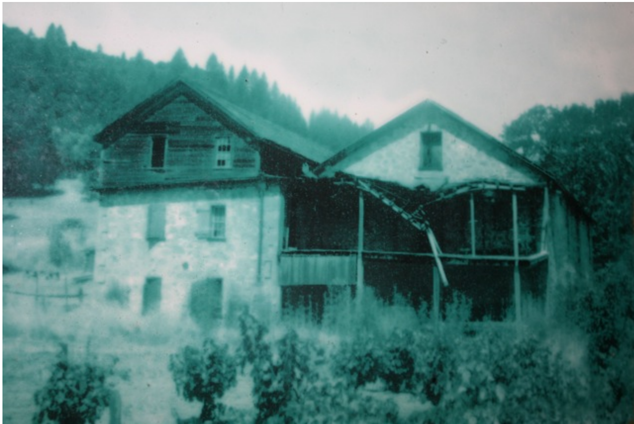
Figure 5. South Façade of the J.C. Weinberger Winery, c. 1935.