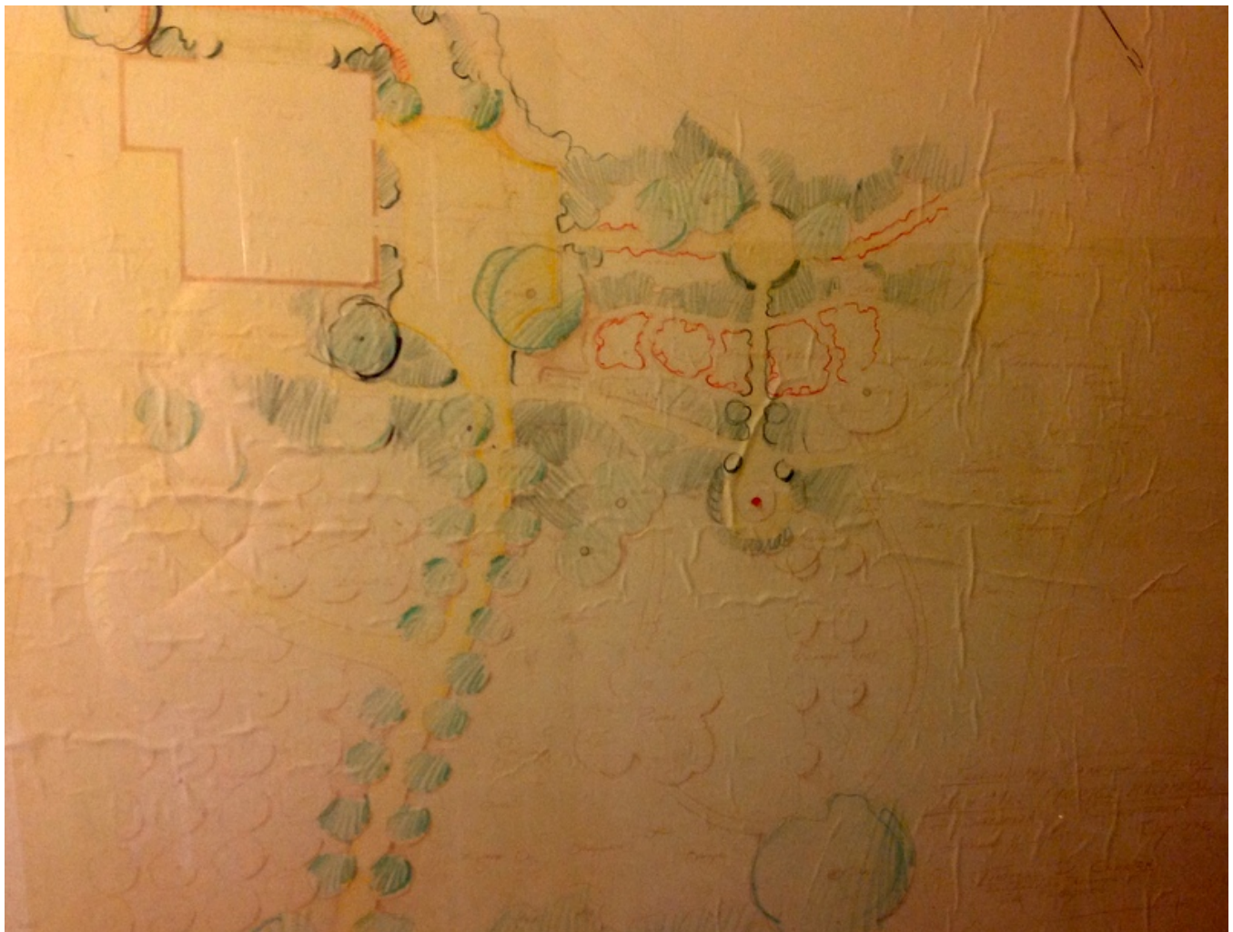
Figure 6. Garden Study of the Harrison Property Landscape by Thomas D. Church, October 1938.