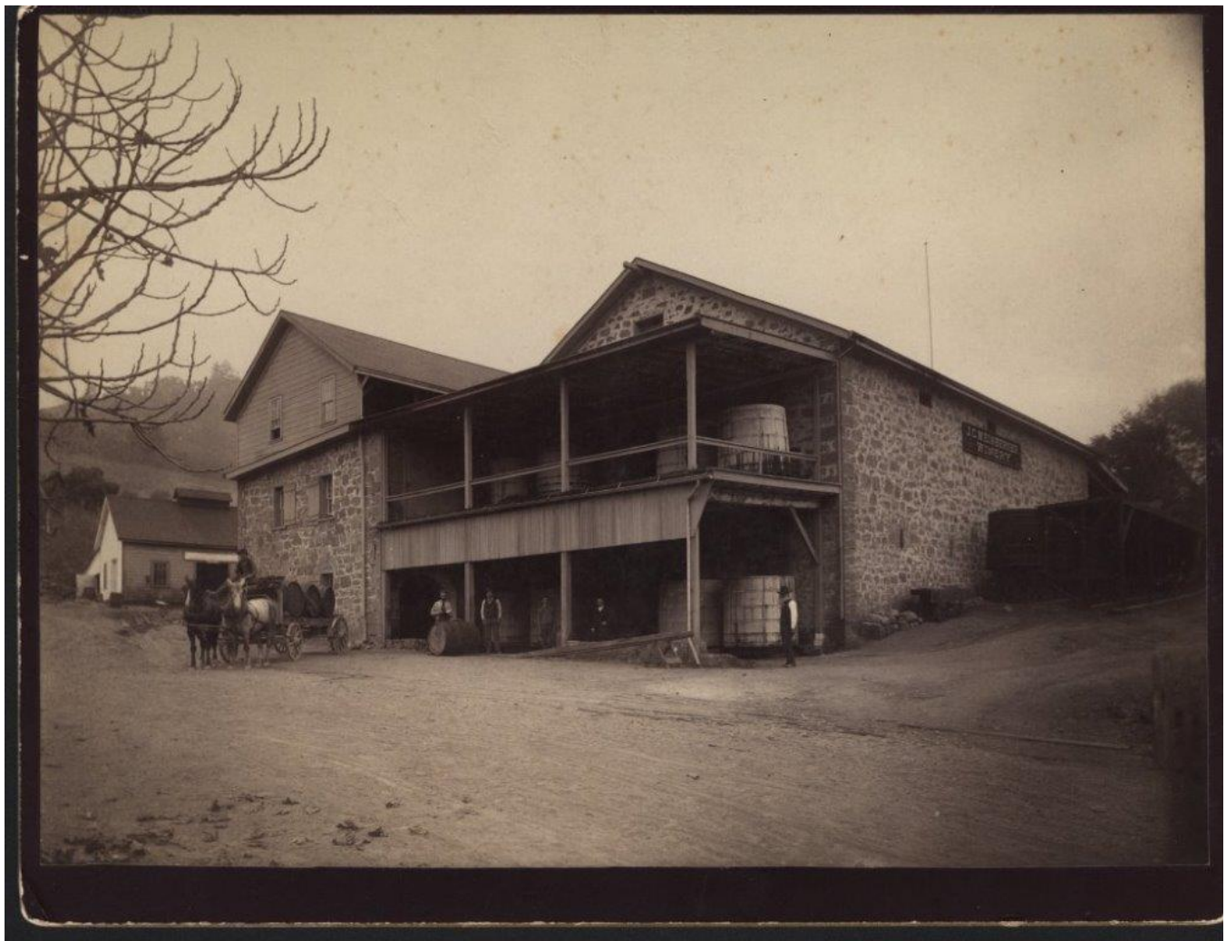
Figure 3. South and East Façades of the J.C. Weinberger Winery, c. 1890.