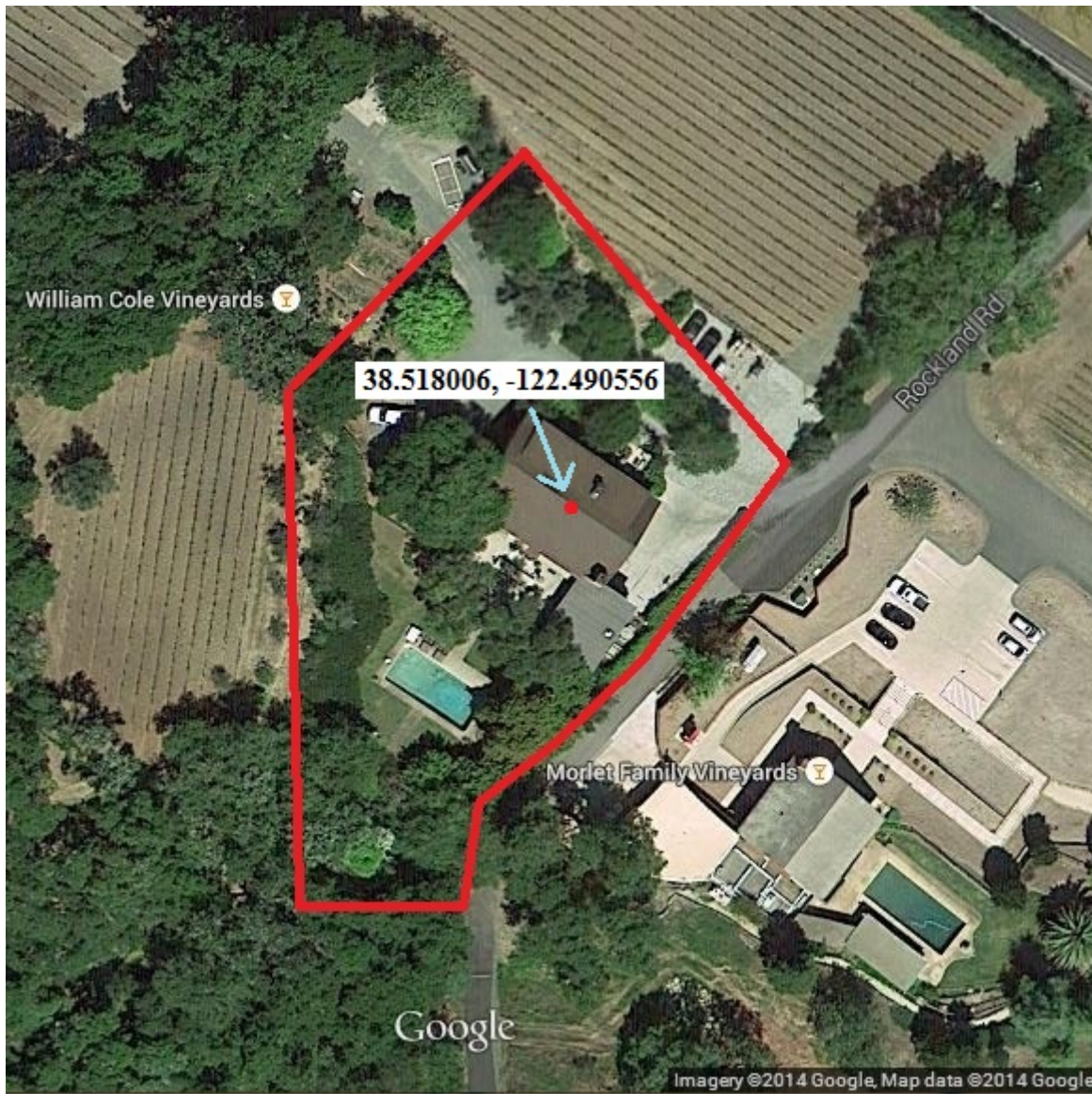
Figure 7. J.C. Weinberger Property Boundaries and GPS Location, 2014.