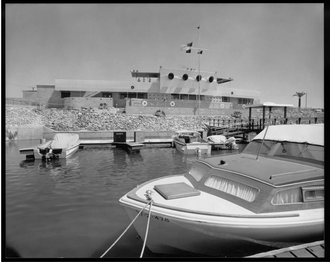
Copyright The J. Paul Getty Trust. The Getty Research Institute, Los Angeles. ID no. : gti_2004_r_10_b0036_f014_2960_01. Digital images and files are provided for study purposes only. Copyright restrictions apply. For copyright information or higher resolution images visit: http://hdl.handle.net/10020/repro_perm .