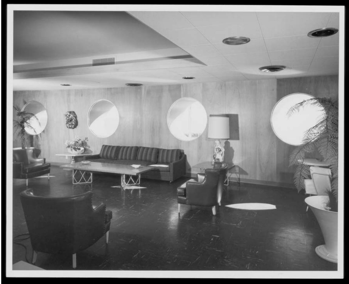
Figure 4. Interior view, second story, looking southwest, 1960.

Copyright The J. Paul Getty Trust. The Getty Research Institute, Los Angeles. ID no. : gri_2004_r_10_b0036_f014_2960_17. Digital images and files are provided for study purposes only. Copyright restrictions apply. For copyright information or higher resolution images visit: http://hdl.handle.net/10020/repri_perm .