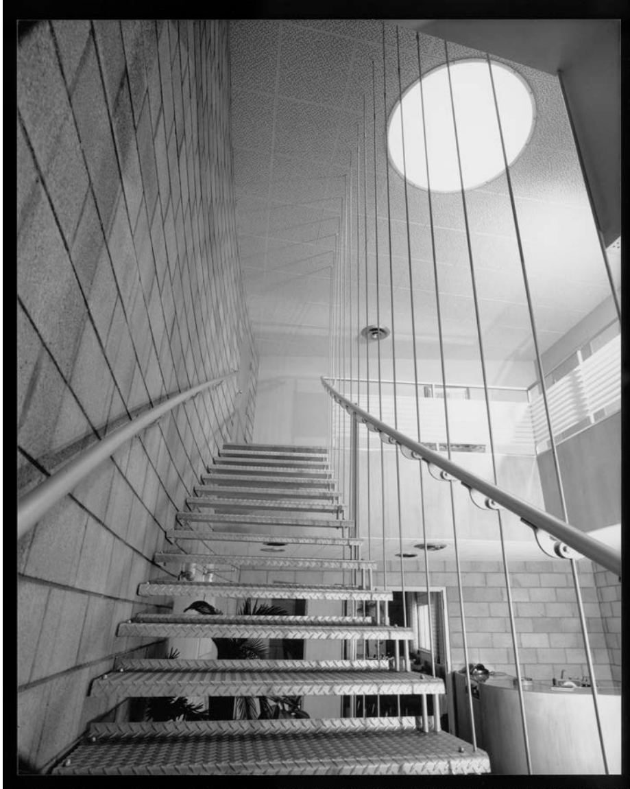
Figure 1. Interior staircase, looking northwest, 1960.

ID no.: gri_2004_r_10_b0036_f014_2960_15. Digital images and files are provided for study purposes only. Copyright restrictions apply. For copyright information or higher resolution images visit: http://hdl.handle.net/10020/repre_perm .