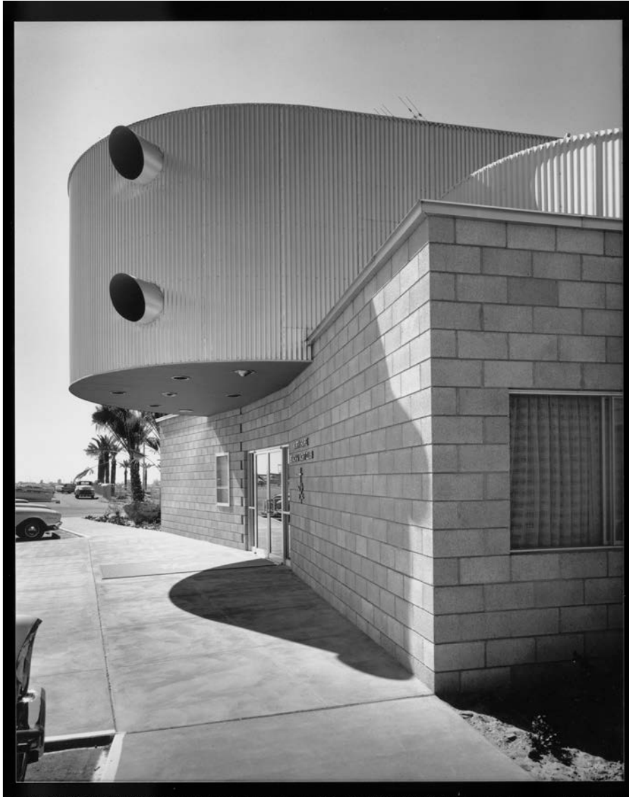
Figure 3. Northeast elevation, looking south, 1960.

Copyright The J. Paul Getty Trust, The Getty Research Institute, Los Angeles. ID no.: gri_2004_r_10_b0036_f014_2960_07. Digital images and files are provided for study purposes only. Copyright restrictions apply. For copyright information or higher resolution images visit: http://hdl.handle.net/10020/repro_perm .