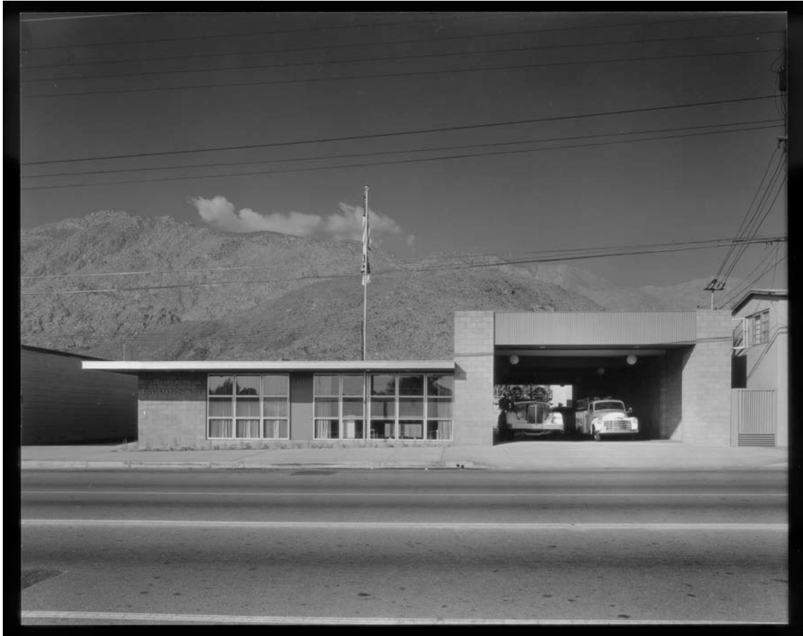
Figure 1. Primary (east) elevation, looking west, 1958.

Copyright The J. Paul Getty Trust. The Getty Research Institute, Los Angeles. ID no.: gri_2004_r_10_b0022_f024_2537_01. Digital images and files are provided for study purposes only. Copyright restrictions apply. For copyright information or higher resolution images visit: http://hdl.handle.net/10020/repro_perm .