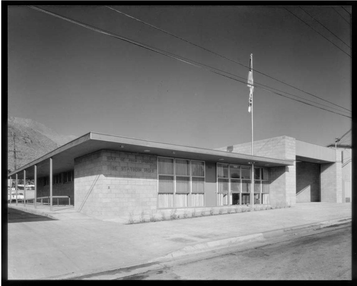
Figure 2. East and south elevations, looking northwest, 1958.

ID no.: g1_2004_f_10_b0022_1024_2537_02. Digital images and files are provided for study purposes only. Copyright restrictions apply. For copyright information or higher resolution images visit: http://hdl.handle.net/10020/repro_perm .