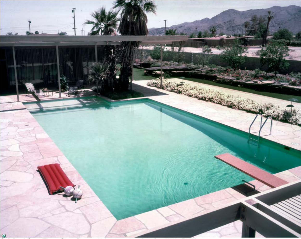
Figure 1. West elevation, looking southeast, 1956