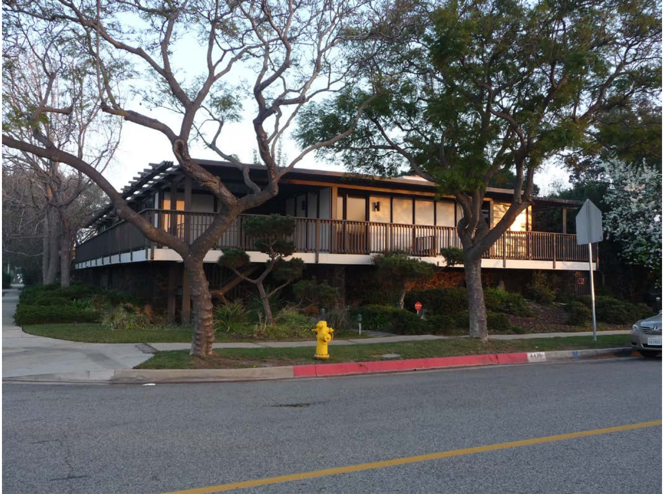
CA_Los Angeles County_View Park Historic District_41.TIF 4476 Mount Vernon Drive, Mid-Century Modern residence by architect Charles W. Wong, facing east