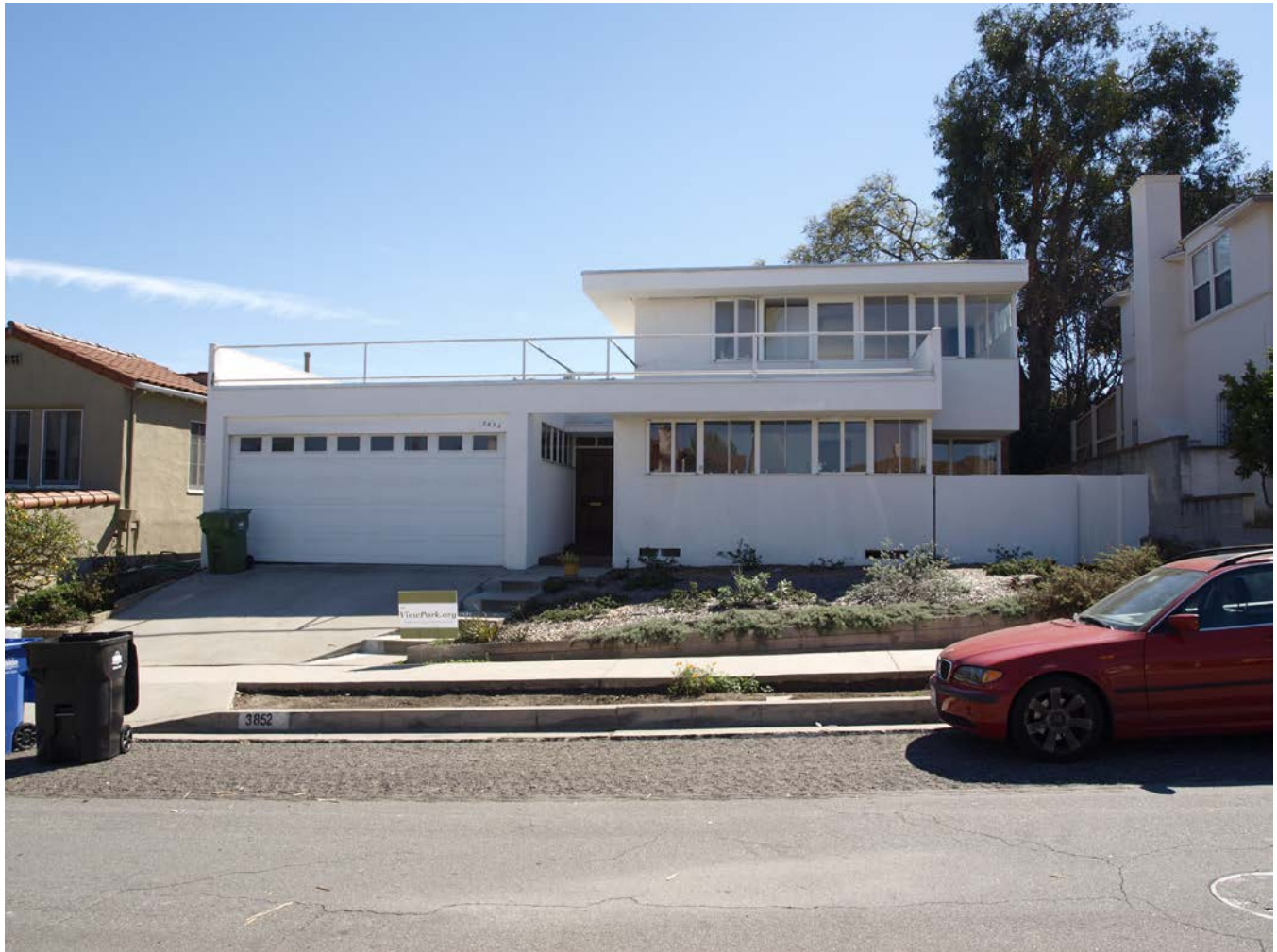
CA_Los Angeles County_View Park Historic District_42.TIF 3852 Olympiad Drive, Driveury House, International Style residence by architect Raphael Soriano, facing south