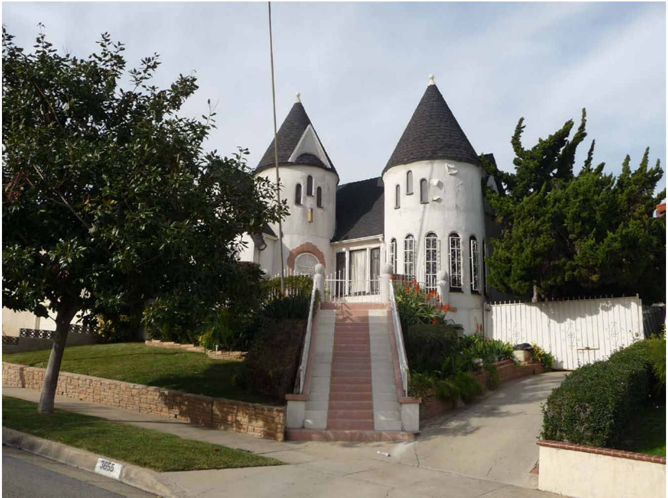
CA_Los Angeles County_View Park Historic District_19.TIF 3655 Mount Vernon Drive, Storybook residence, camera facing north