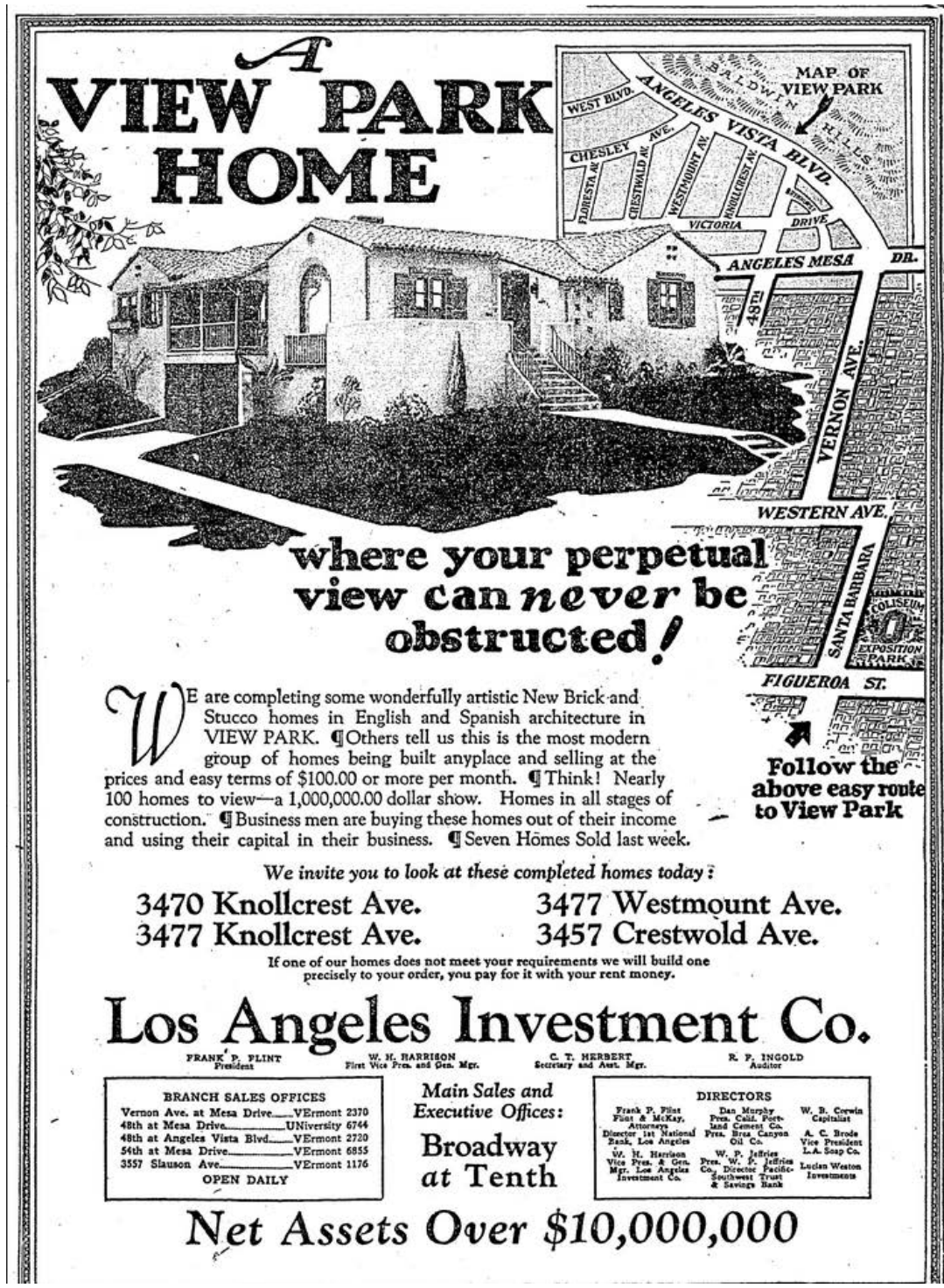
Figure 2: Display Ad, Los Angeles Times, November 8, 1925.

Section number Additional Documentation Page 5