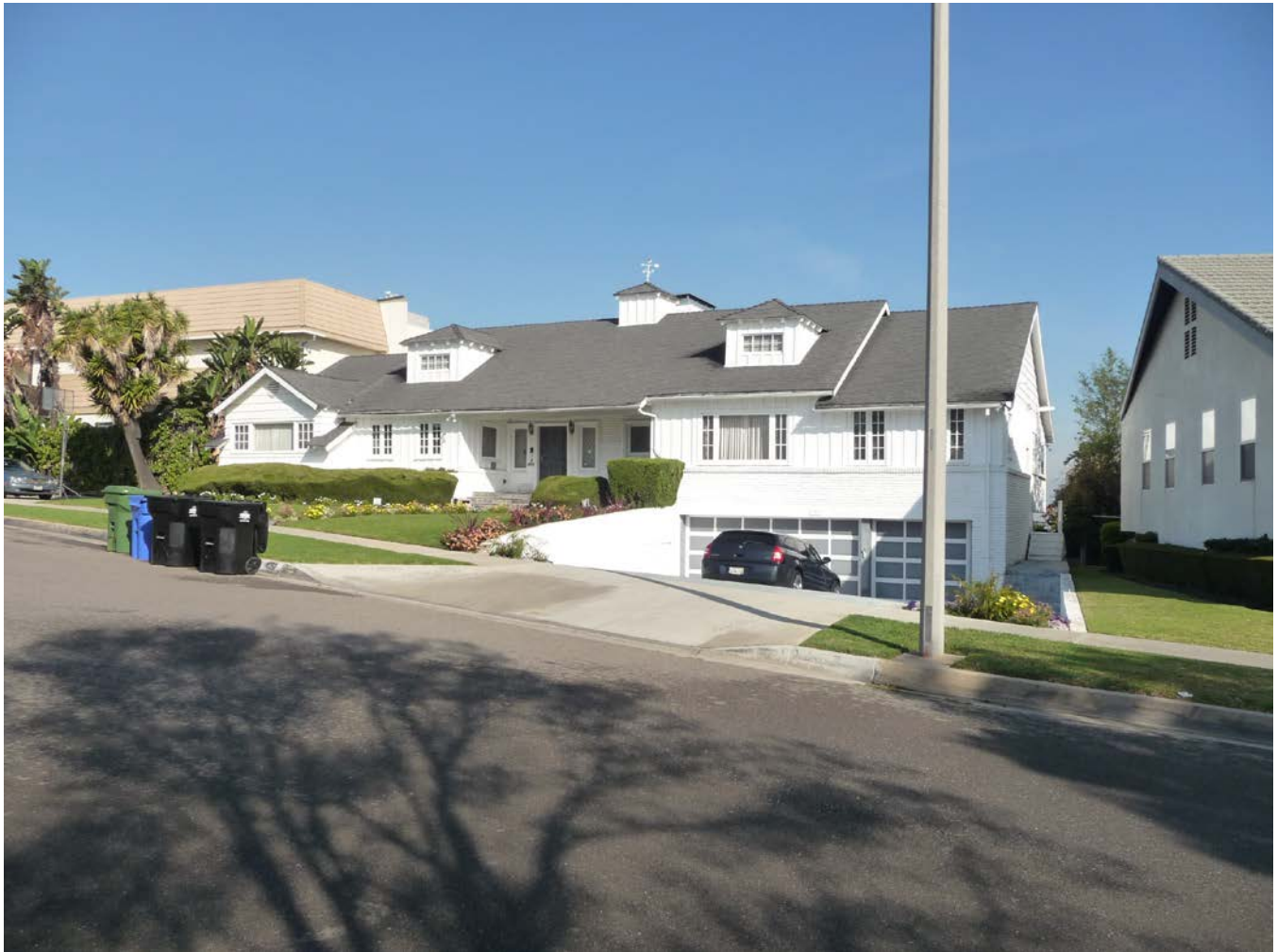
CA_Los Angeles County_View Park Historic District_26.TIF 4057 Kenway Avenue, Traditional Ranch residence, facing north