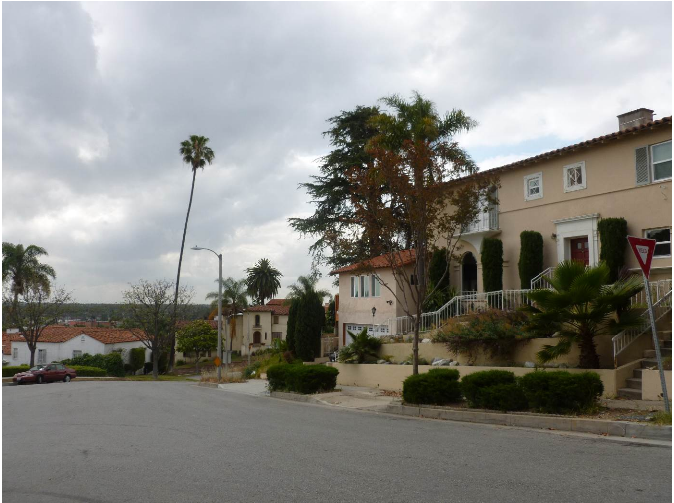
CA_Los Angeles County_View Park Historic District_05.TIF Aureola Boulevard and Palmero Boulevard, streetscape, facing southeast