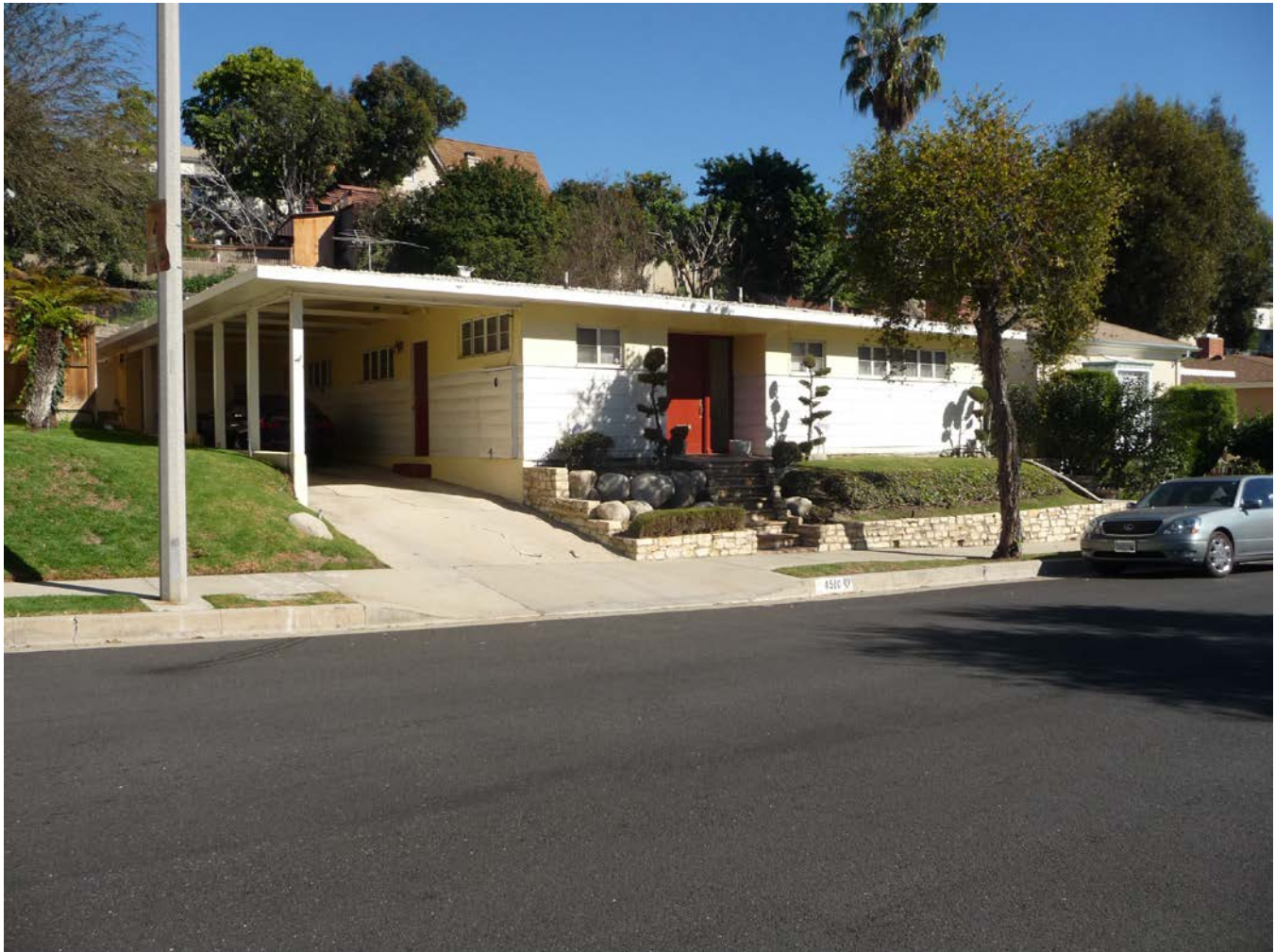
CA_Los Angeles County_View Park Historic District_32.TIF 4510 S Mullen Avenue, Contemporary Ranch residence, facing northeast