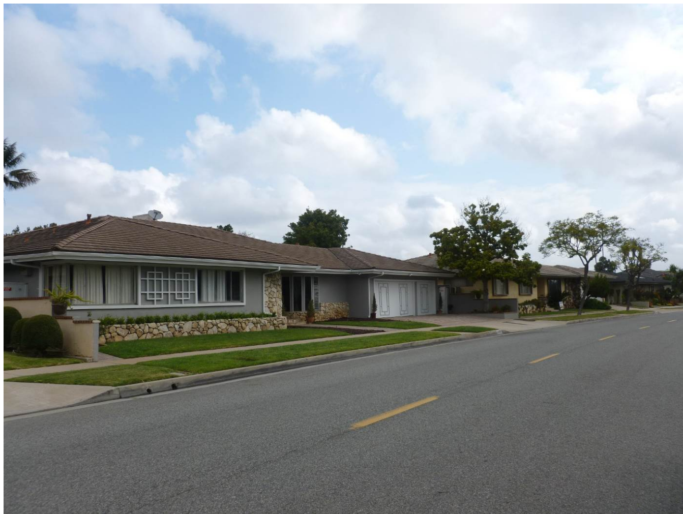
CA_Los Angeles County_View Park Historic District_07.TIF Mount Vernon Boulevard, streetscape, facing northeast