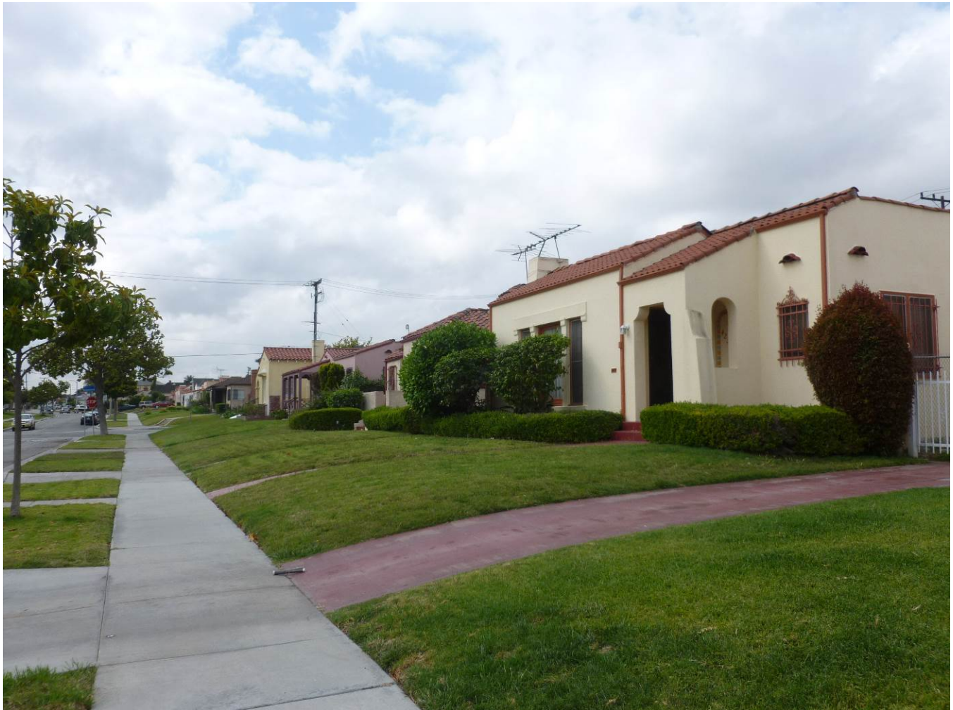
CA_Los Angeles County_View Park Historic District_04.TIF Victoria Avenue, streetscape, facing southeast