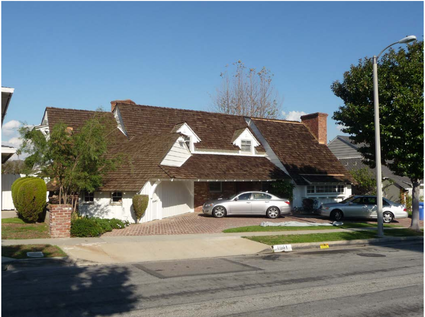
CA_Los Angeles County_View Park Historic District_31.TIF 4061 Olympiad Drive, Traditional Ranch residence, facing north