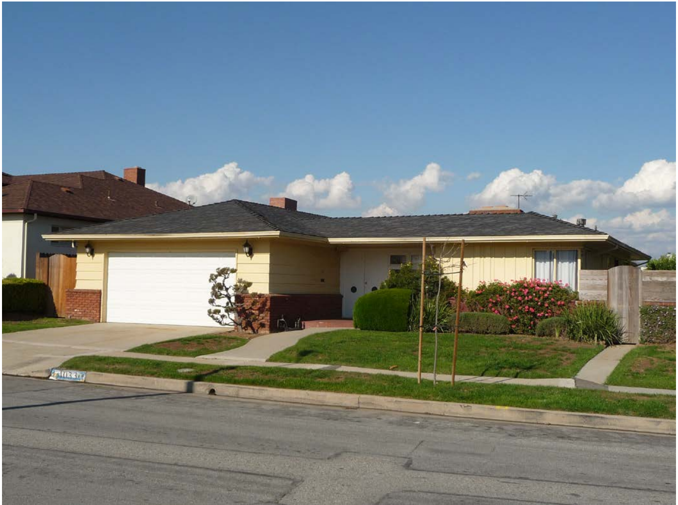
CA_Los Angeles County_View Park Historic District_30.TIF 4033 Olympiad Drive, Minimal Ranch residence, facing north