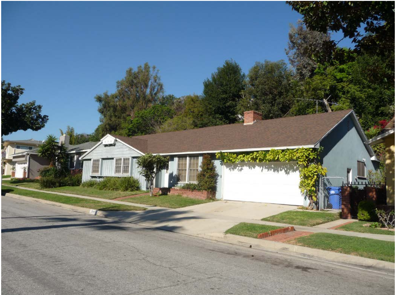
CA_Los Angeles County_View Park Historic District_24.TIF 3965 Fairway Boulevard, Traditional Ranch residence, facing north