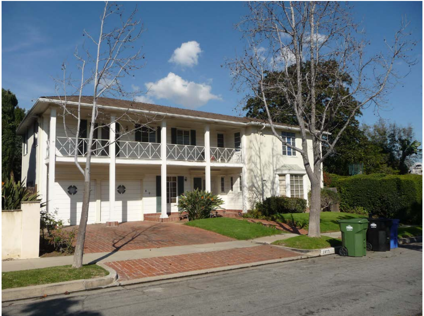
CA_Los Angeles County_View Park Historic District_21.TIF 3911 Olympiad Drive, Monterey Revival residence, facing northwest