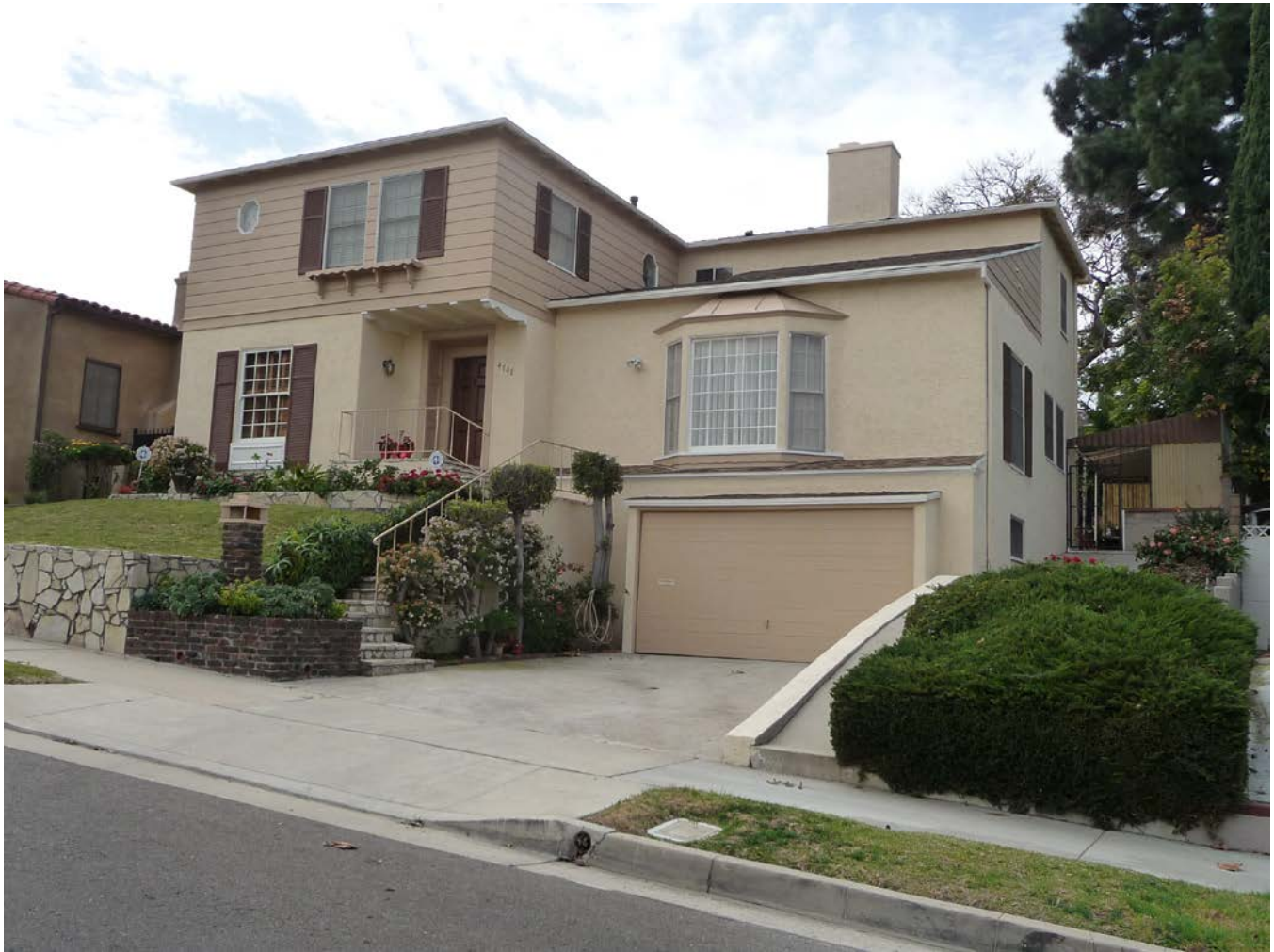
CA_Los Angeles County_View Park Historic District_35.TIF 4707 Keniston Avenue, Minimal Traditional residence, facing west