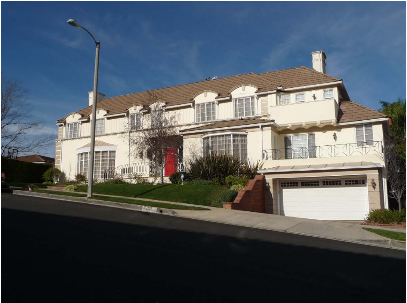
CA_Los Angeles County_View Park Historic District_20.TIF 3717 Northland Drive, American Colonial Revival residence, facing northwest