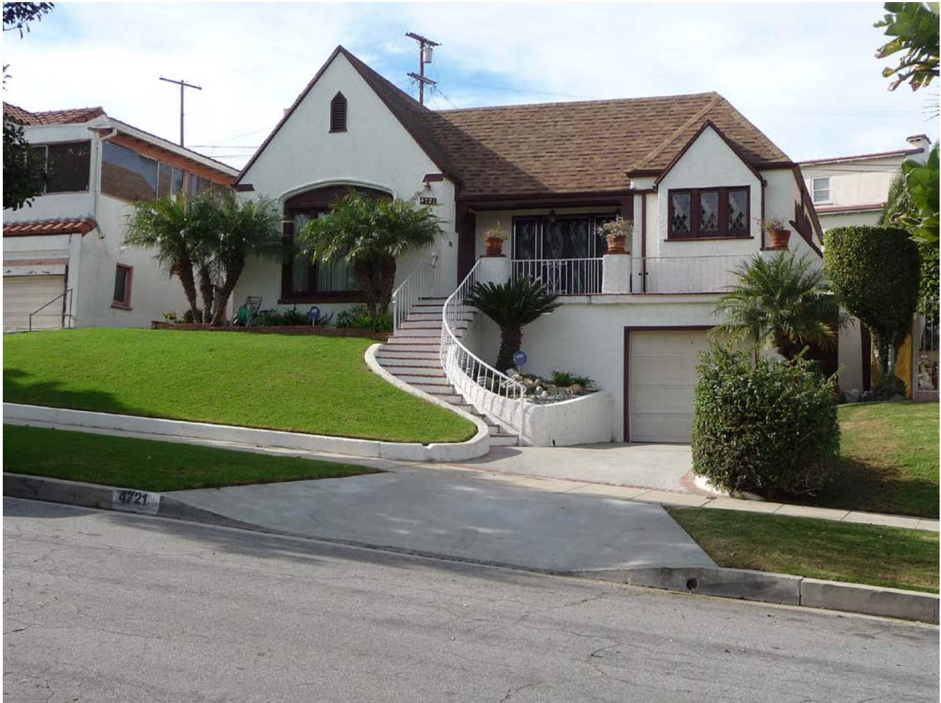
CA_Los Angeles County_View Park Historic District_15.TIF 4721 Brynhurst Avenue, Tudor Revival residence, facing west