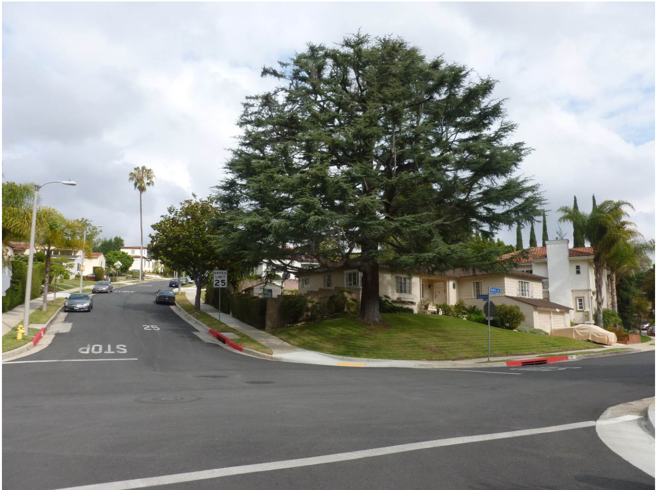
CA_Los Angeles County_View Park Historic District_09.TIF Mullen Avenue, looking northeast