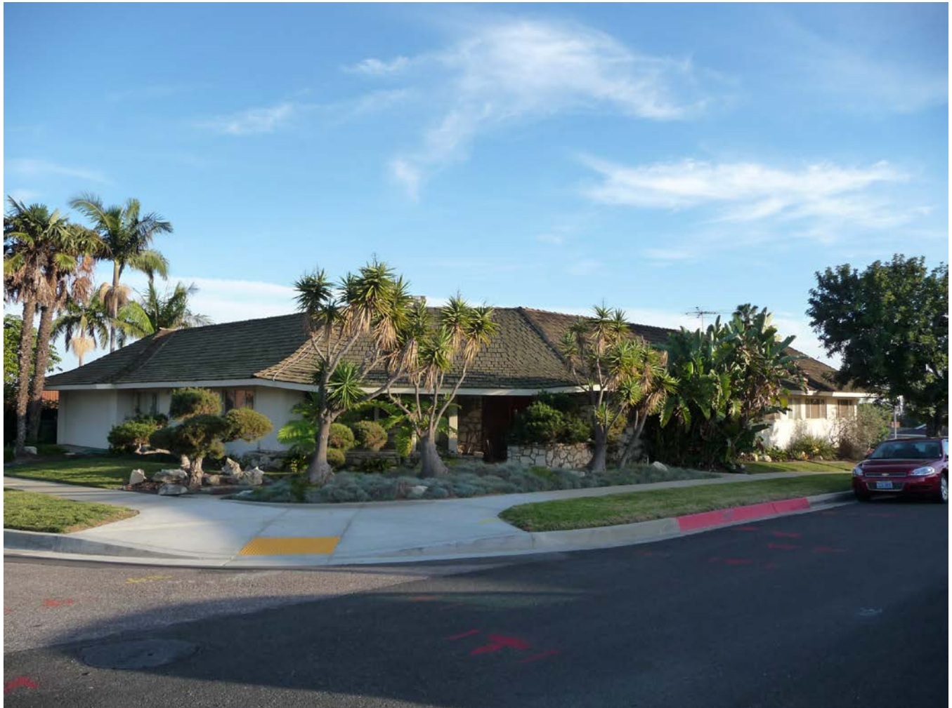
CA_Los Angeles County_View Park Historic District_28.TIF 4130 Monteith Drive, Oriental Ranch residence, facing south