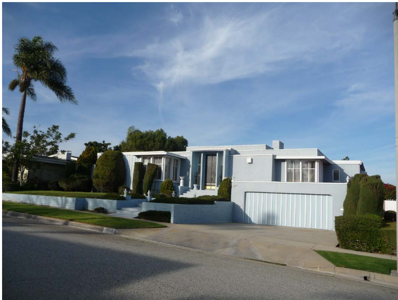
CA_Los Angeles County_View Park Historic District_40.TIF 4848 Inadale Avenue, Mid-Century Modern residence, facing northeast