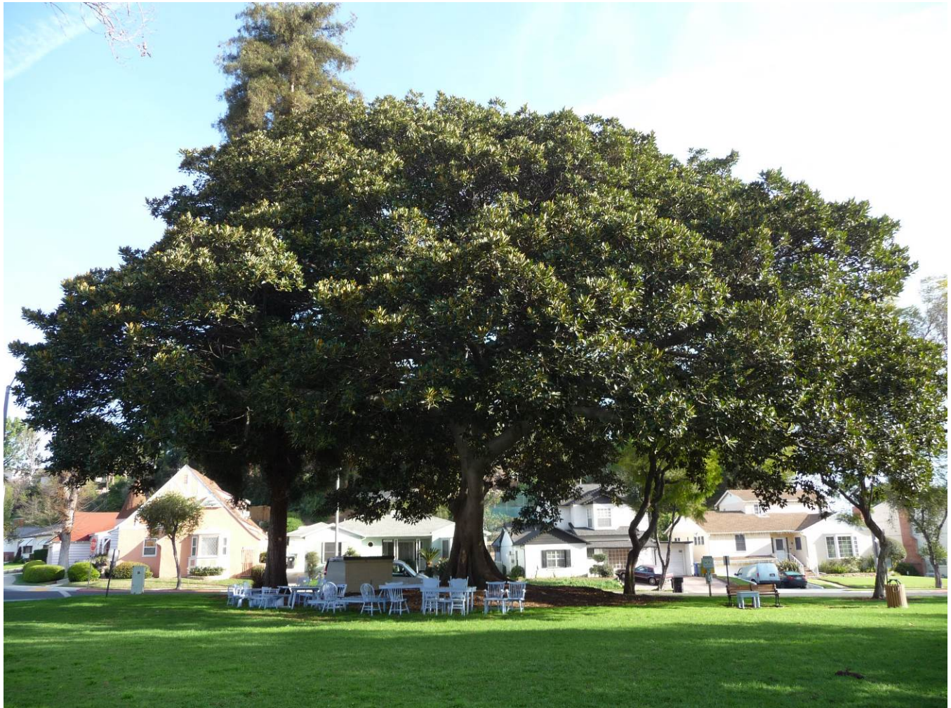
CA_Los Angeles County_View Park Historic District_43.TIF Monteith Park, facing north