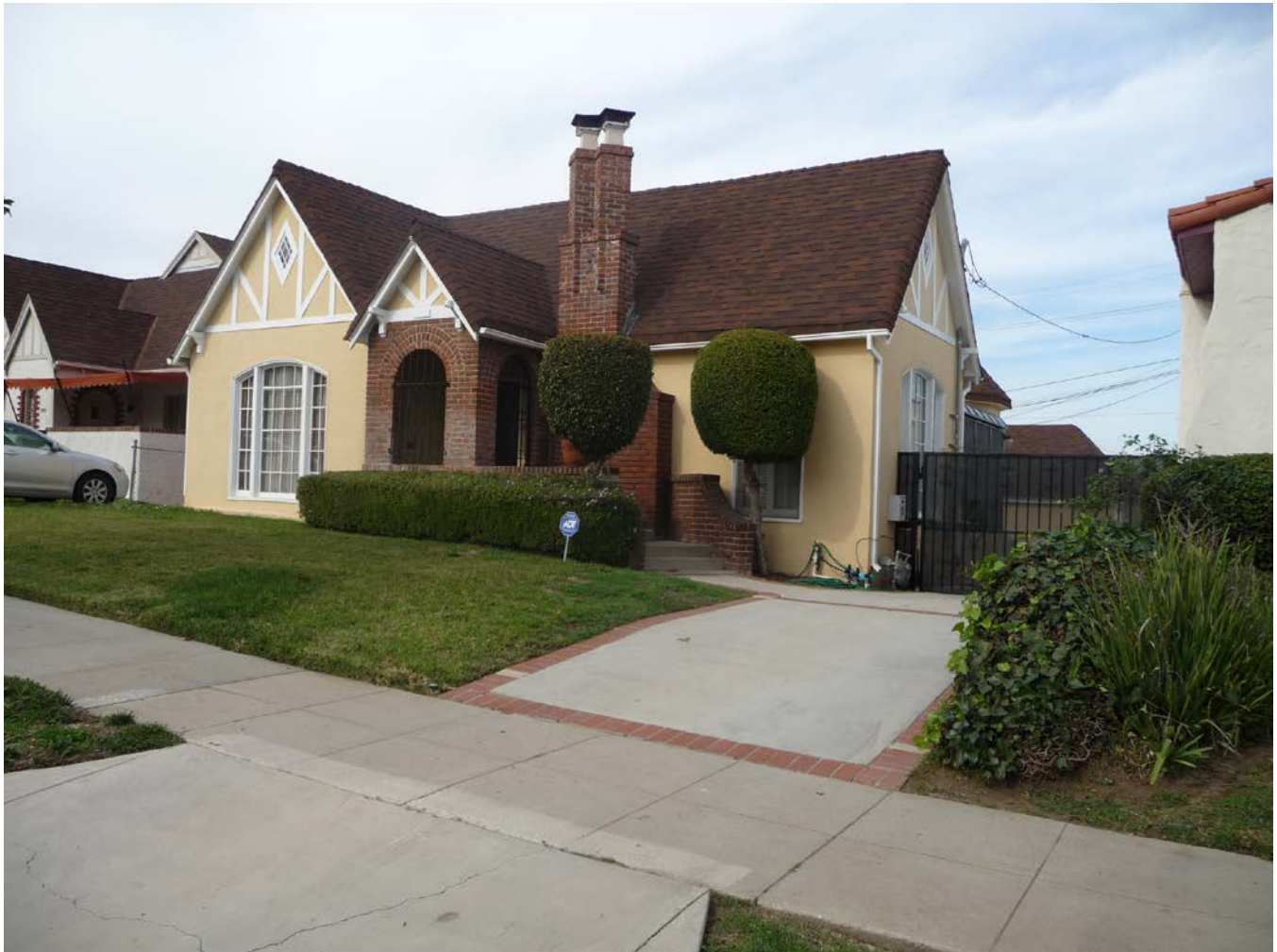
CA_Los Angeles County_View Park Historic District_18.TIF 3471 Mount Vernon Drive, Tudor Revival residence, facing north