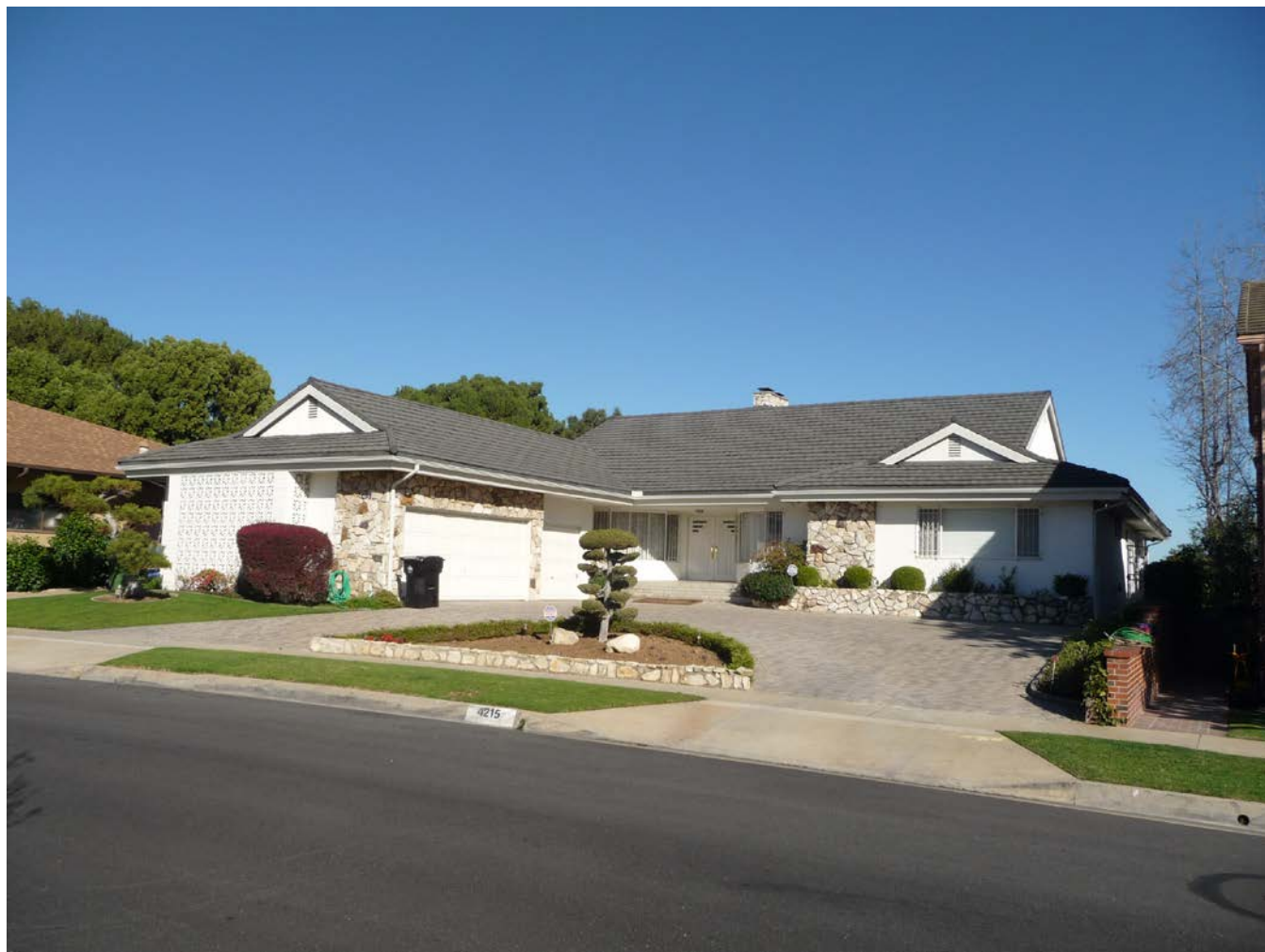
CA_Los Angeles County_View Park Historic District_23.TIF 4215 Enoro Drive, Oriental Ranch residence, facing east