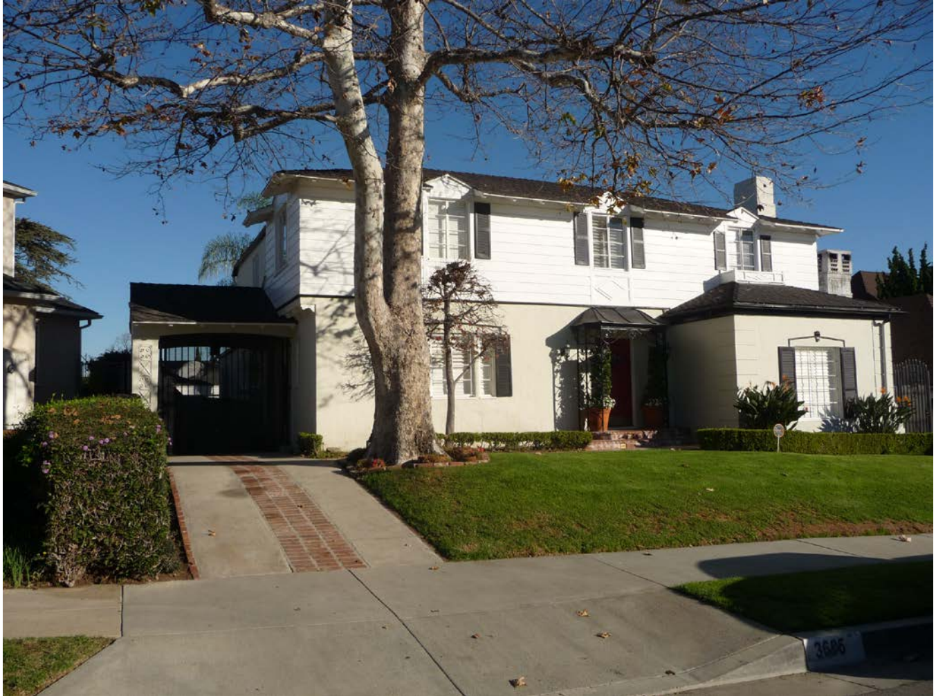
CA_Los Angeles County_View Park Historic District_34.TIF 3695 Fairway Boulevard, Minimal Traditional residence, facing north