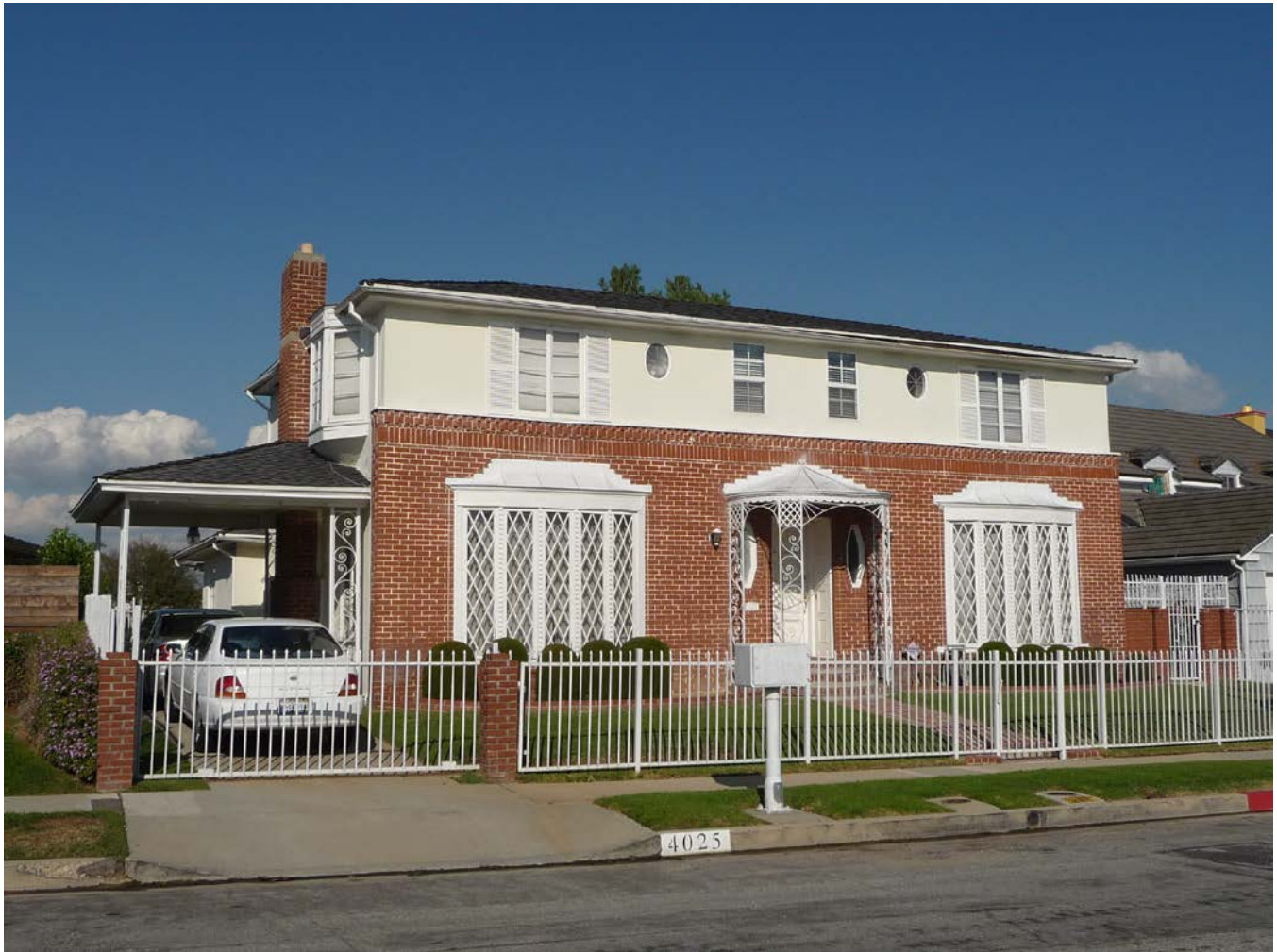
CA_Los Angeles County_View Park Historic District_36.TIF 4025 Olympiad Drive, residence of Evangeline and Elly Woods, facing north