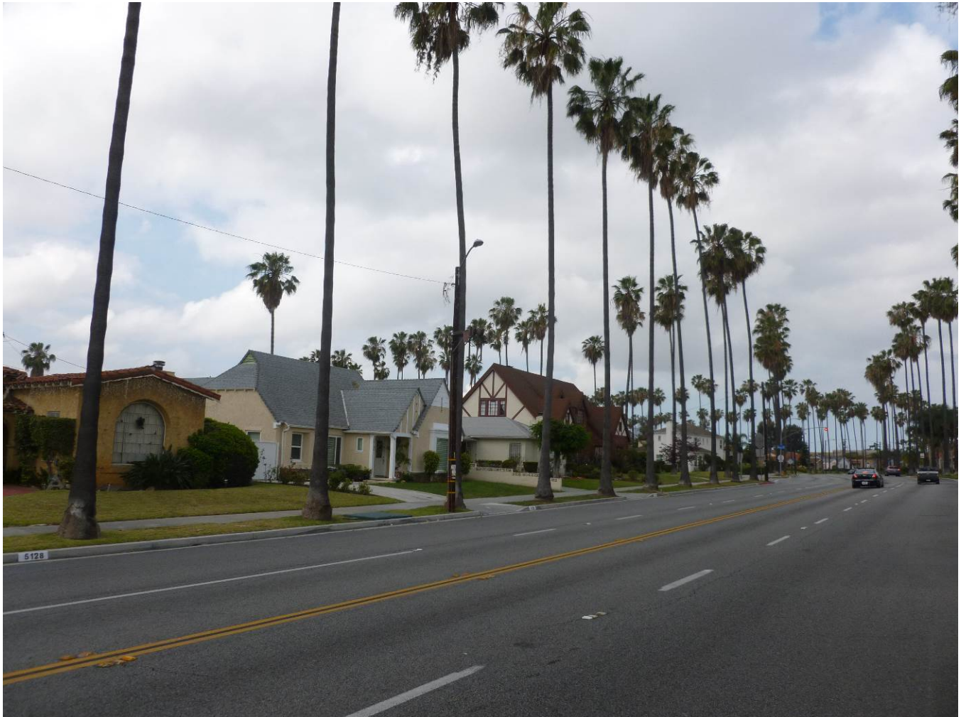
CA_Los Angeles County_View Park Historic District_02.TIF Angeles Vista Boulevard, streetscape, facing southwest