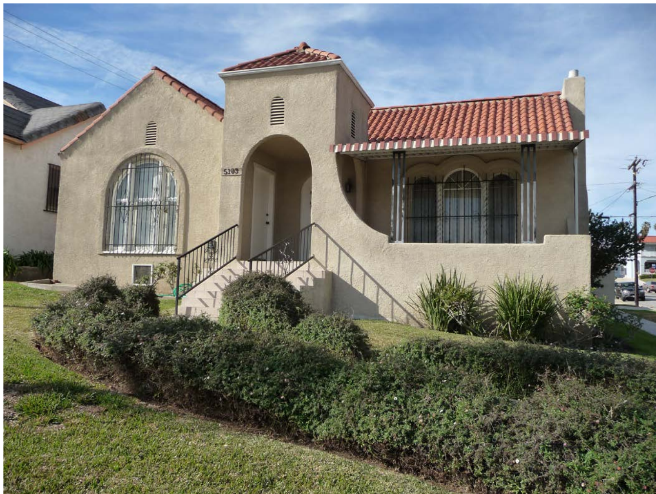
CA_Los Angeles County_View Park Historic District_16.TIF 5103 Chesley Avenue, Spanish Colonial Revival residence, facing west