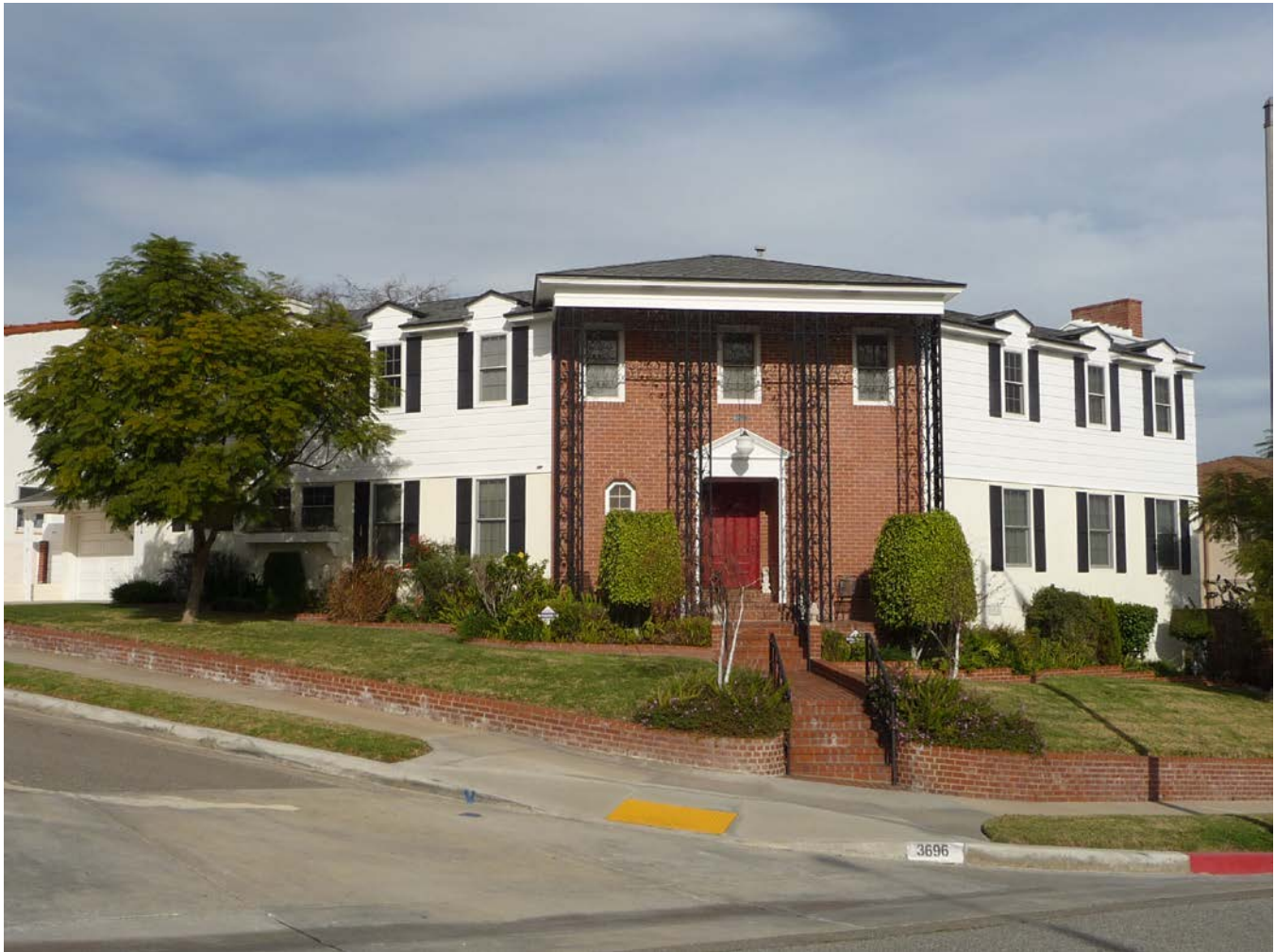
CA_Los Angeles County_View Park Historic District_13.TIF 3696 Aureola Boulevard, American Colonial Revival residence, facing northeast