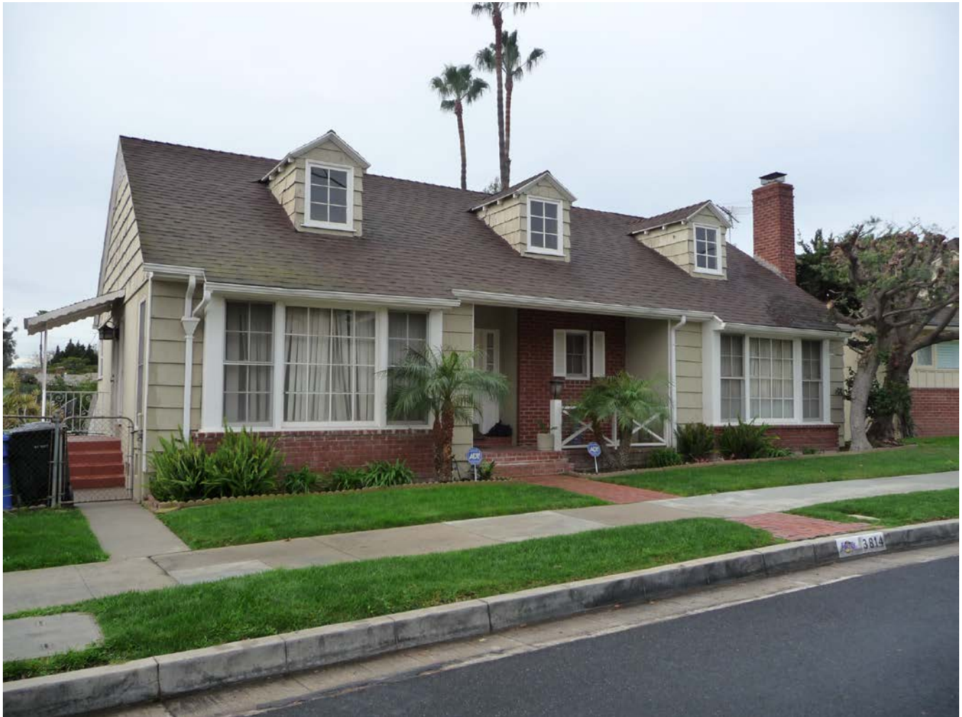
CA_Los Angeles County_View Park Historic District_22.TIF 3814 Crestway Pl, Cape Cod Ranch residence, facing northeast