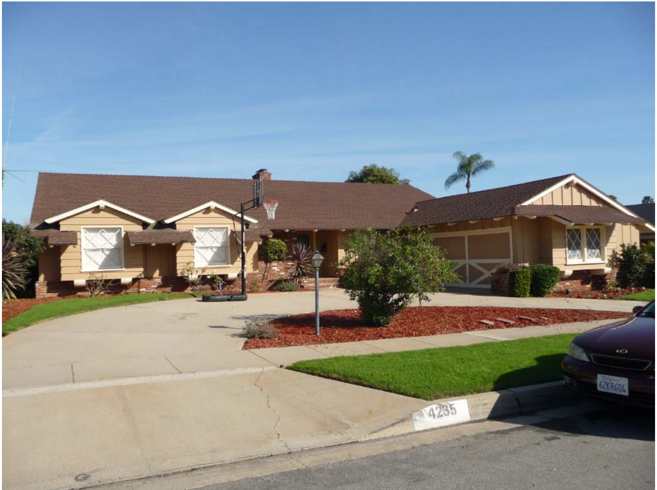
CA_Los Angeles County_View Park Historic District_29.TIF 4235 Monteith Drive, Traditional Ranch residence, facing north