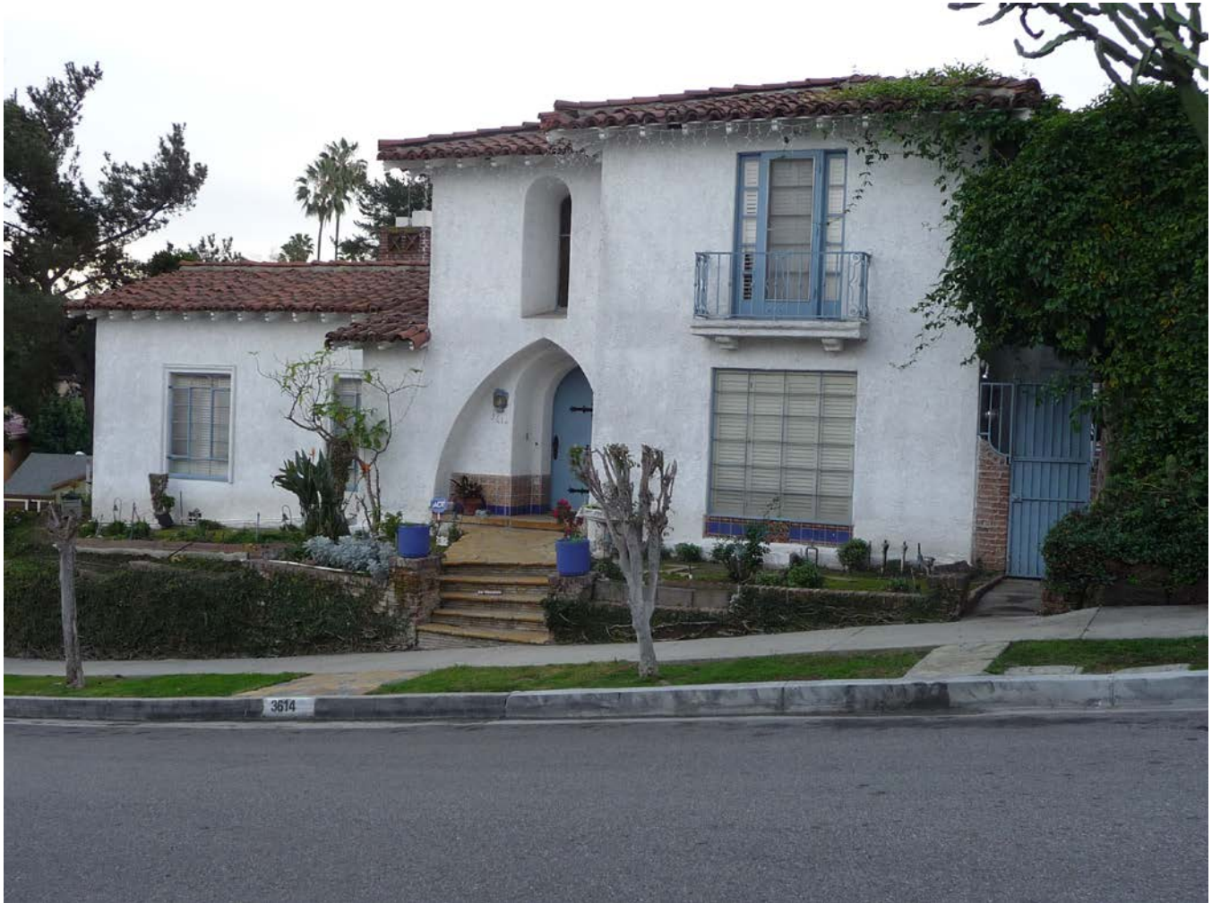
CA_Los Angeles County_View Park Historic District_17.TIF 3614 Homeway Drive, Spanish Colonial Revival residence, facing southwest