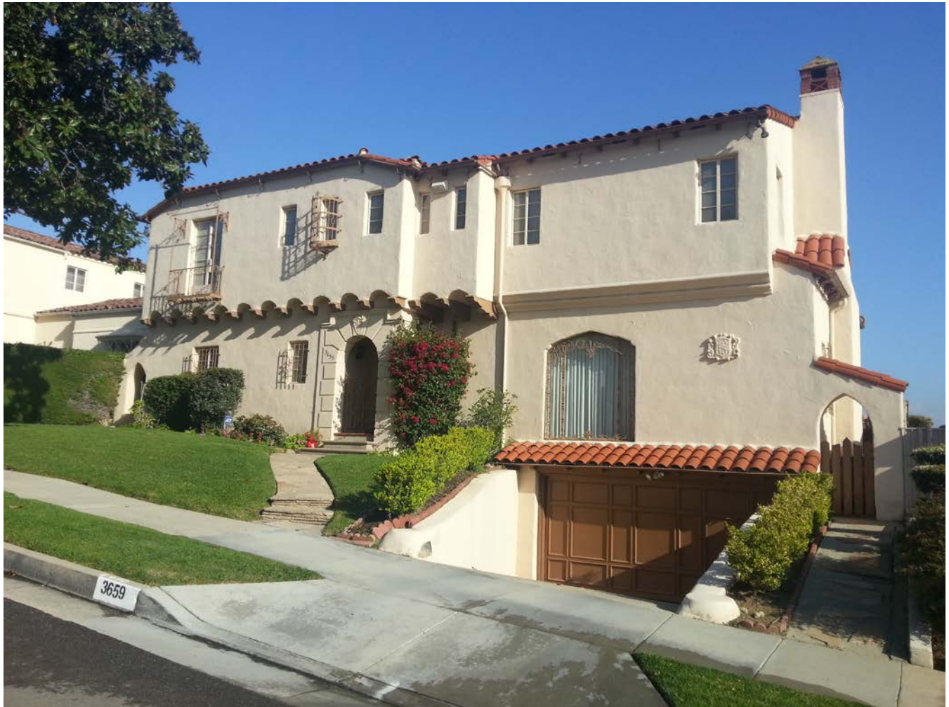
CA_Los Angeles County_View Park Historic District_11.TIF 3659 Aureola Boulevard, Spanish Colonial Revival residence, facing north