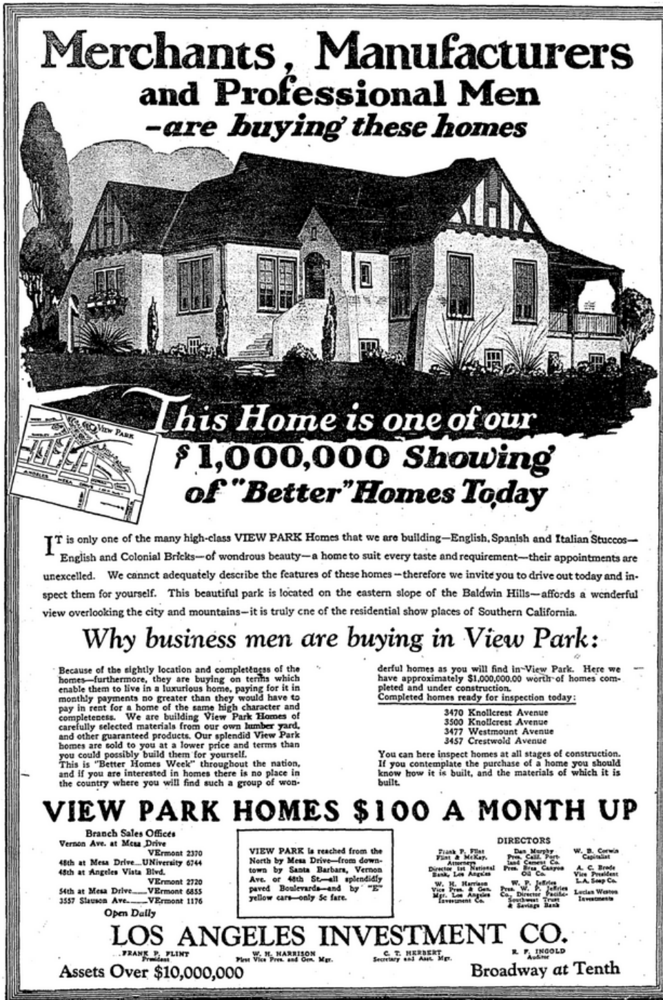
Figure 1: Display Ad, Los Angeles Times, October 25, 1925.

Section number Additional Documentation Page 4