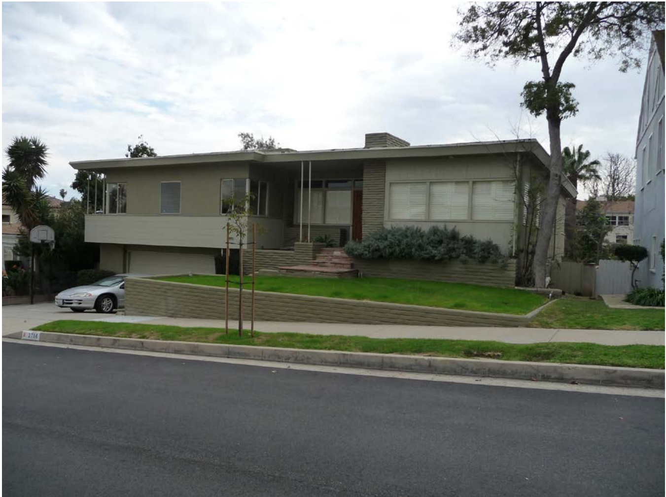
CA_Los Angeles County_View Park Historic District_27.TIF 3766 Monteith Drive, Contemporary Ranch residence, facing southwest