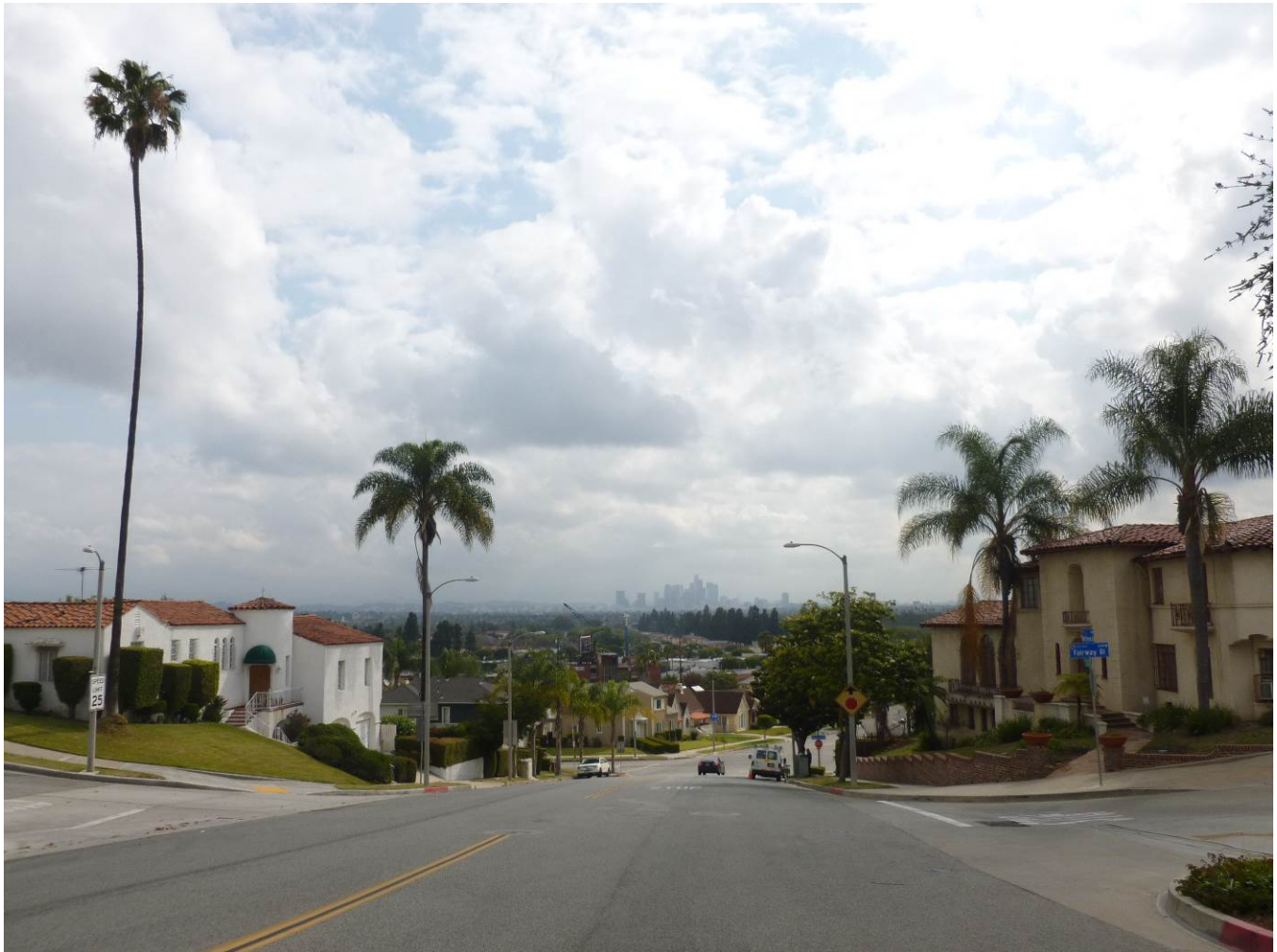
CA_Los Angeles County_View Park Historic District_01.TIF Mount Vernon Boulevard, streetscape and view of Downtown Los Angeles, facing east