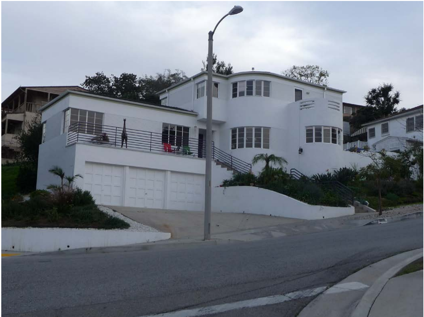
CA_Los Angeles County_View Park Historic District_38.TIF 3602 Homeland Drive, Streamline Moderne residence, facing southeast