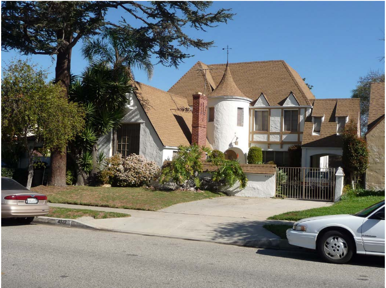
CA_Los Angeles County_View Park Historic District_10.TIF 4322 Angeles Vista Boulevard, Tudor Revival residence, facing northeast