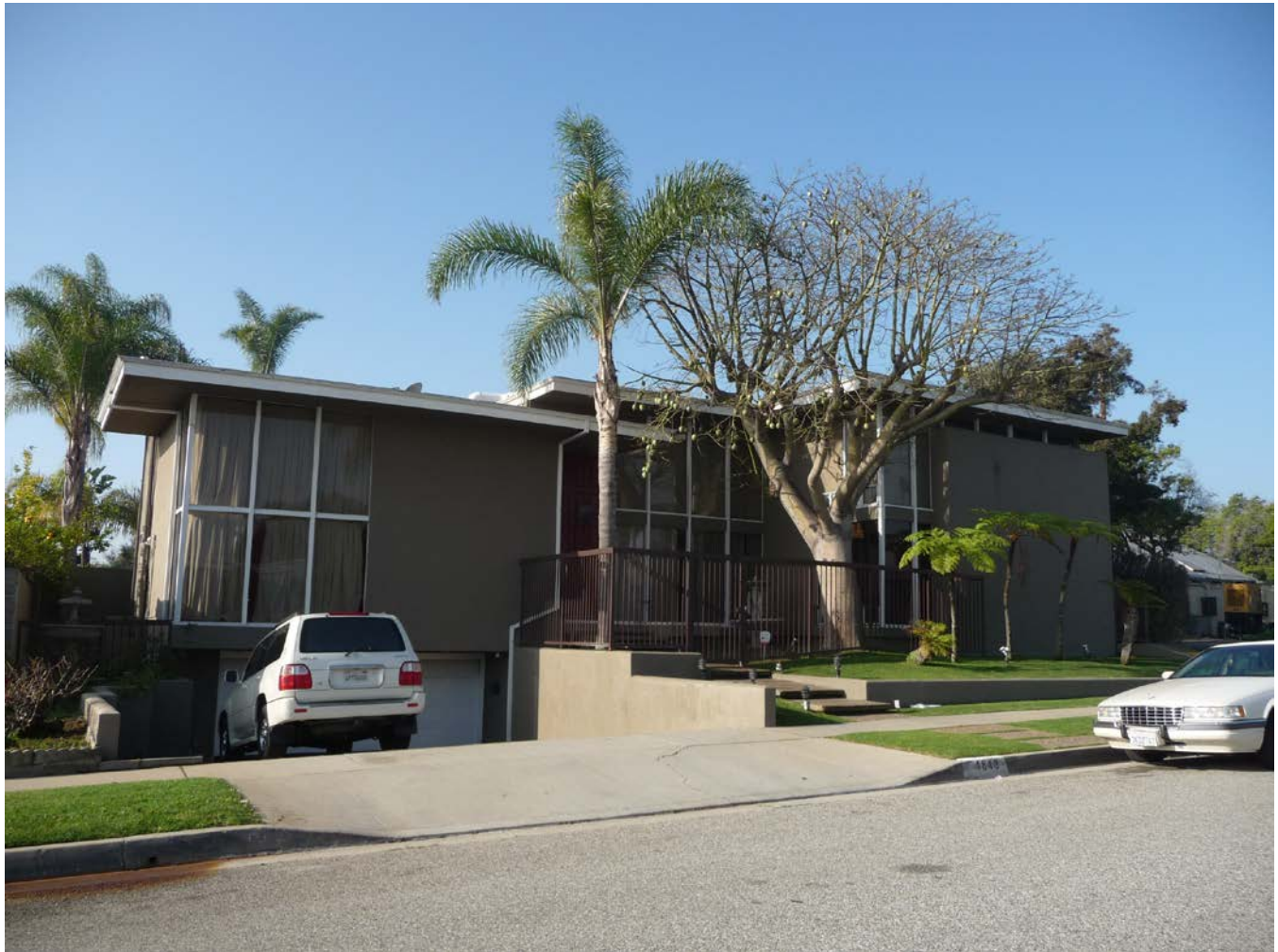
CA_Los Angeles County_View Park Historic District_39.TIF 4843 Inadale Avenue, Mid-Century Modern residence, facing southwest