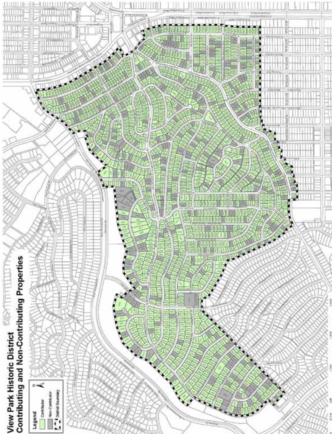
Map 2. View Park Historic District Sketch Map

Section number Additional Documentation Page 2