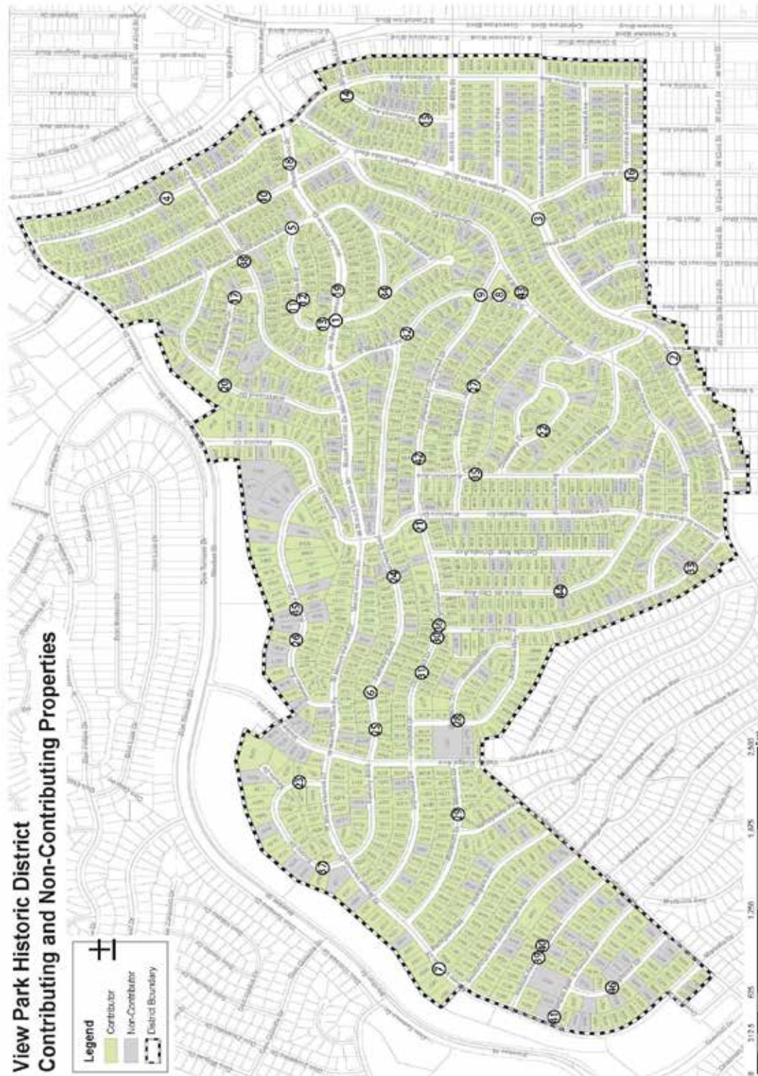
Map 3. View Park Historic District Photograph Key

Section number Additional Documentation Page 3