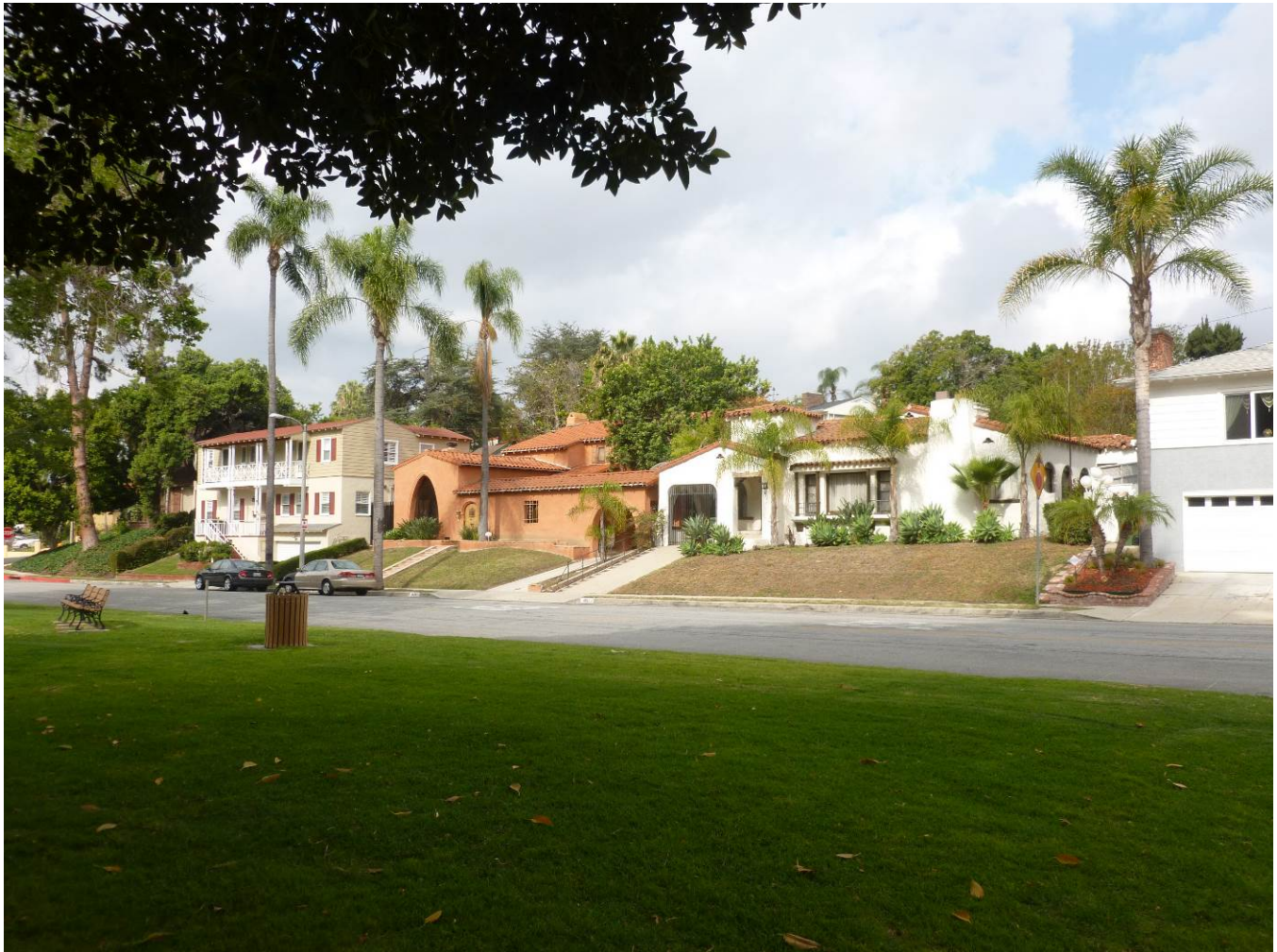
CA_Los Angeles County_View Park Historic District_08.TIF Mullen Avenue, view from Monteith Park, facing west