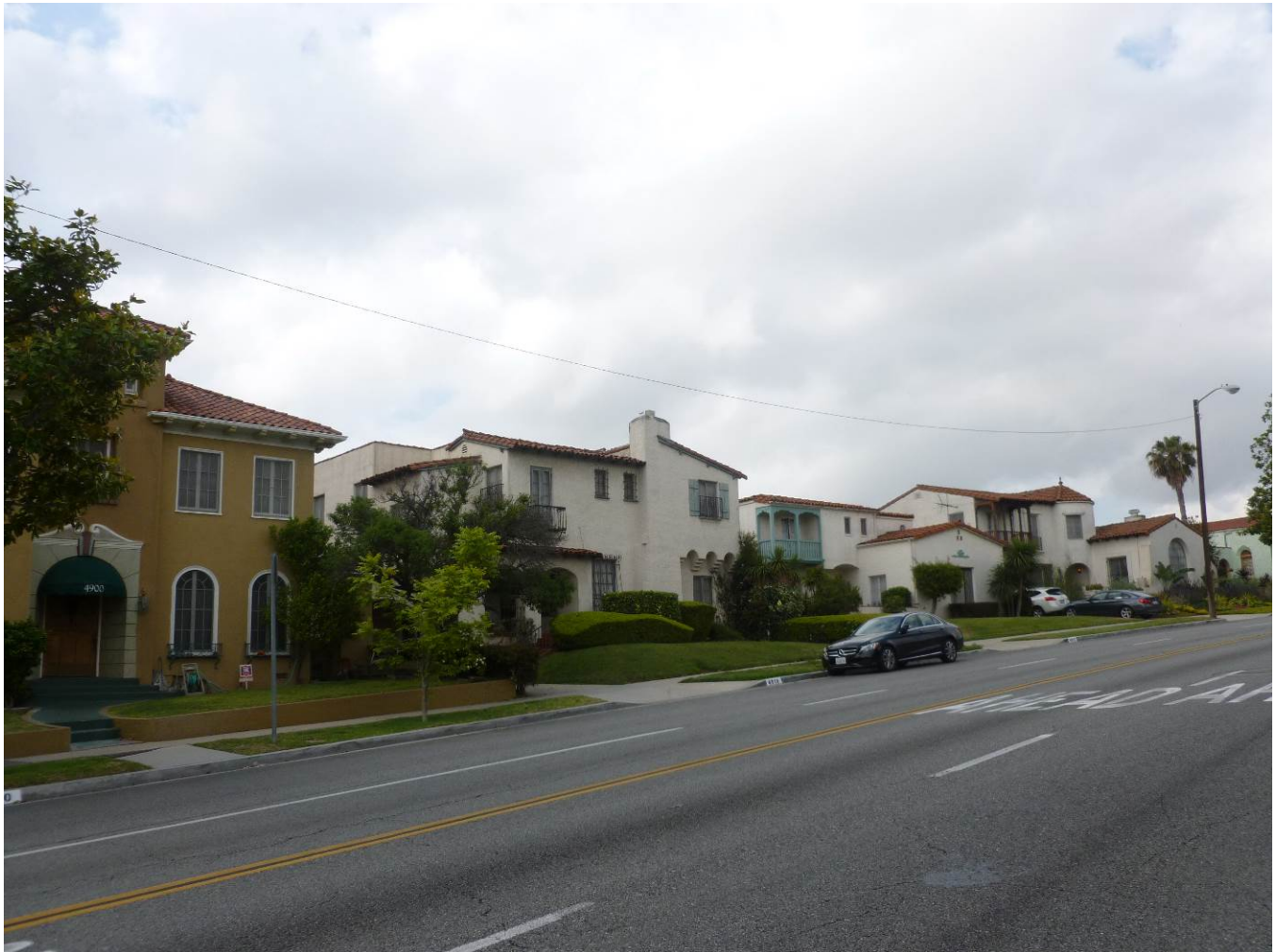
CA_Los Angeles County_View Park Historic District_03.TIF Angeles Vista Boulevard, streetscape, facing west