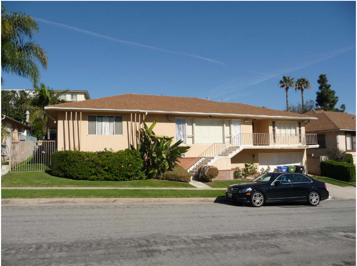
CA_Los Angeles County_View Park Historic District_25.TIF 4149 Fairway Boulevard, Contemporary Ranch residence, facing north