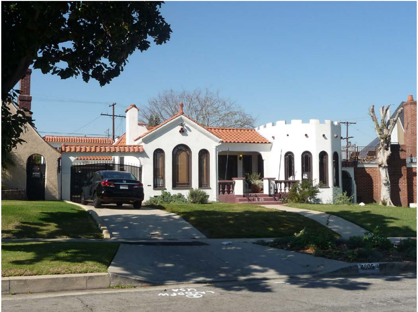
CA_Los Angeles County_View Park Historic District_14.TIF 4605 Brynhurst Avenue, Spanish Colonial Revival residence, facing northwest