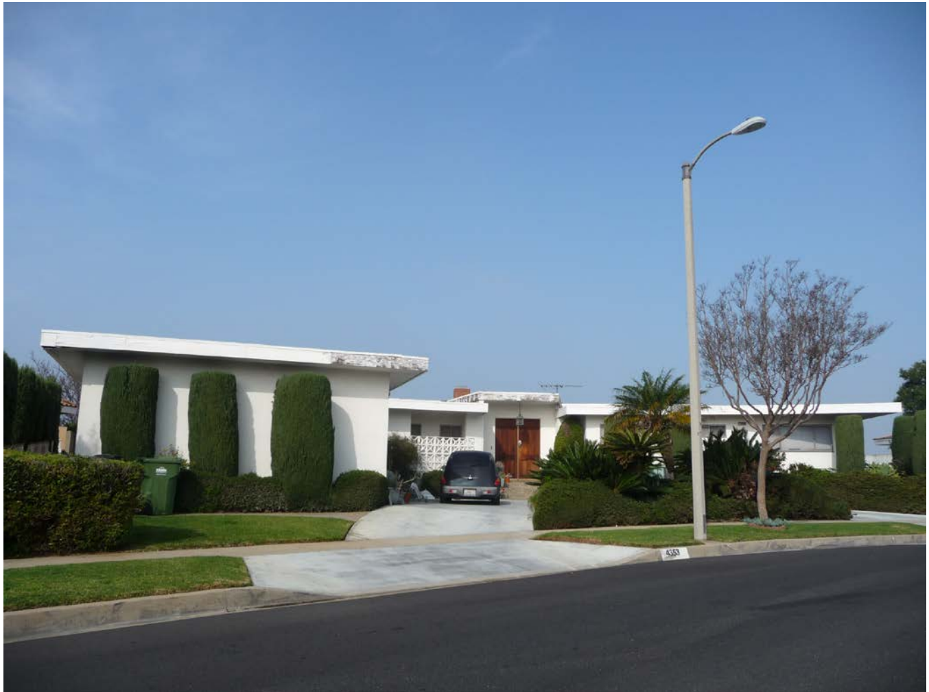
CA_Los Angeles County_View Park Historic District_37.TIF 4353 Enoro Drive, Mid-Century Modern residence, facing west