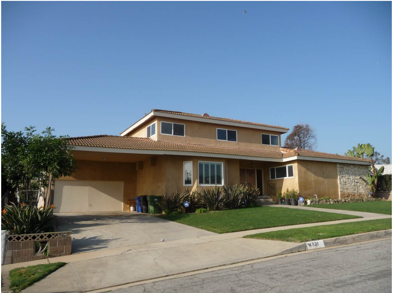
CA_Los Angeles County_View Park Historic District_46.TIF 4931 Maymount Drive, Non-Contributing residence, facing southwest