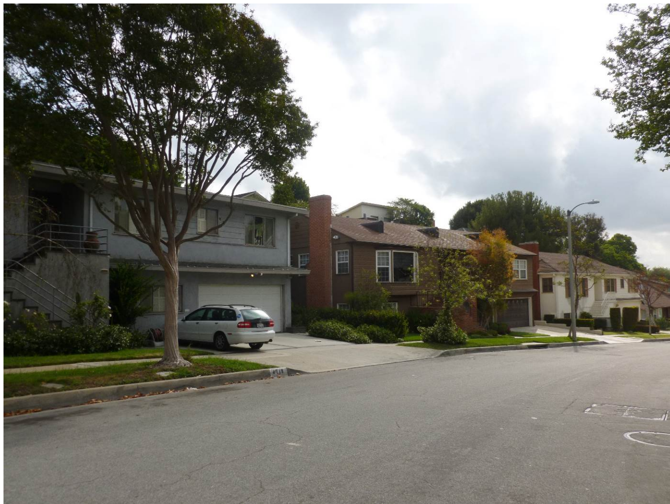
CA_Los Angeles County_View Park Historic District_06.TIF Fairway Boulevard, streetscape, facing east