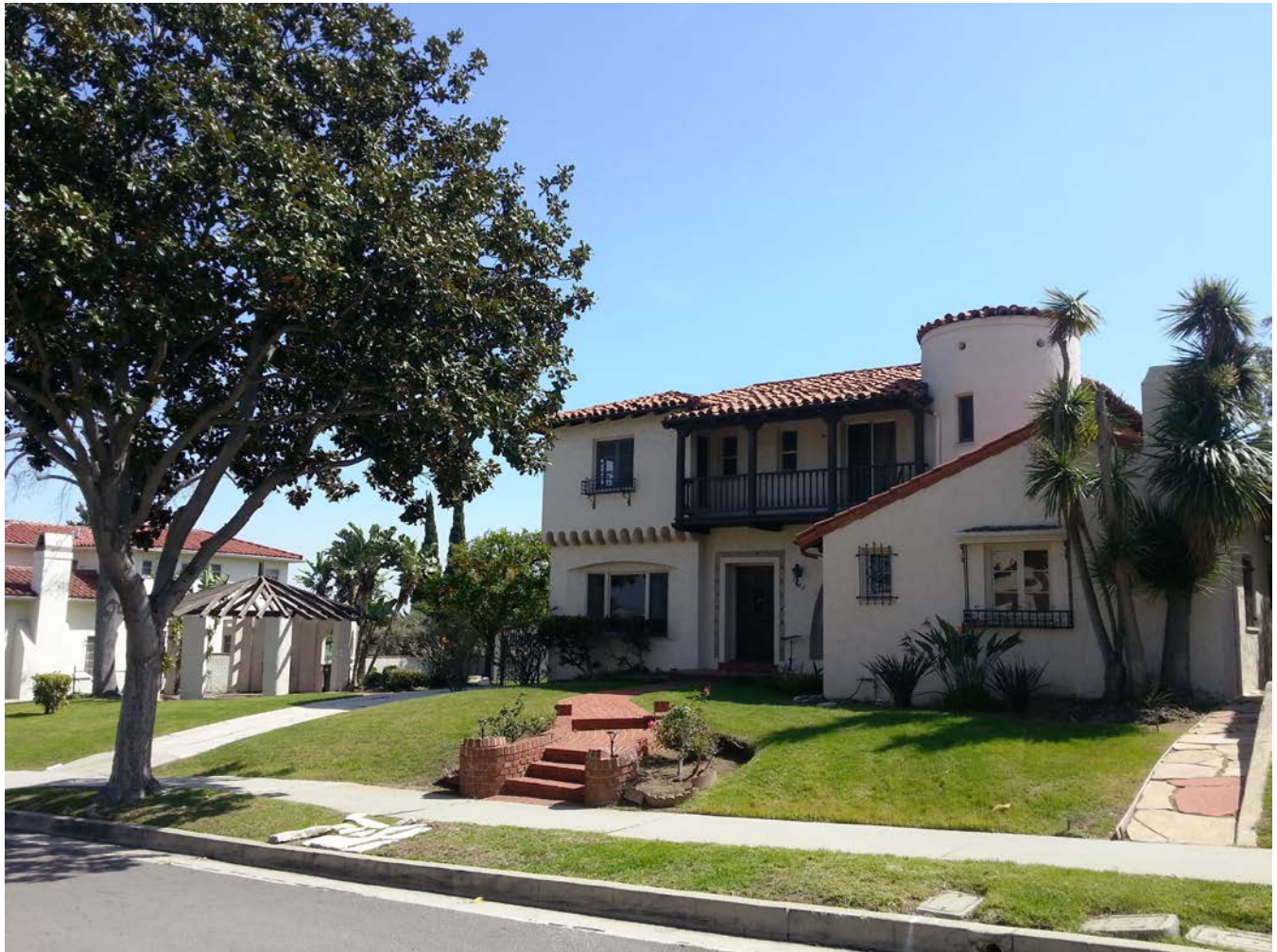
CA_Los Angeles County_View Park Historic District_12.TIF 3660 Aureola Boulevard, Spanish Colonial Revival residence, facing south