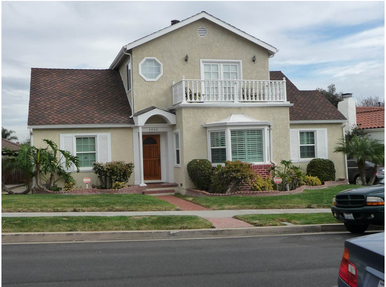
CA_Los Angeles County_View Park Historic District_44.TIF 4900 Vista de Oro Avenue, Non-Contributing residence, facing east