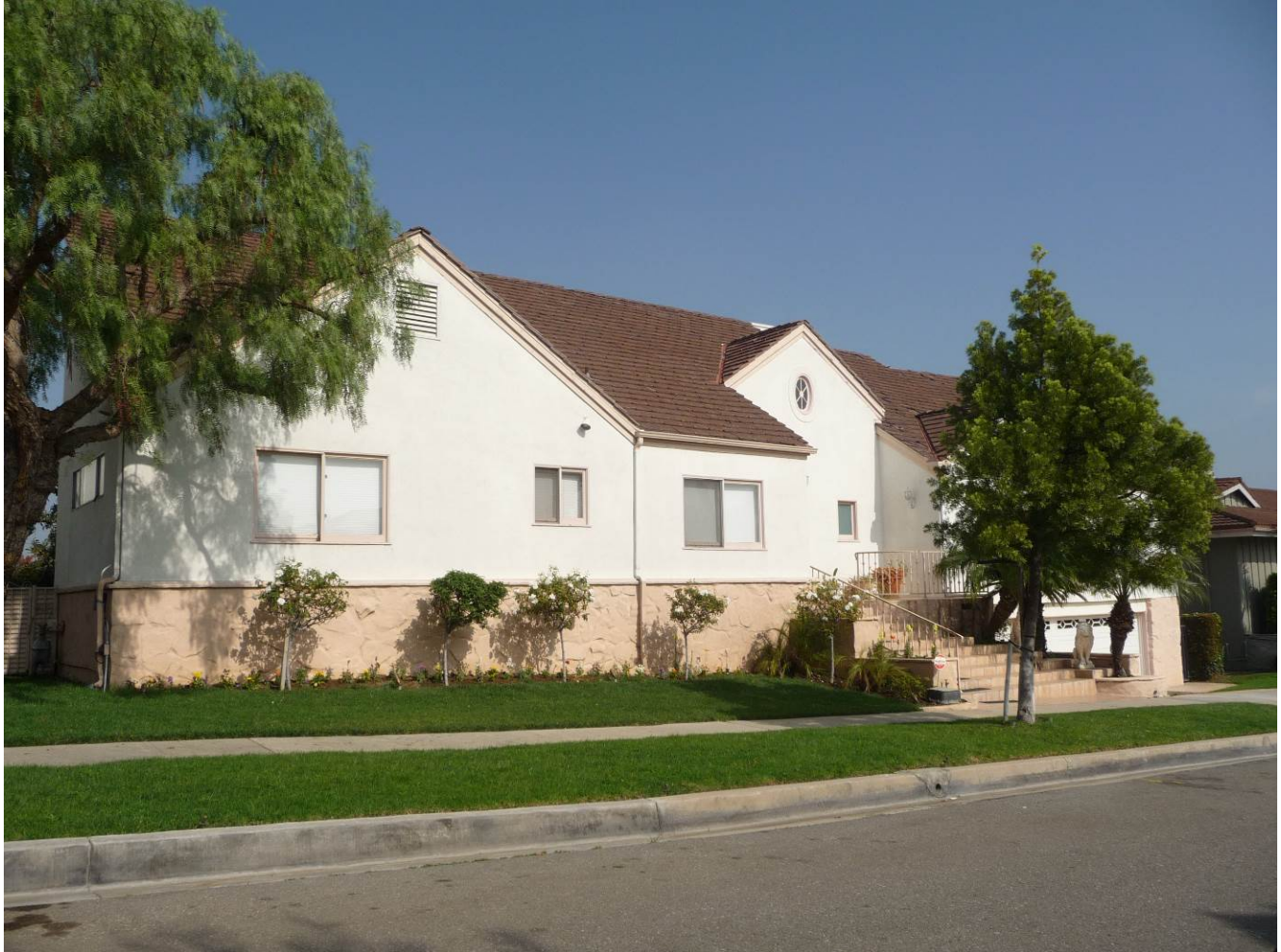
CA_Los Angeles County_View Park Historic District_45.TIF 4029 Kenway Avenue, Non-Contributing residence, facing north