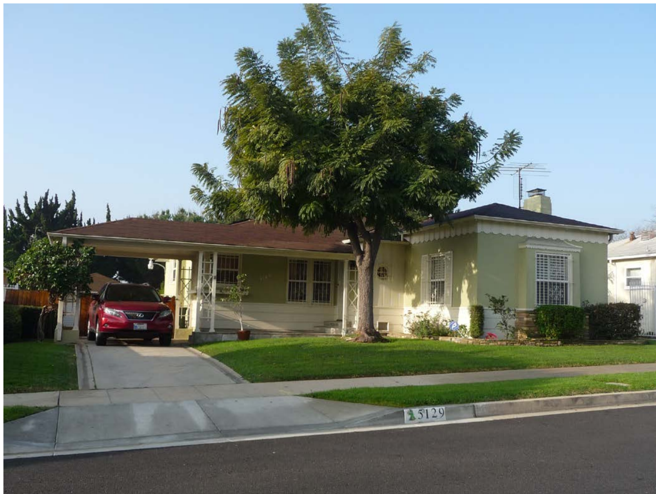
CA_Los Angeles County_View Park Historic District_33.TIF 5129 Escalon Avenue, Minimal Traditional residence, facing southwest