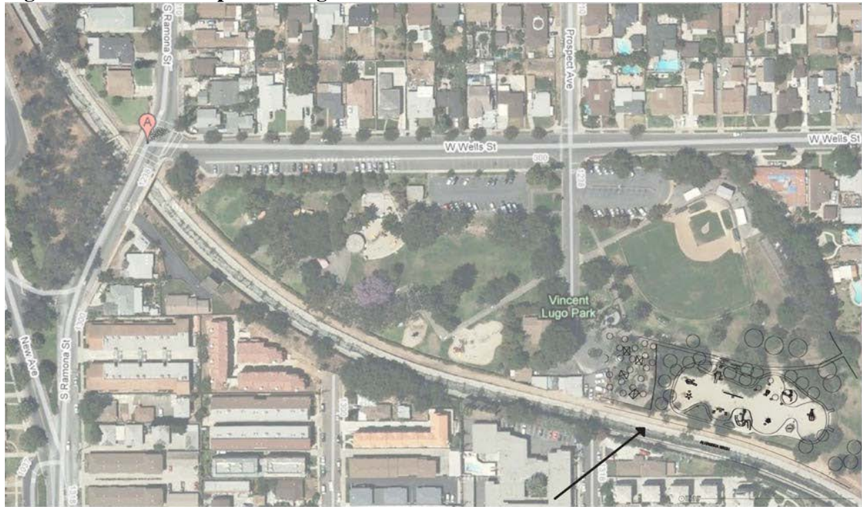
Figure 2: Location Map of La Laguna de San Gabriel

Los Angeles, California County and State