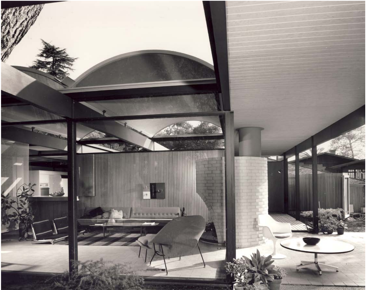
Figure 1. Julius Shulman Photograph, 1960