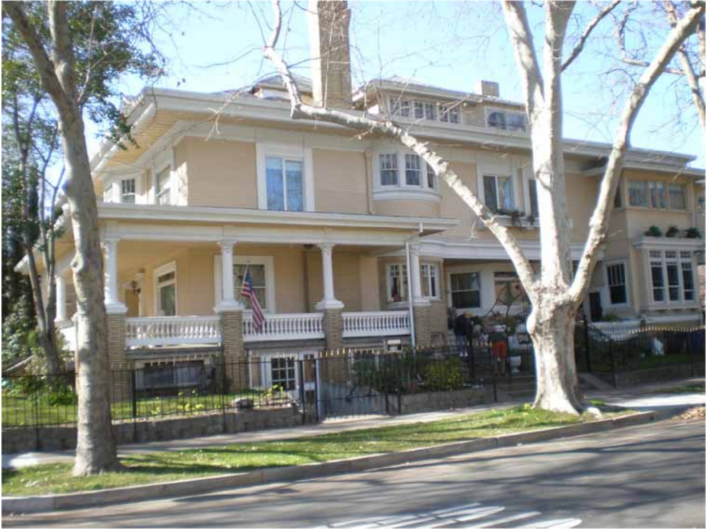
California_Sacramento_Boulevard Park_0016 Edward F. Dalton House, Colonial Revival/Prairie residence, 2131 F Street, facing west