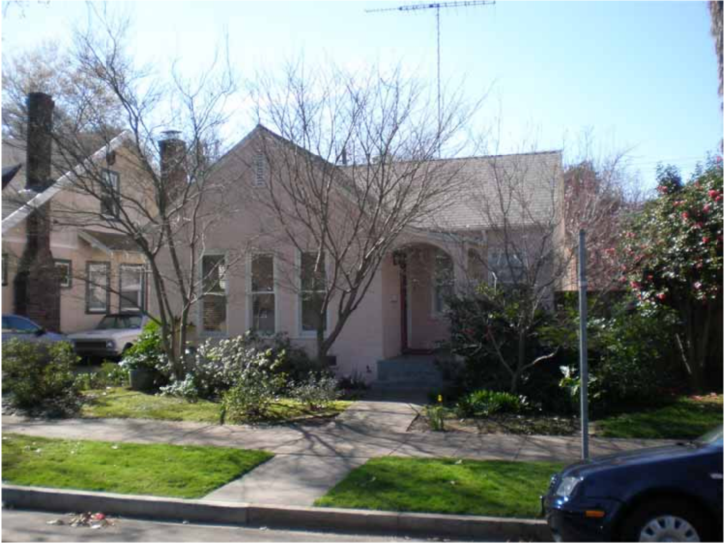
California_Sacramento_Boulevard Park_0029 Tudor cottage, 320 22 nd Street, facing west