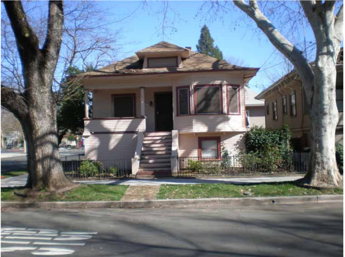
California_Sacramento_Boulevard Park_0015 Neoclassic row house, 601 22 nd Street, facing east