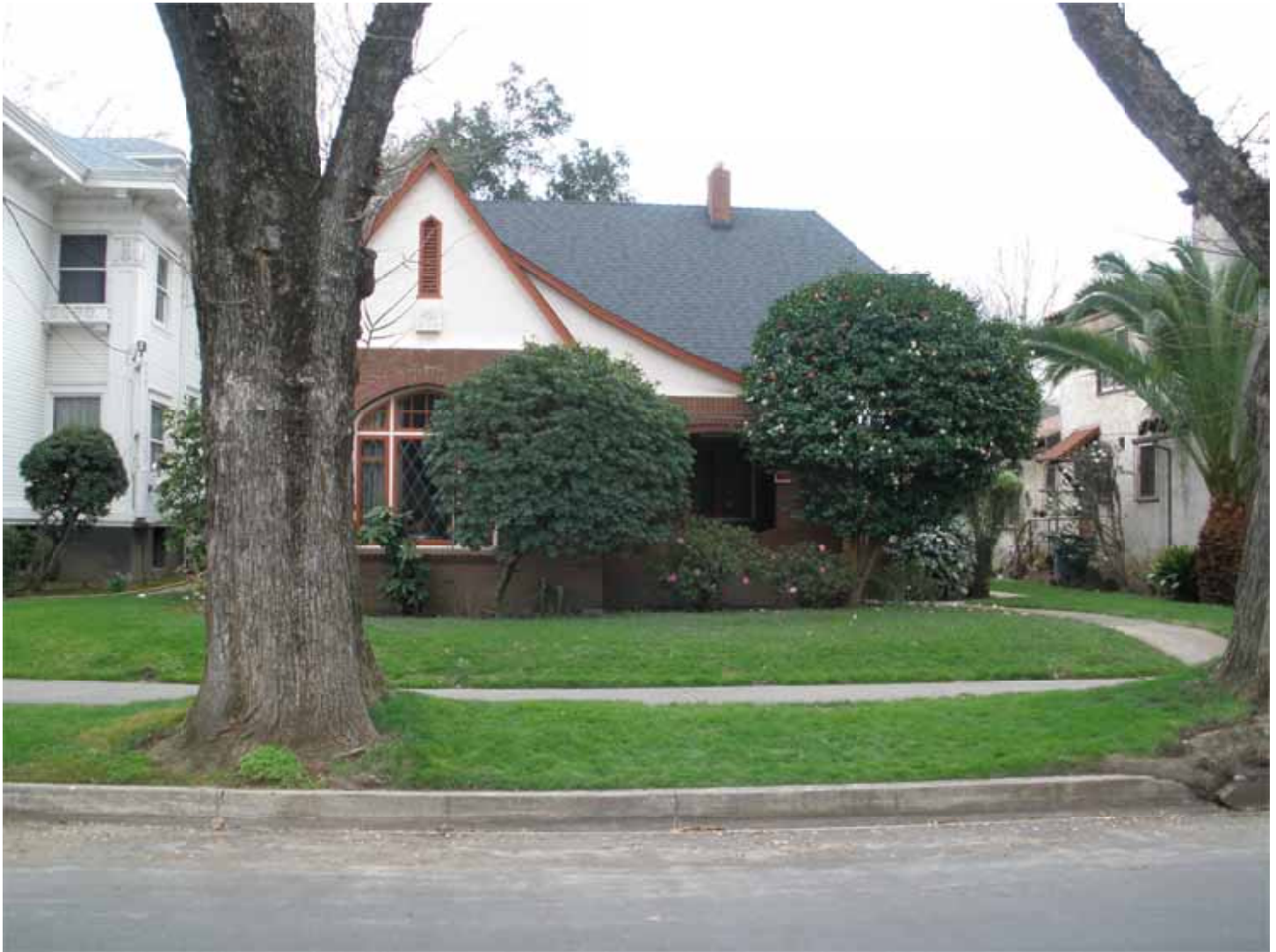
California_Sacramento_Boulevard Park_0028 Harold C. Kinney House, Tudor cottage, 607 21 st Street, facing east