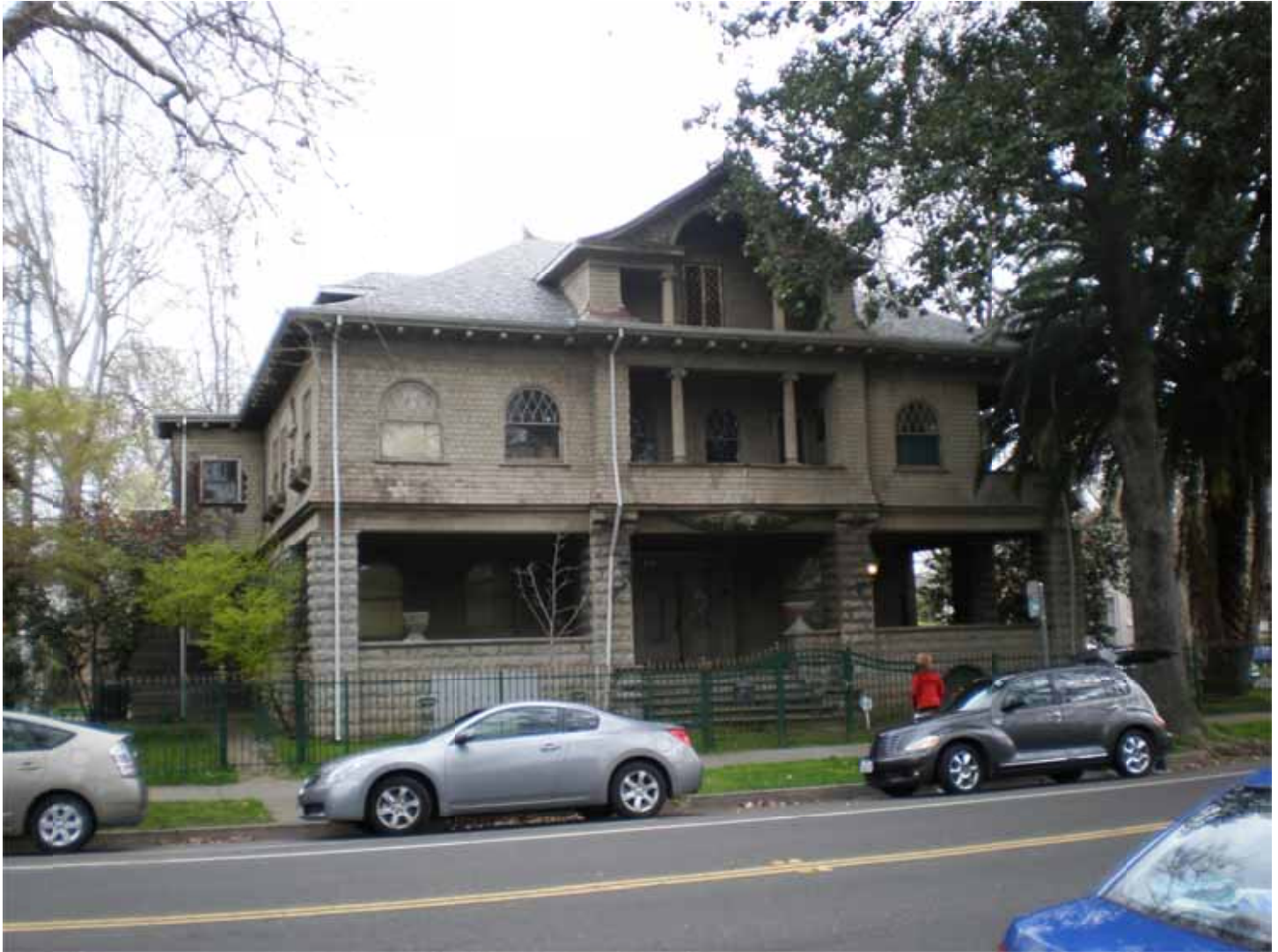
California_Sacramento_Boulevard Park_0012 Aden C. Hart House, Art Nouveau residence, 2131 H Street, facing north