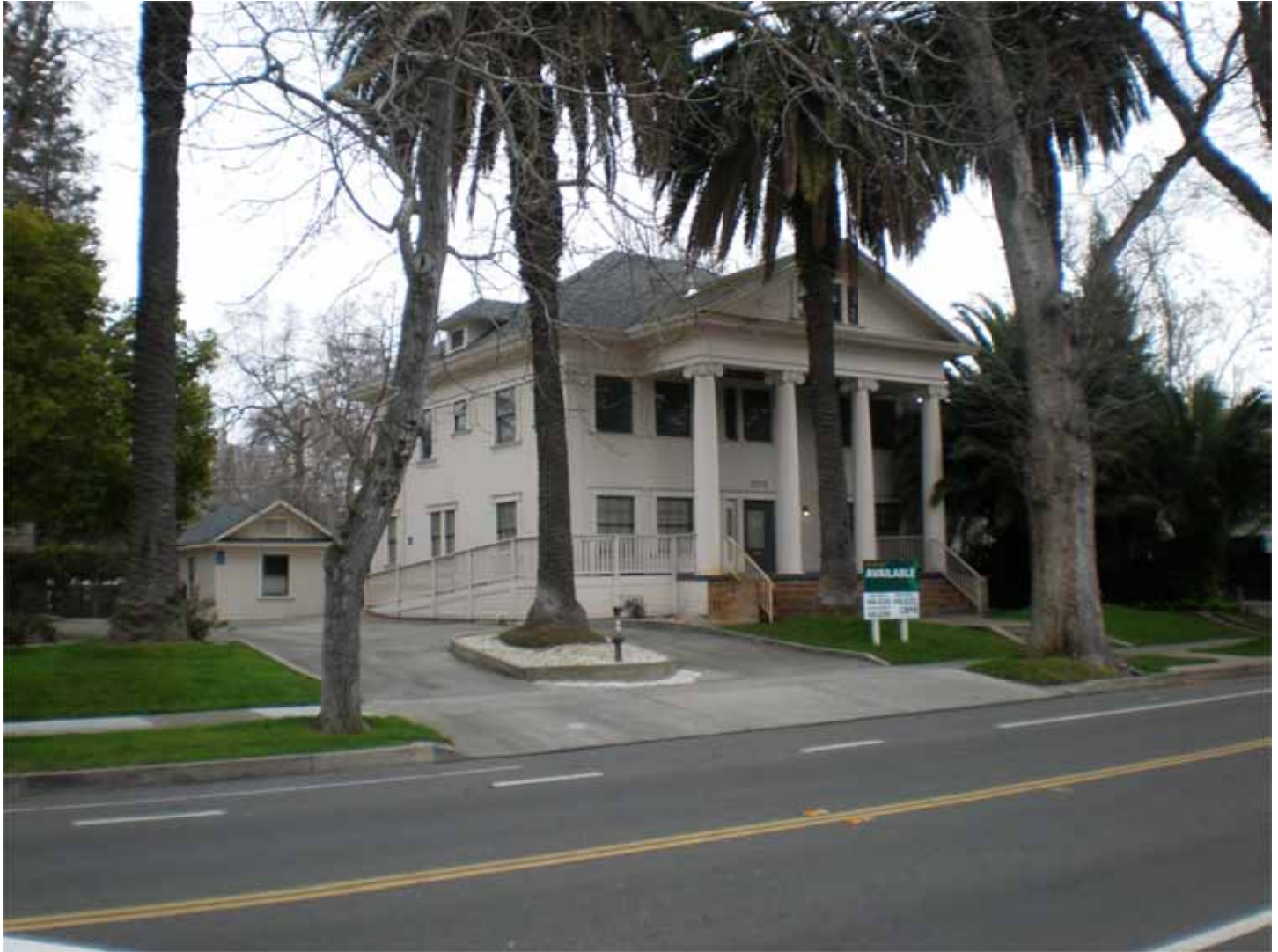
California_Sacramento_Boulevard Park_0023 George Smith House, Classical Revival residence and outbuilding, 2015-2013 H Street, facing northeast