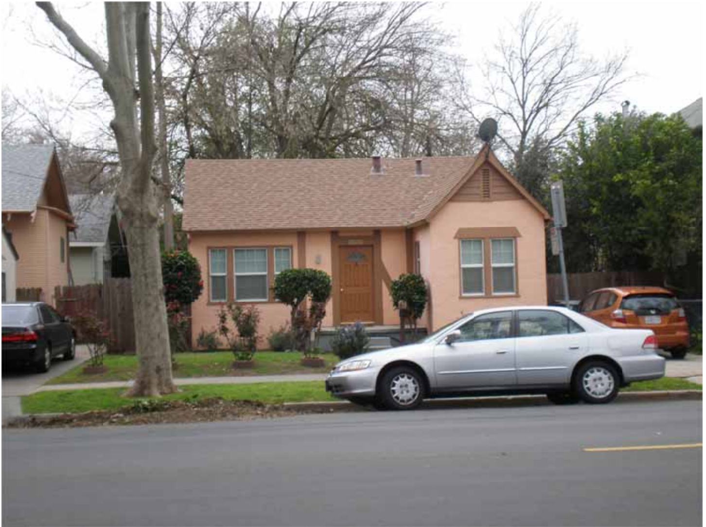
California_Sacramento_Boulevard Park_0027 Minimal Traditional/Tudor cottage, 2026 C Street, facing south