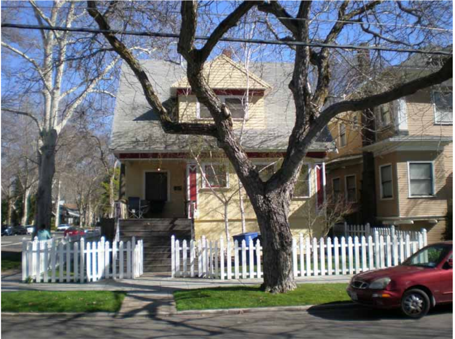
California_Sacramento_Boulevard Park_0017 Eugene Hepting House, Colonial Revival residence, 501 22 nd Street, facing east