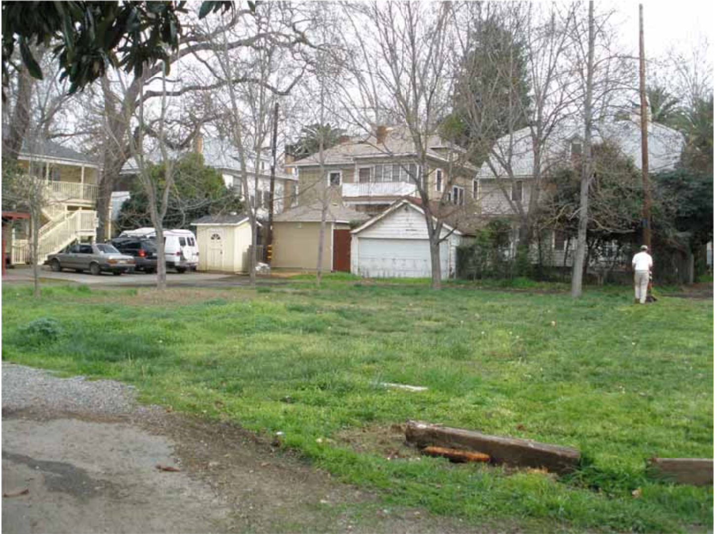
California_Sacramento_Boulevard Park_0036 Park Center Club alley park, 20 th /21 st /G/H Street, facing northwest