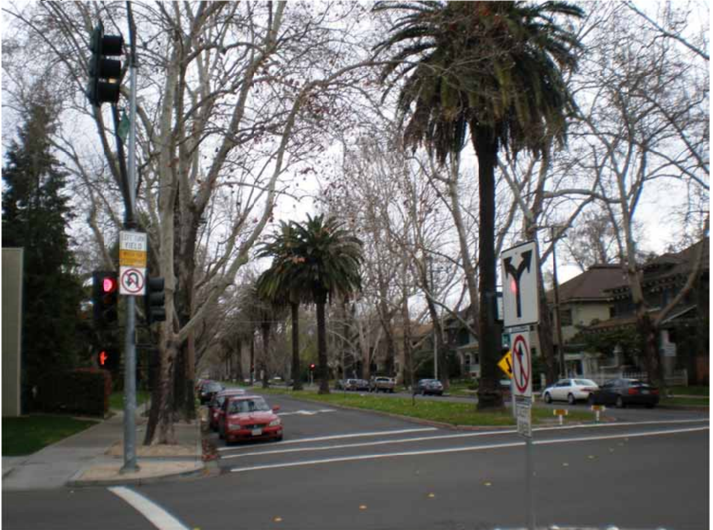
California_Sacramento_Boulevard Park_0001 Boulevard Park street median, 21 st Street from H Street facing north