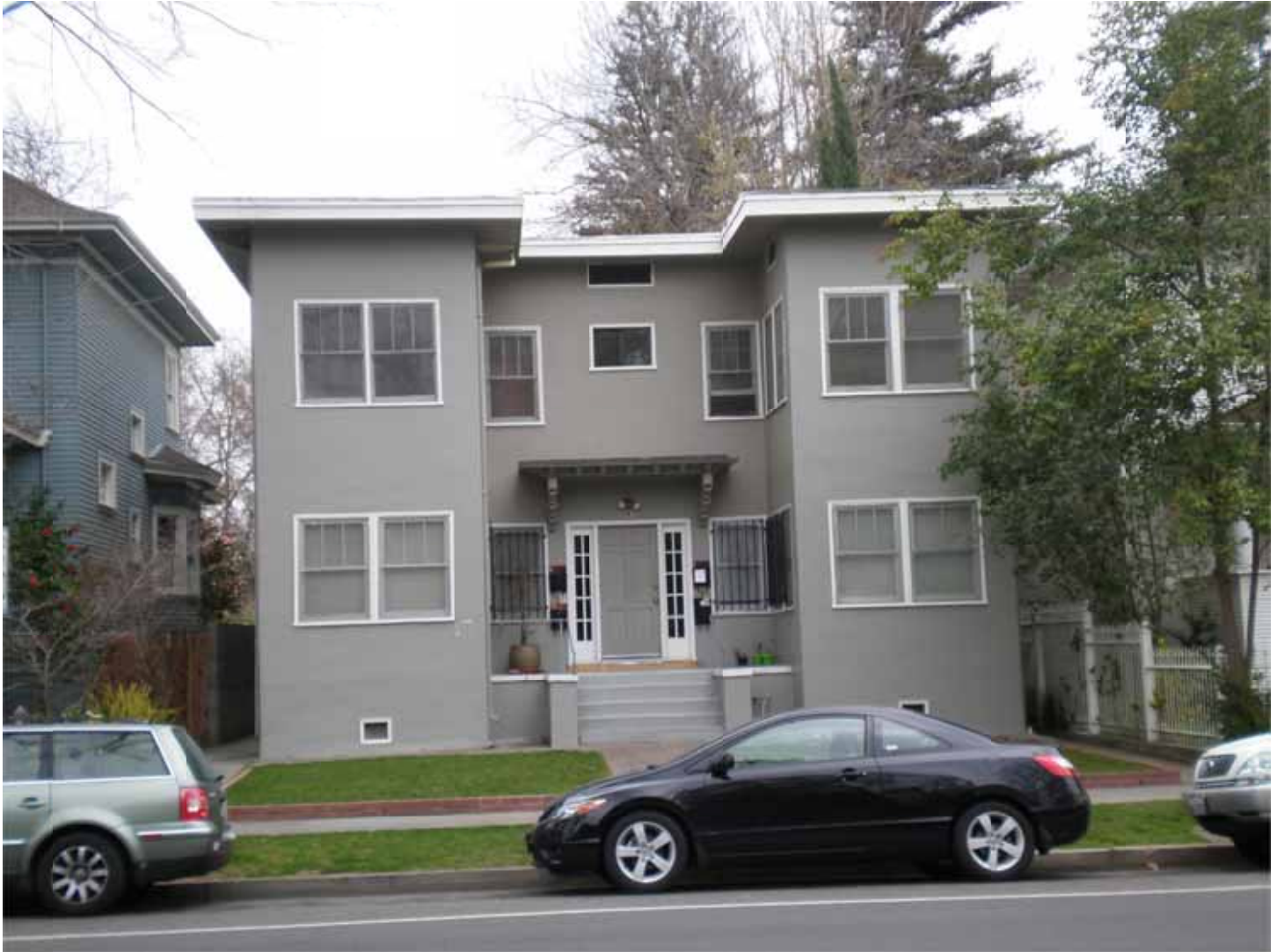
California_Sacramento_Boulevard Park_0022 Prairie style apartment building, 2015 G Street, facing north