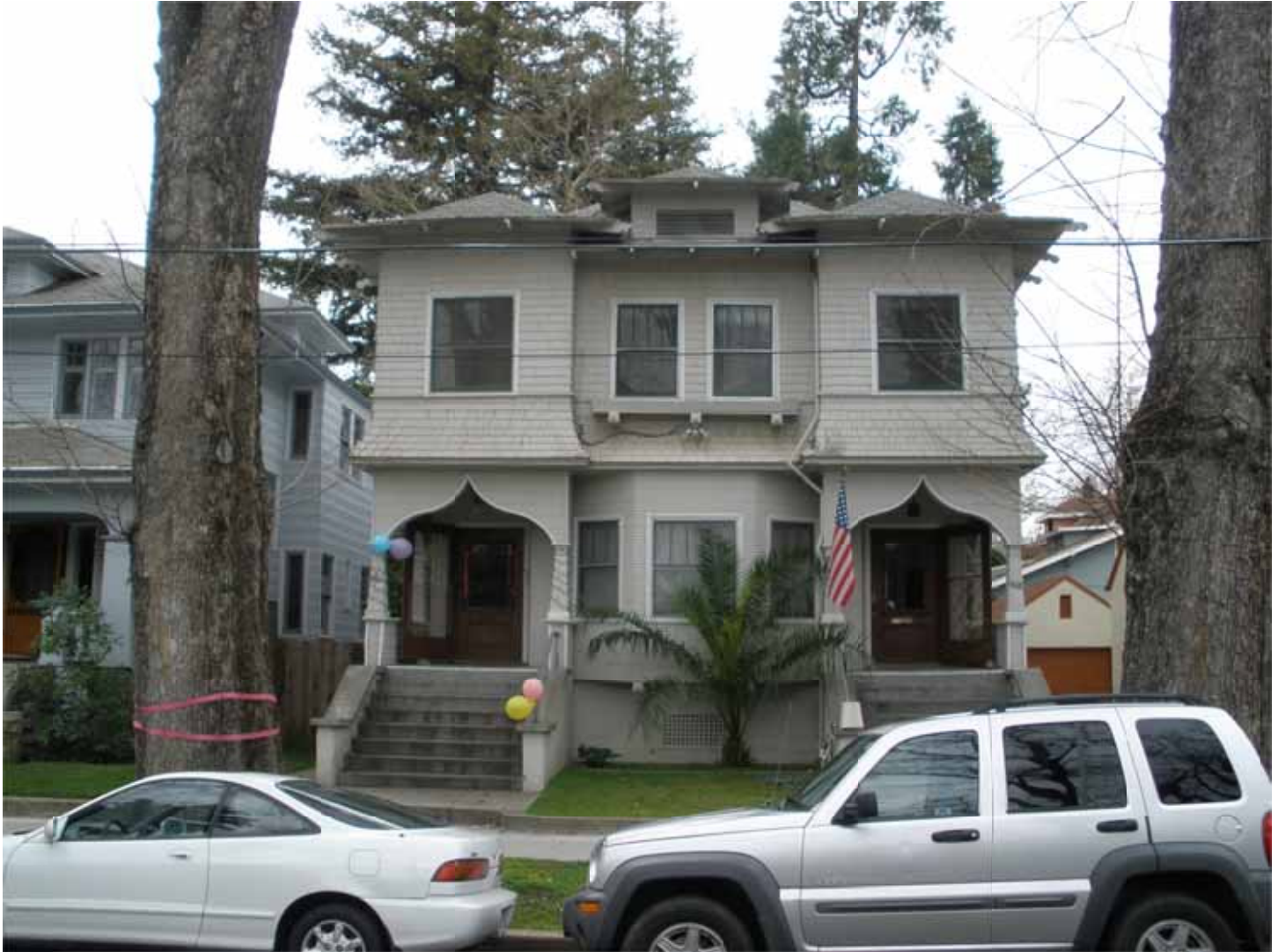
California_Sacramento_Boulevard Park_0008 Clarence Smith House, Asian influenced Craftsman duplex, 608-610 21 st Street, facing west