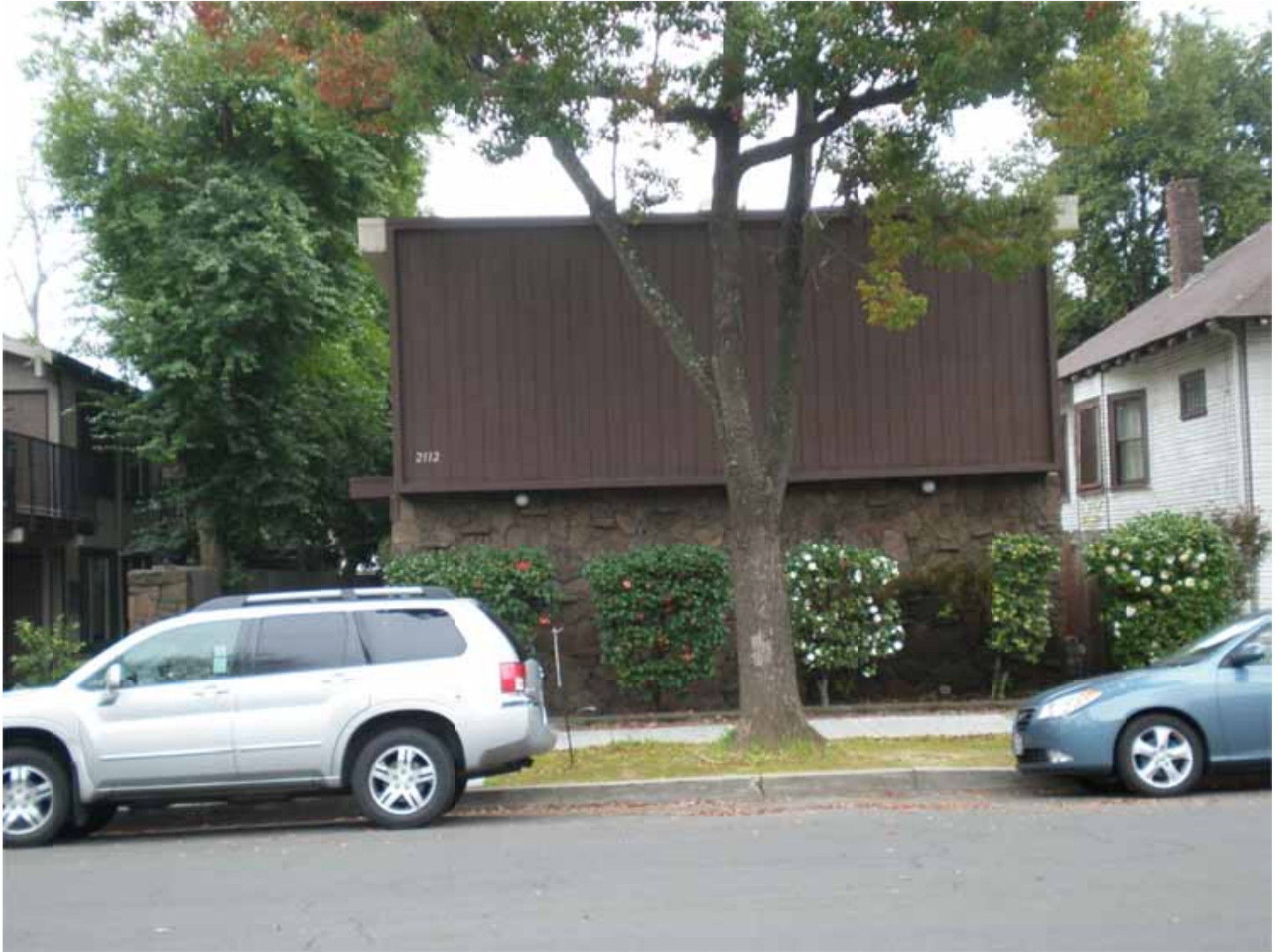
California_Sacramento_Boulevard Park_0031 Non-contributing apartment building, 2112 D Street, facing south