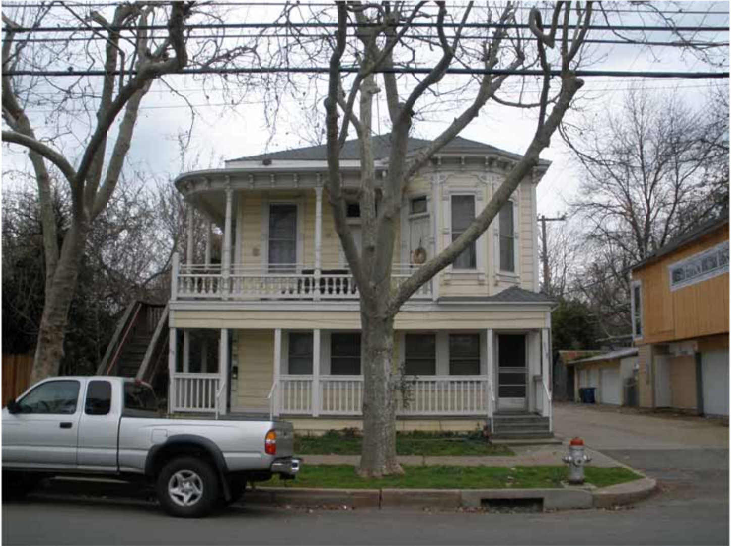
California_Sacramento_Boulevard Park_0020 Italianate apartment conversion, 313 20 th Street, facing east