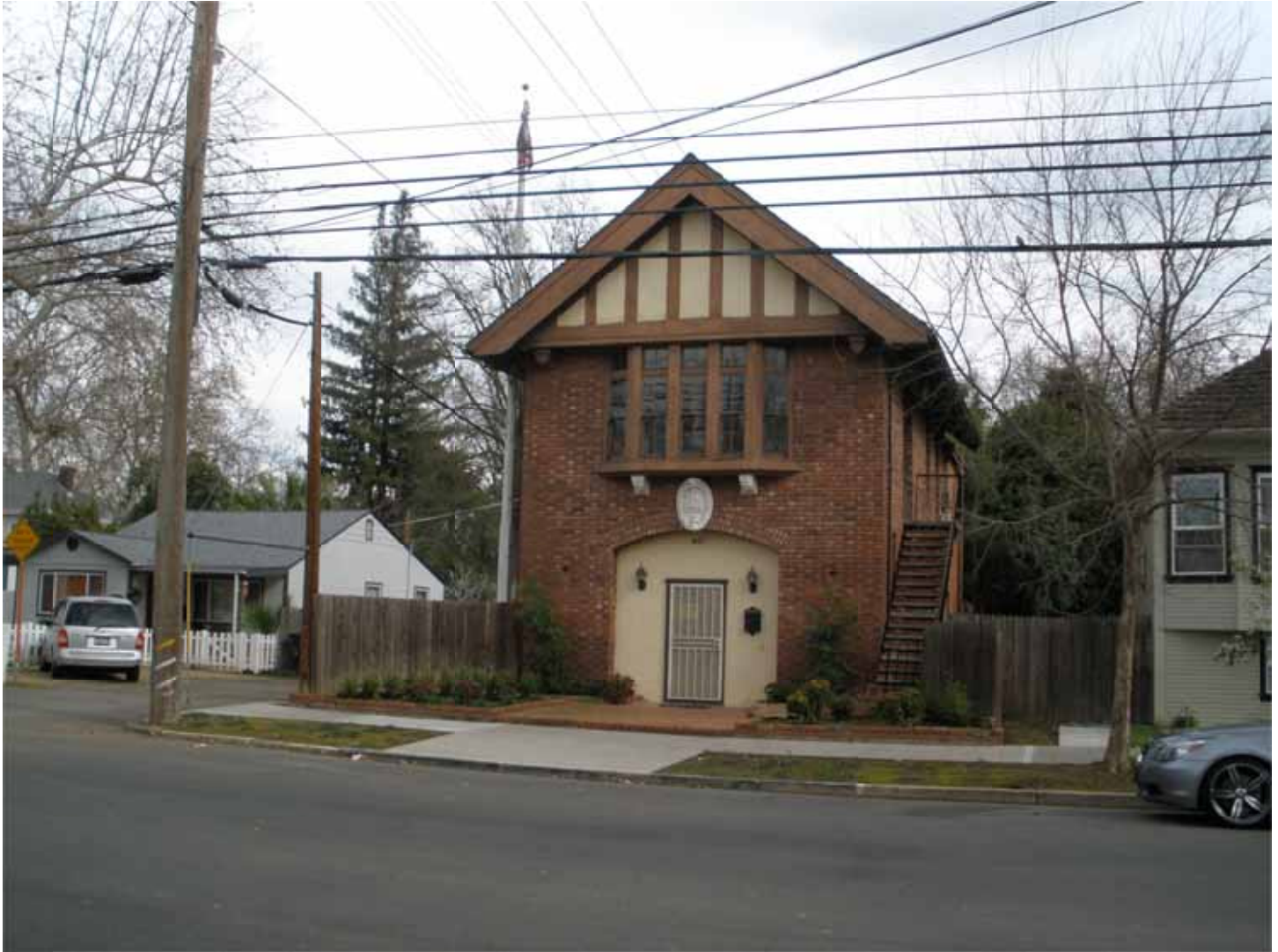
California_Sacramento_Boulevard Park_0005 Sacramento Fire Department Station #4, 417 20 th Street, facing east