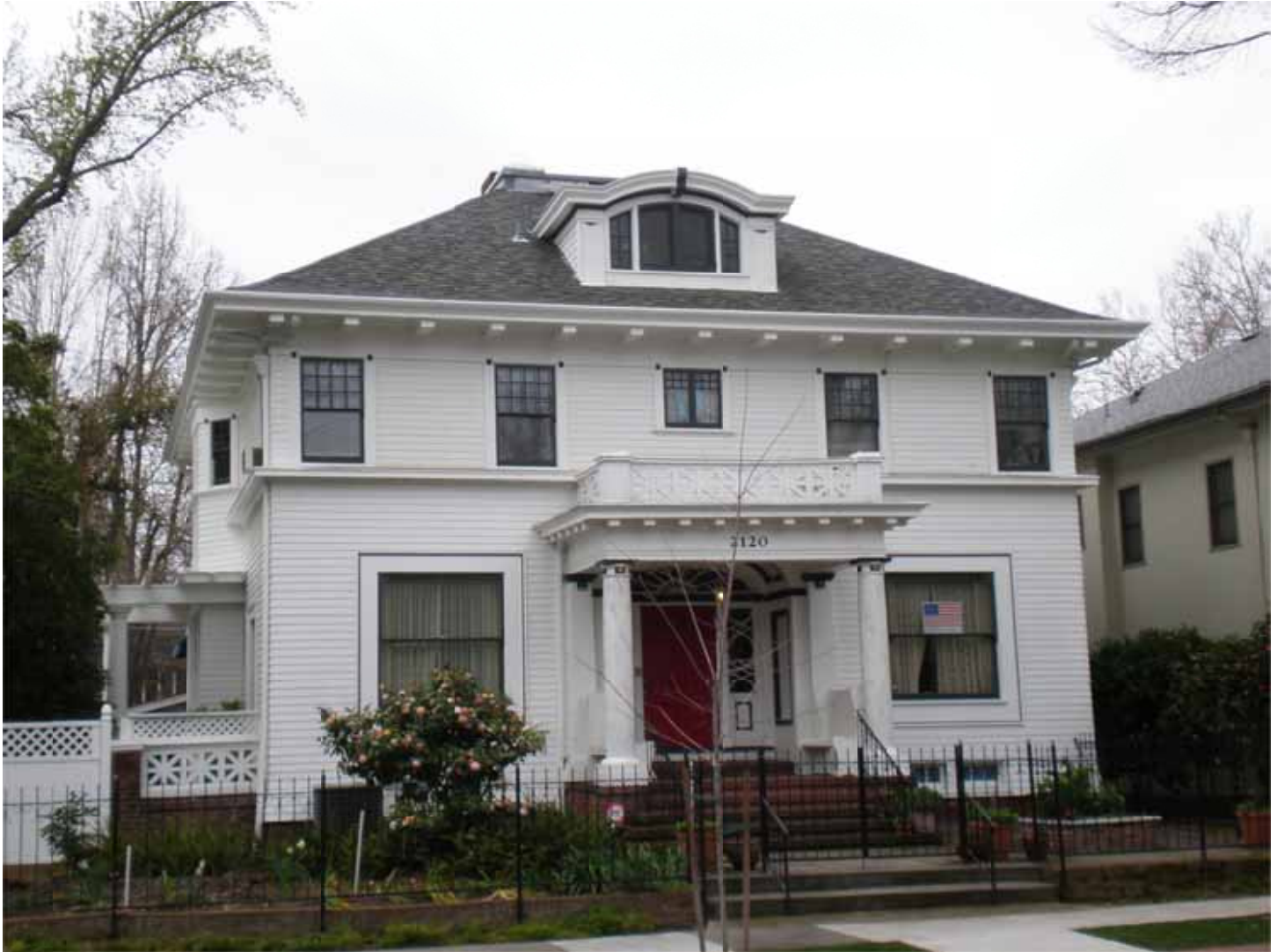
California_Sacramento_Boulevard Park_0030 Henry B. Drescher House, Colonial Revival foursquare, 2120 G Street, facing south