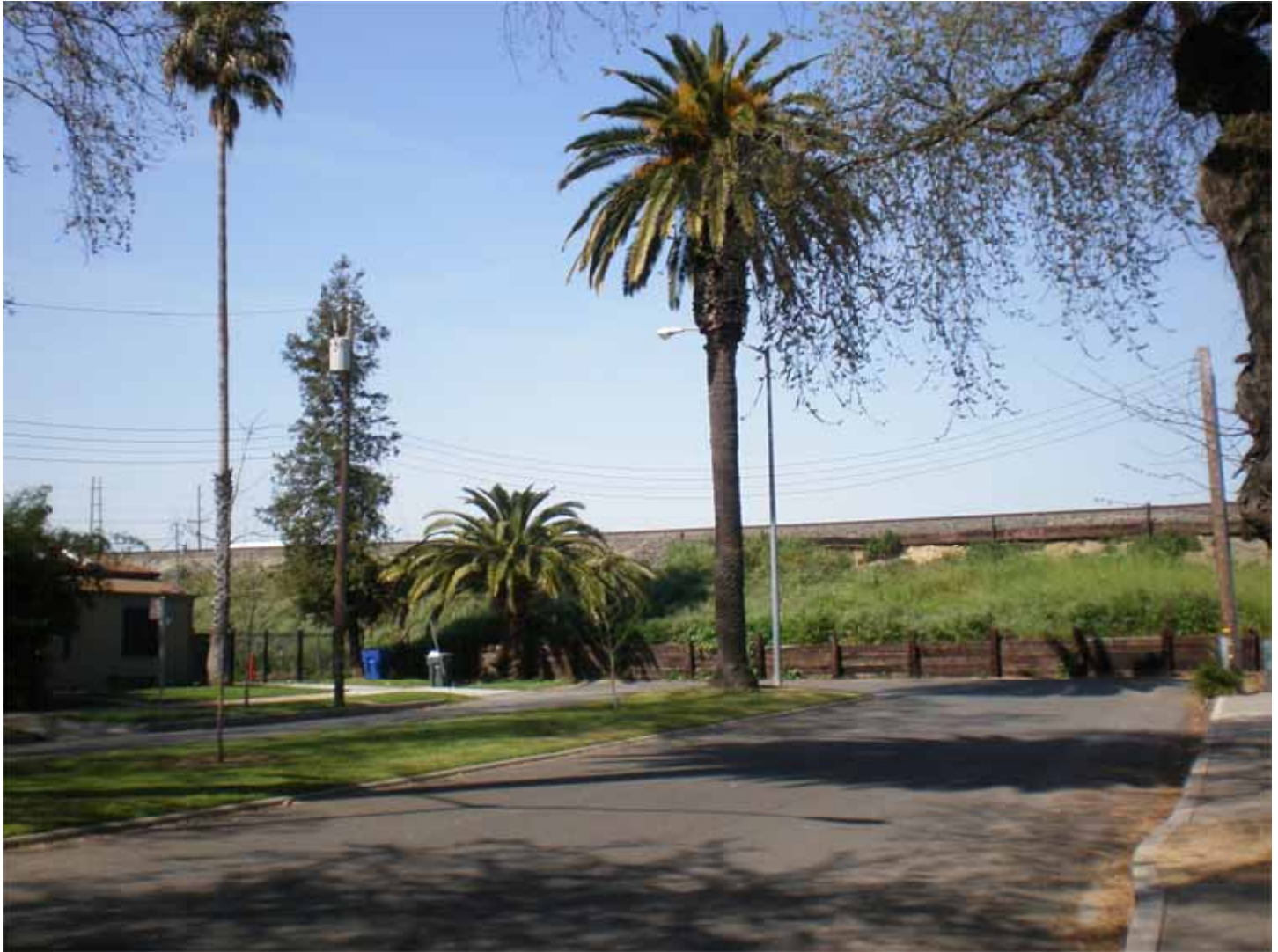
California_Sacramento_Boulevard Park_0039 Street median, 21 st Street between B Street levee and C Street, facing northwest