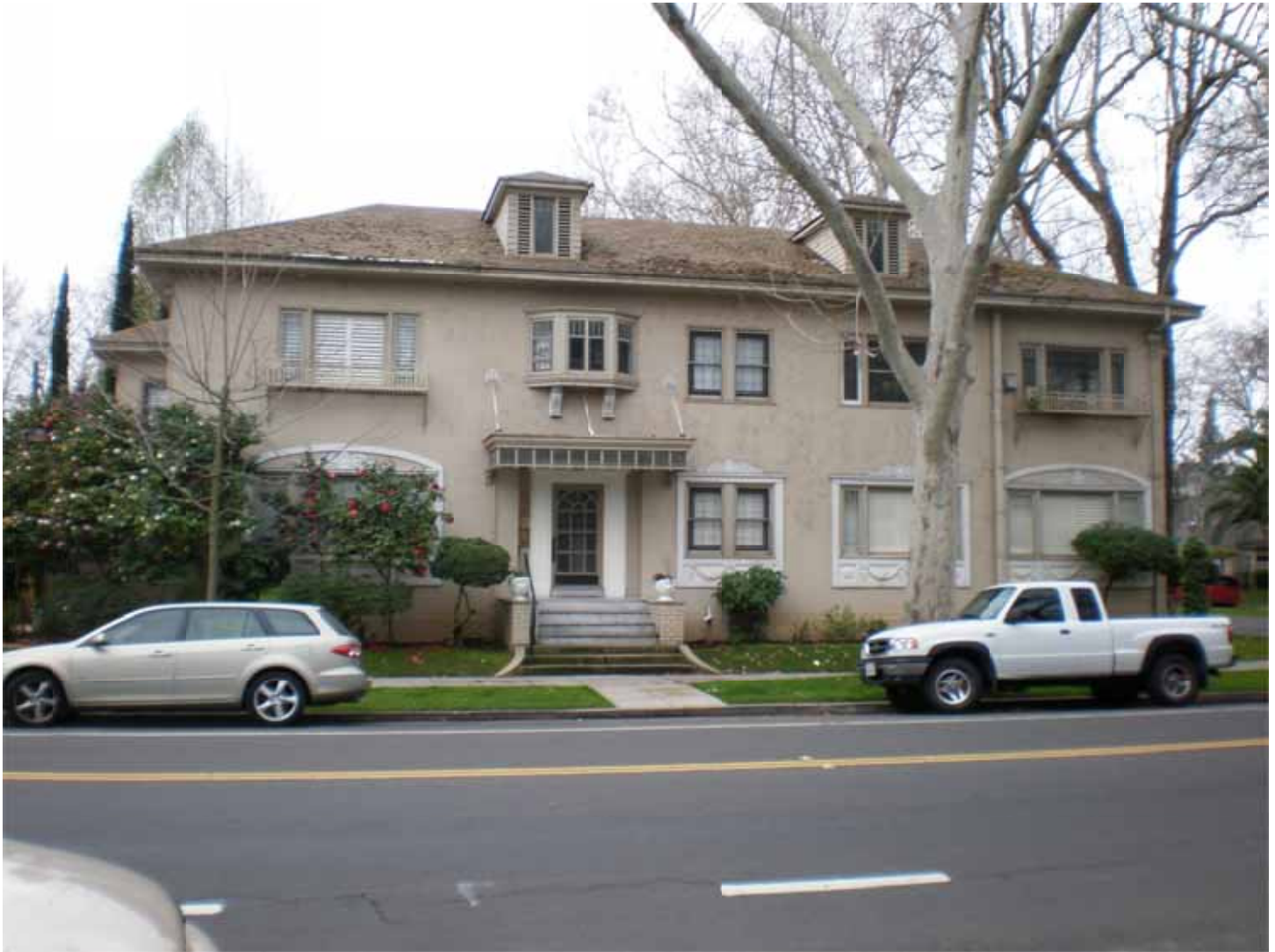
California_Sacramento_Boulevard Park_0024 Colonial Revival apartment building, 701 21 st Street, facing south