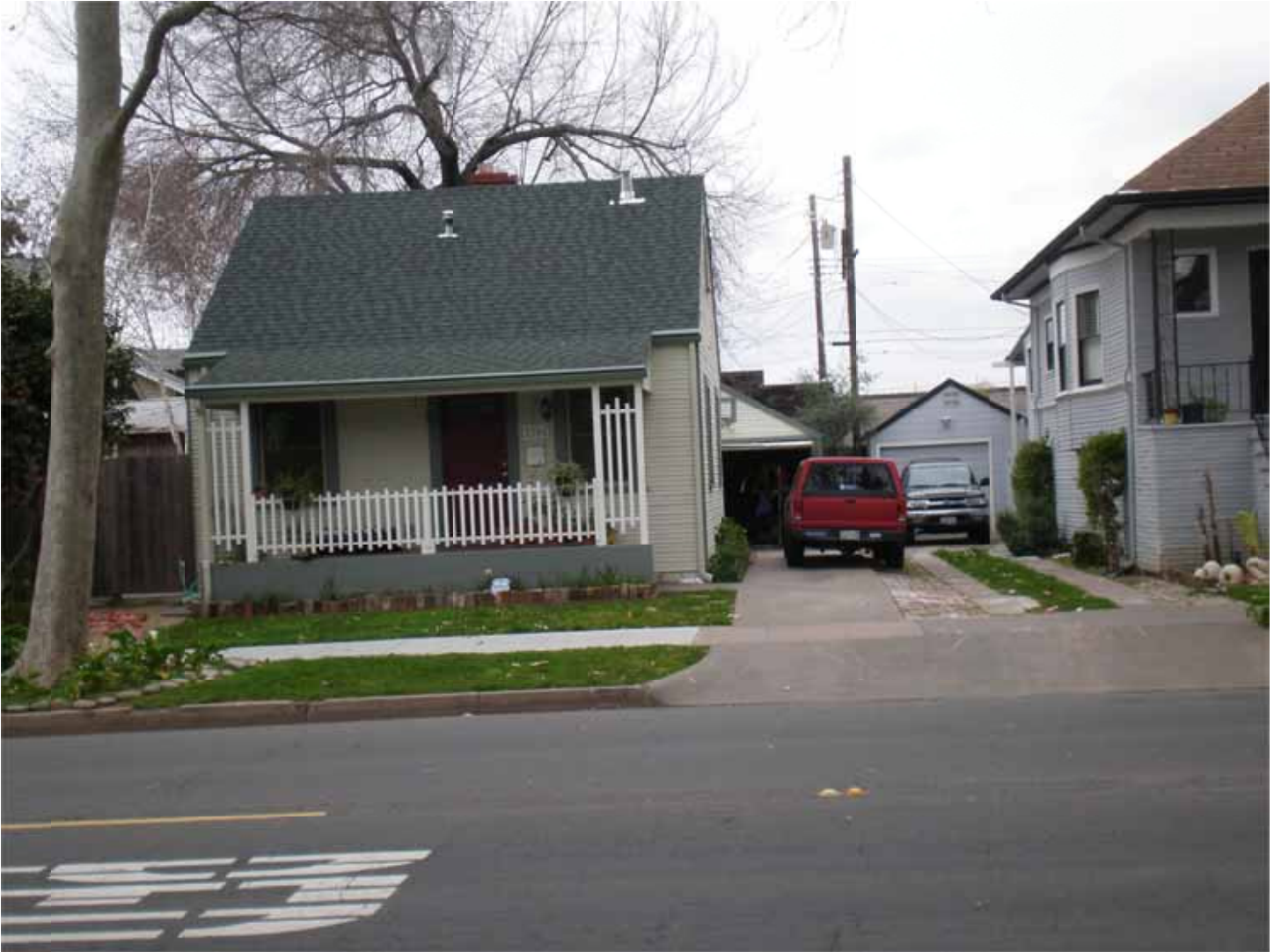
California_Sacramento_Boulevard Park_0010 Minimal Traditional cottage, 2205 C Street, facing north