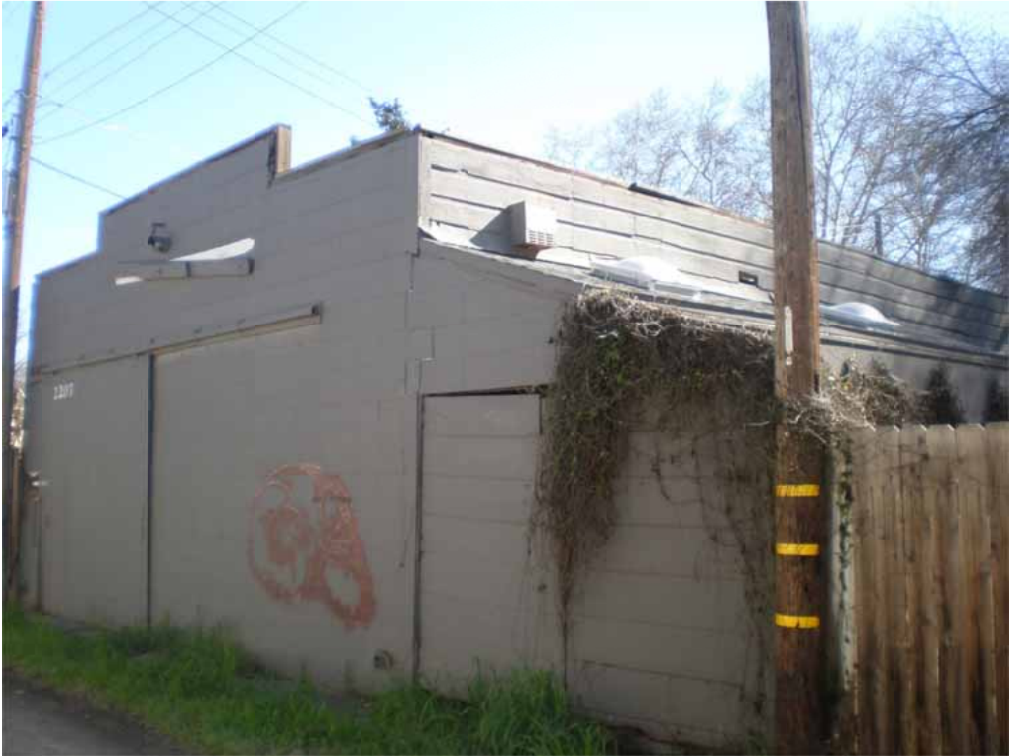
California_Sacramento_Boulevard Park_0014 Earle Plumbing Company warehouse/workshop, 2207 C Street (alley), facing southeast