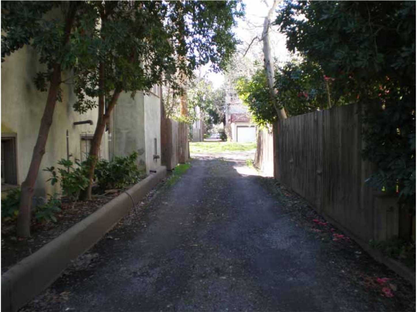
California_Sacramento_Boulevard Park_0037 Alley between 21 st /22 nd /F/G Street towards Elm Park Club, facing east