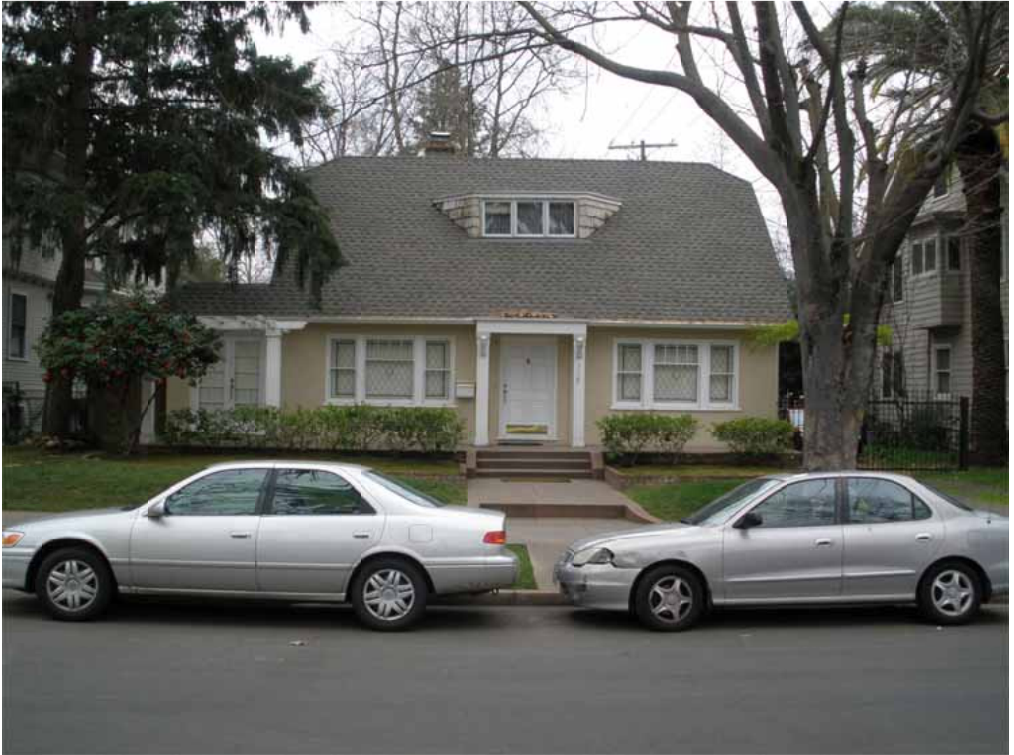
California_Sacramento_Boulevard Park_0009 Colonial Revival/Cape Cod residence, 718 21 st Street, facing west