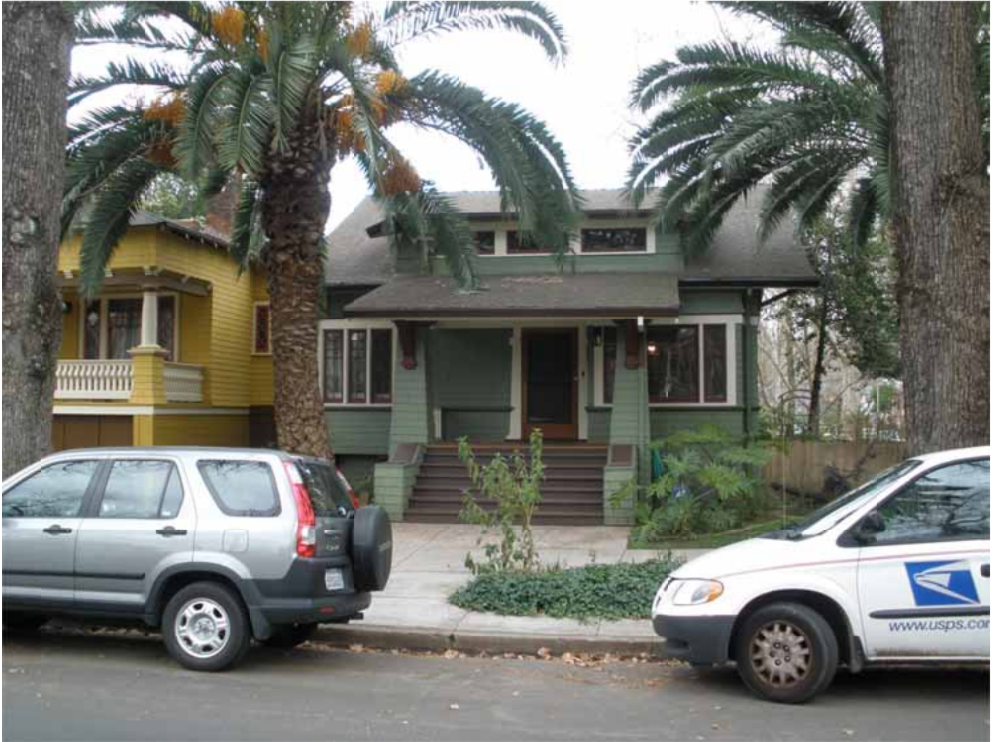
California_Sacramento_Boulevard Park_0006 Wright & Kimbrough Craftsman bungalow, 531 21 st Street, facing east