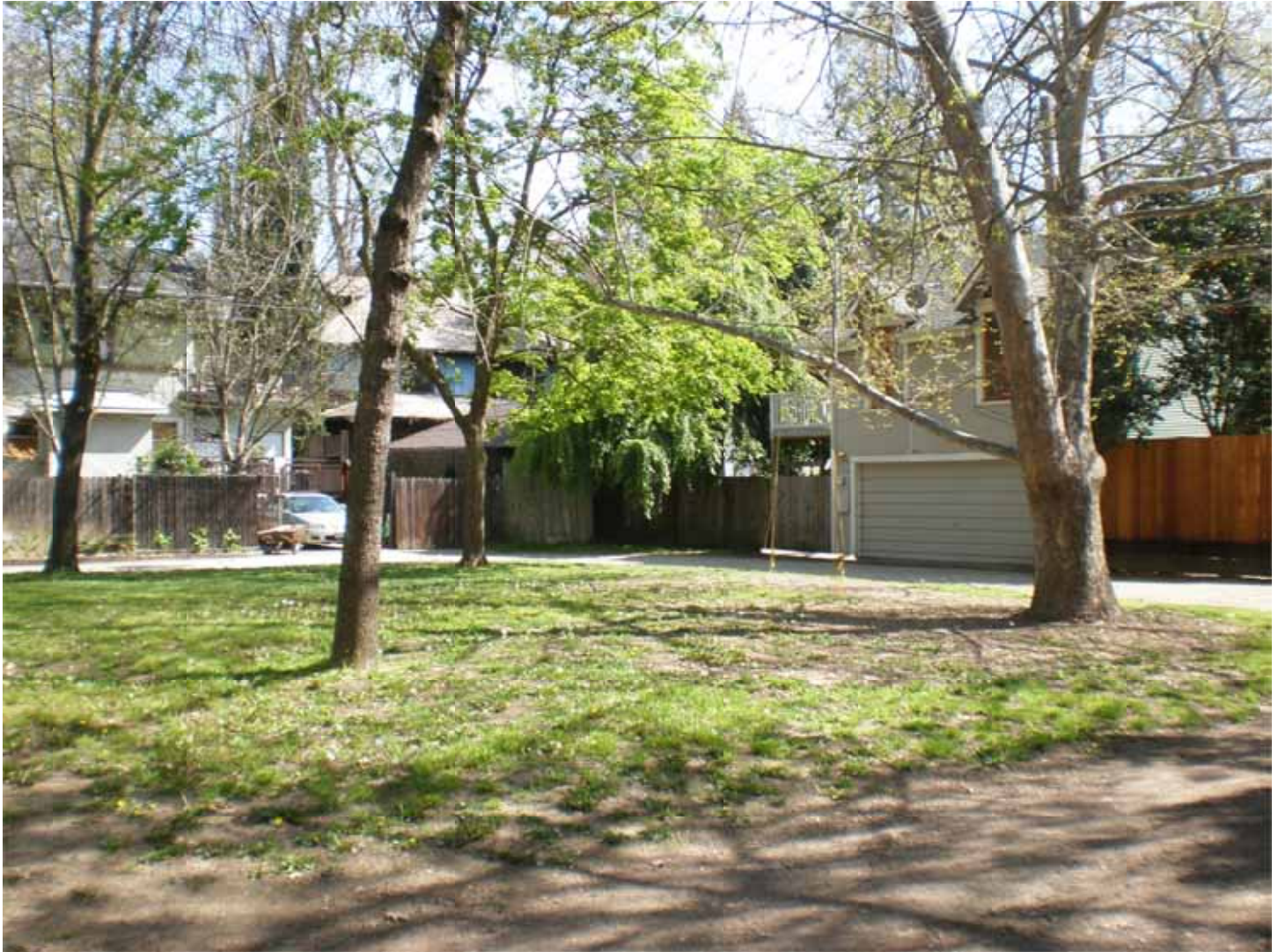
California_Sacramento_Boulevard Park_0035 Elm Park Club alley park, 21 st /22 nd /F/G Street, facing southeast