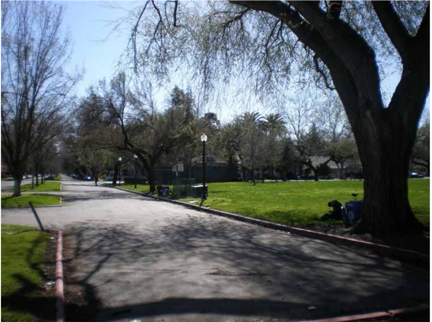
California_Sacramento_Boulevard Park_0038 Street medians, 22 nd Street from B Street, facing south