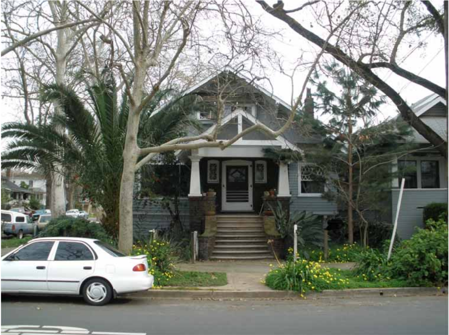
California_Sacramento_Boulevard Park_0025 John W. Ott House, Craftsman bungalow, 501 21 st Street, facing east