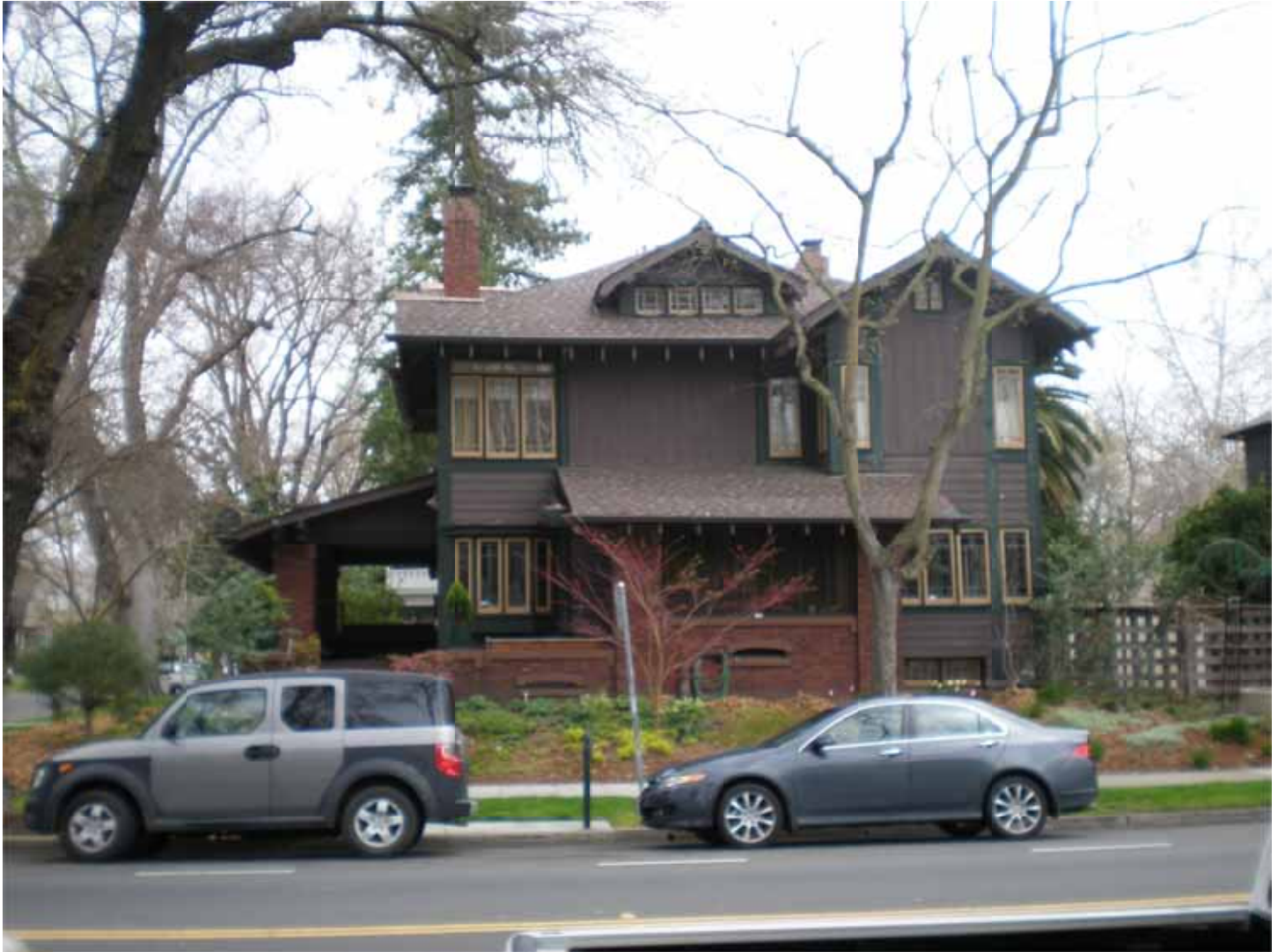
California_Sacramento_Boulevard Park_0004 Cranston-Geary House, Craftsman "Ultimate Bungalow", 2101 G Street, facing north