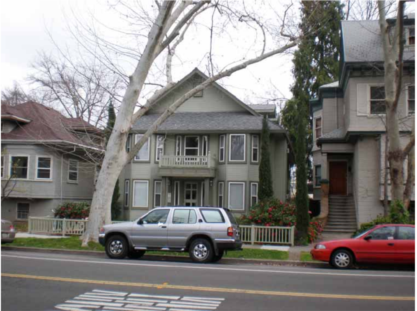
California_Sacramento_Boulevard Park_0032 Non-contributing apartment building, 2215 H Street, facing north