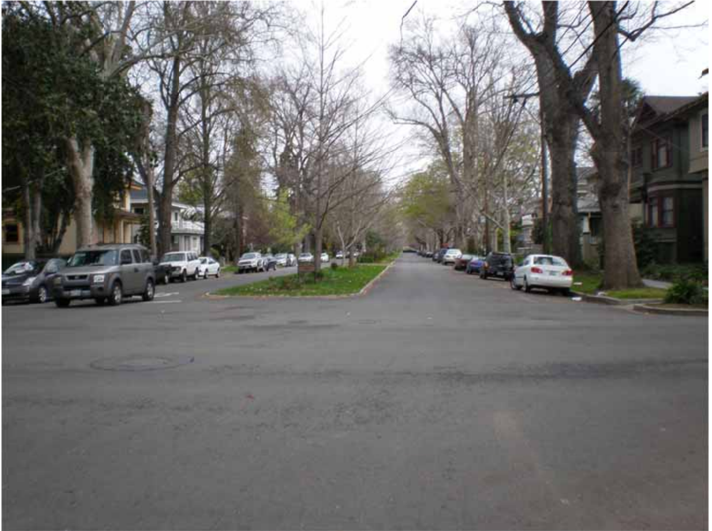
California_Sacramento_Boulevard Park_0040 Street median, 22 nd Street at H Street, facing north