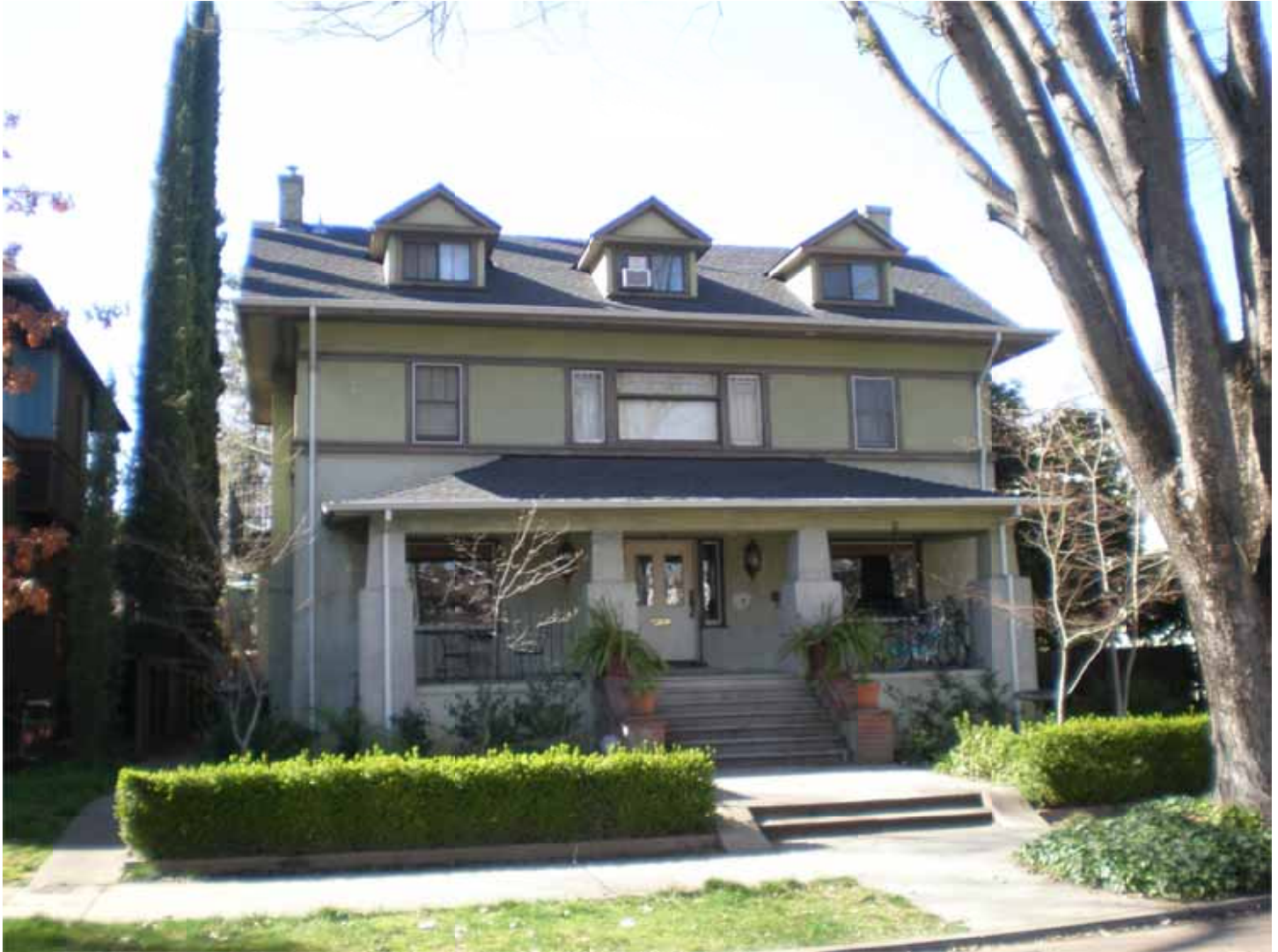
California_Sacramento_Boulevard Park_0003 James Henderson House, Prairie/Colonial Revival residence, 618 22 nd Street, facing west