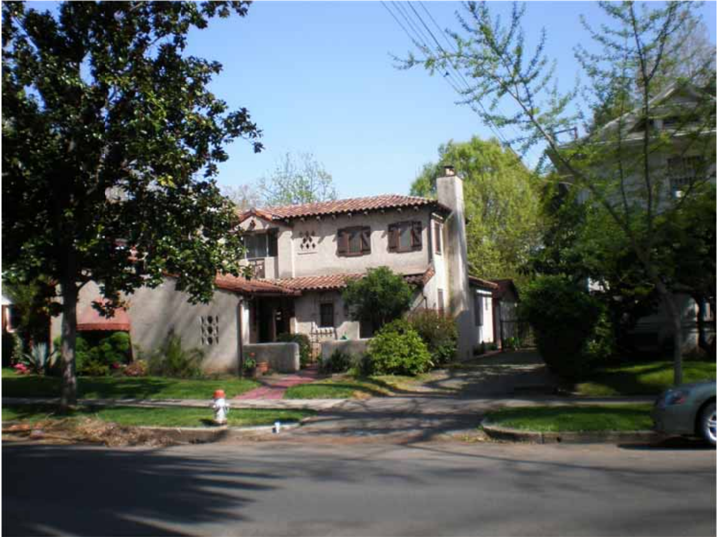
California_Sacramento_Boulevard Park_0018 Clarence H. Smith House, Spanish Colonial Revival residence, 615 21 st Street, facing east