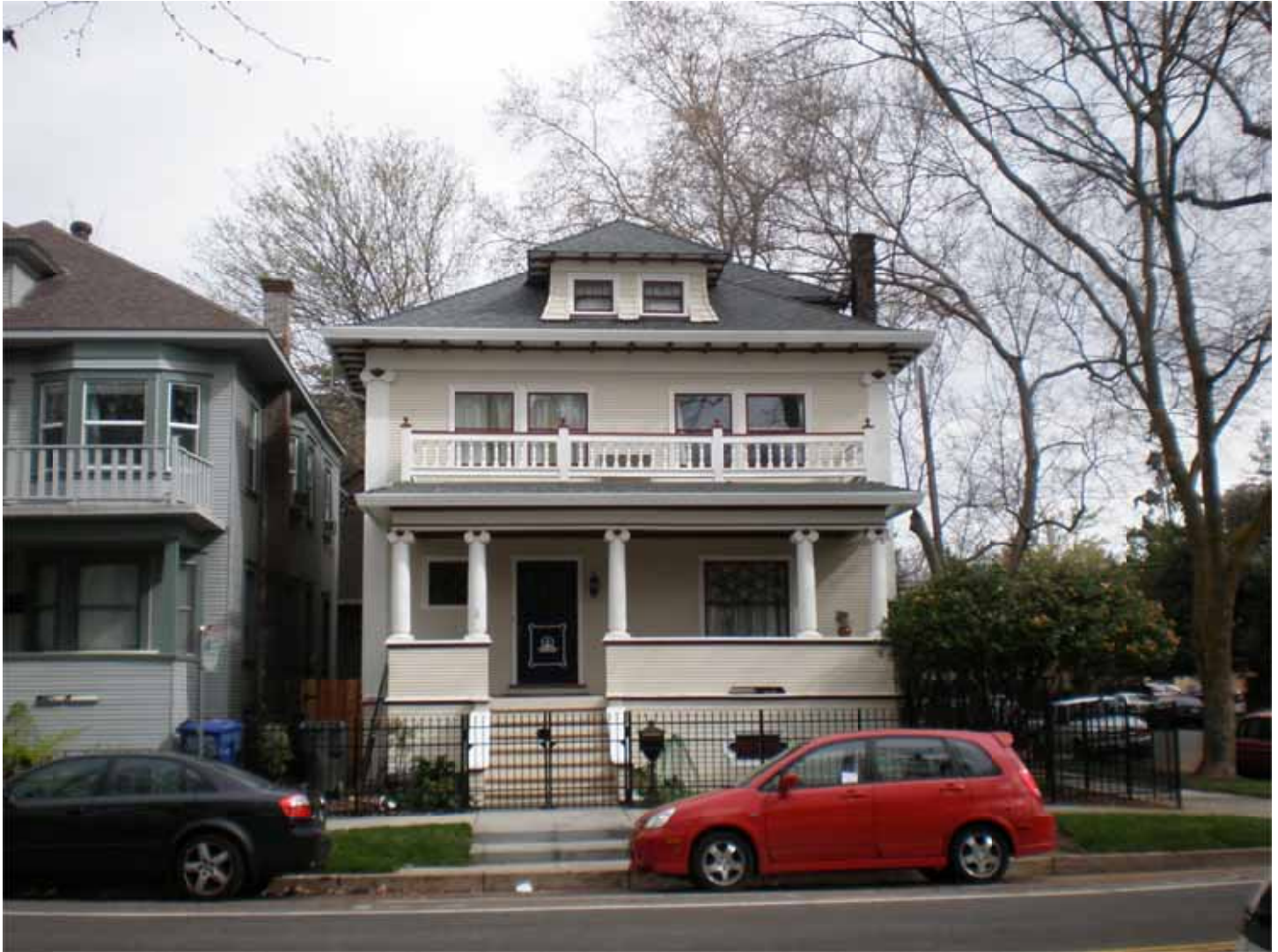
California_Sacramento_Boulevard Park_0002 Classical Revival foursquare, 2231 H Street, facing north