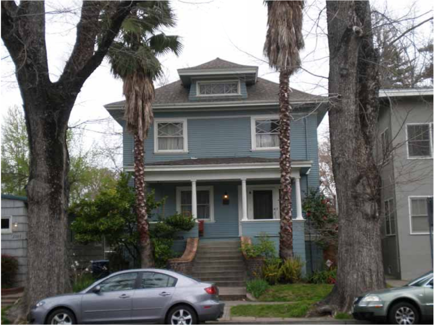
California_Sacramento_Boulevard Park_0021 Wright & Kimbrough Classical Revival foursquare, 2009 G Street, facing north