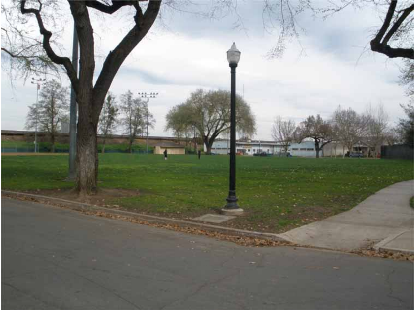
California_Sacramento_Boulevard Park_0033 Grant Park, corner of 21 st and C Street, facing northeast