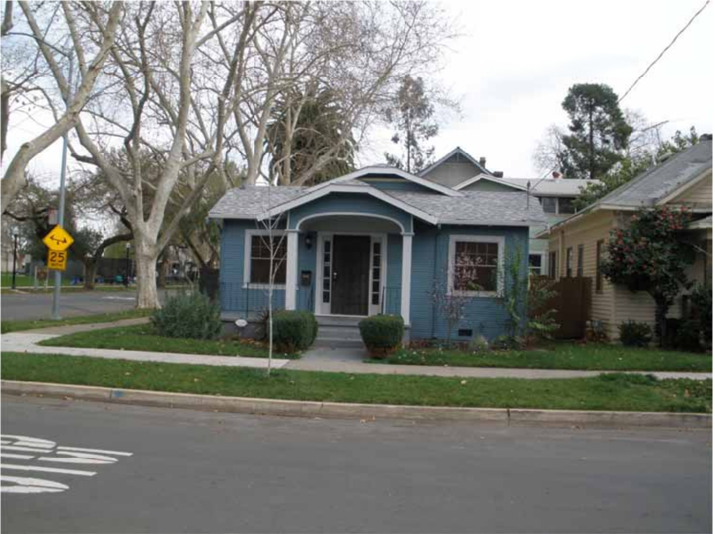
California_Sacramento_Boulevard Park_0007 California bungalow, 301 21 st Street, facing east