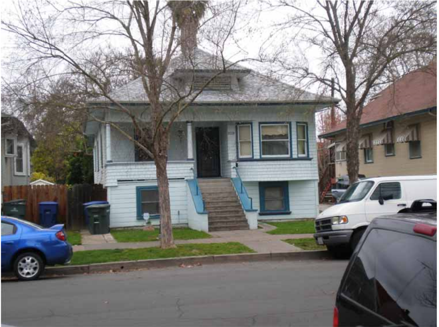
California_Sacramento_Boulevard Park_0011 Neoclassic row house, 2119 D Street, facing north