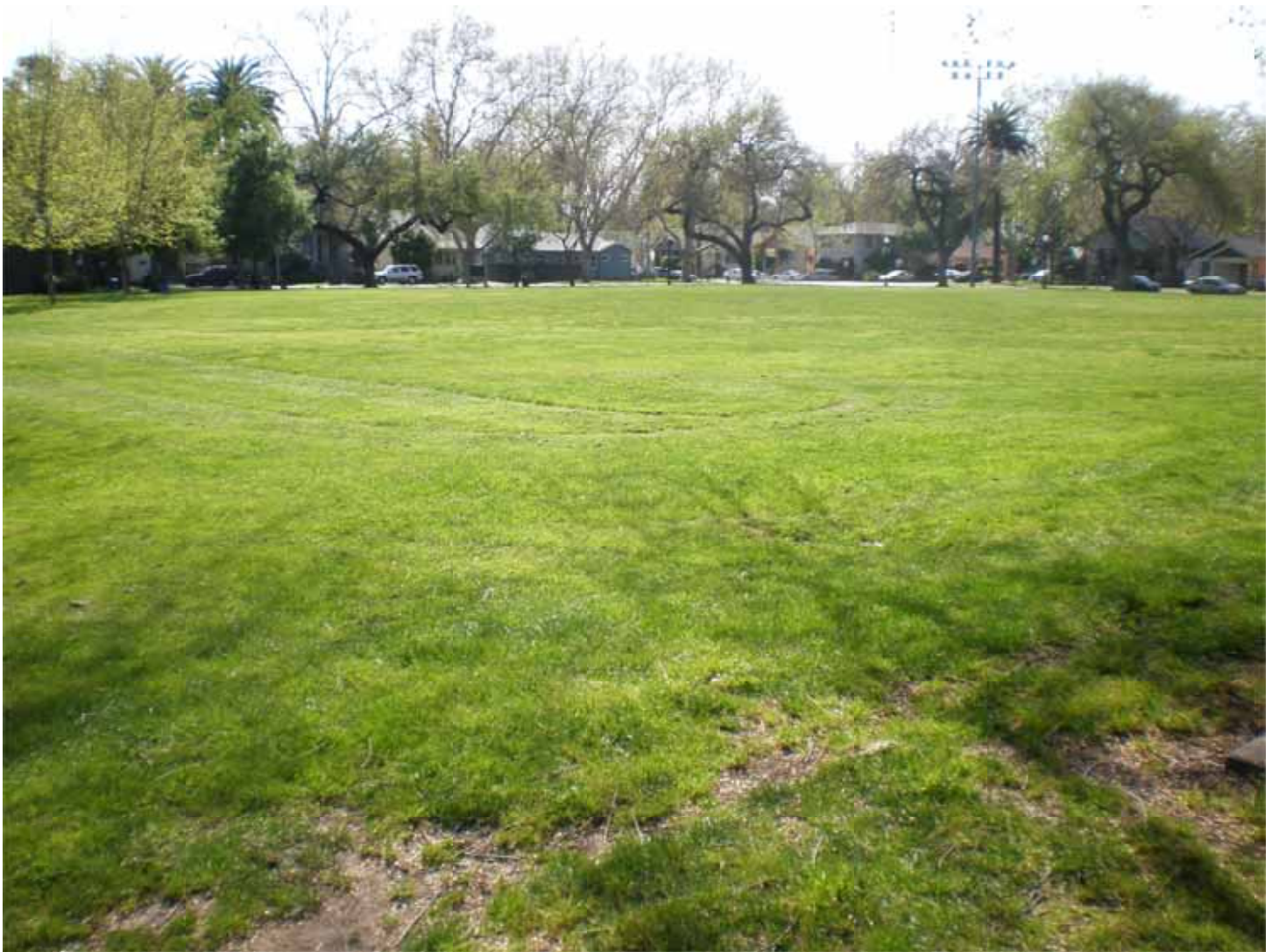
California_Sacramento_Boulevard Park_0034 Grant Park, corner of 22 nd and B Street levee, facing southeast