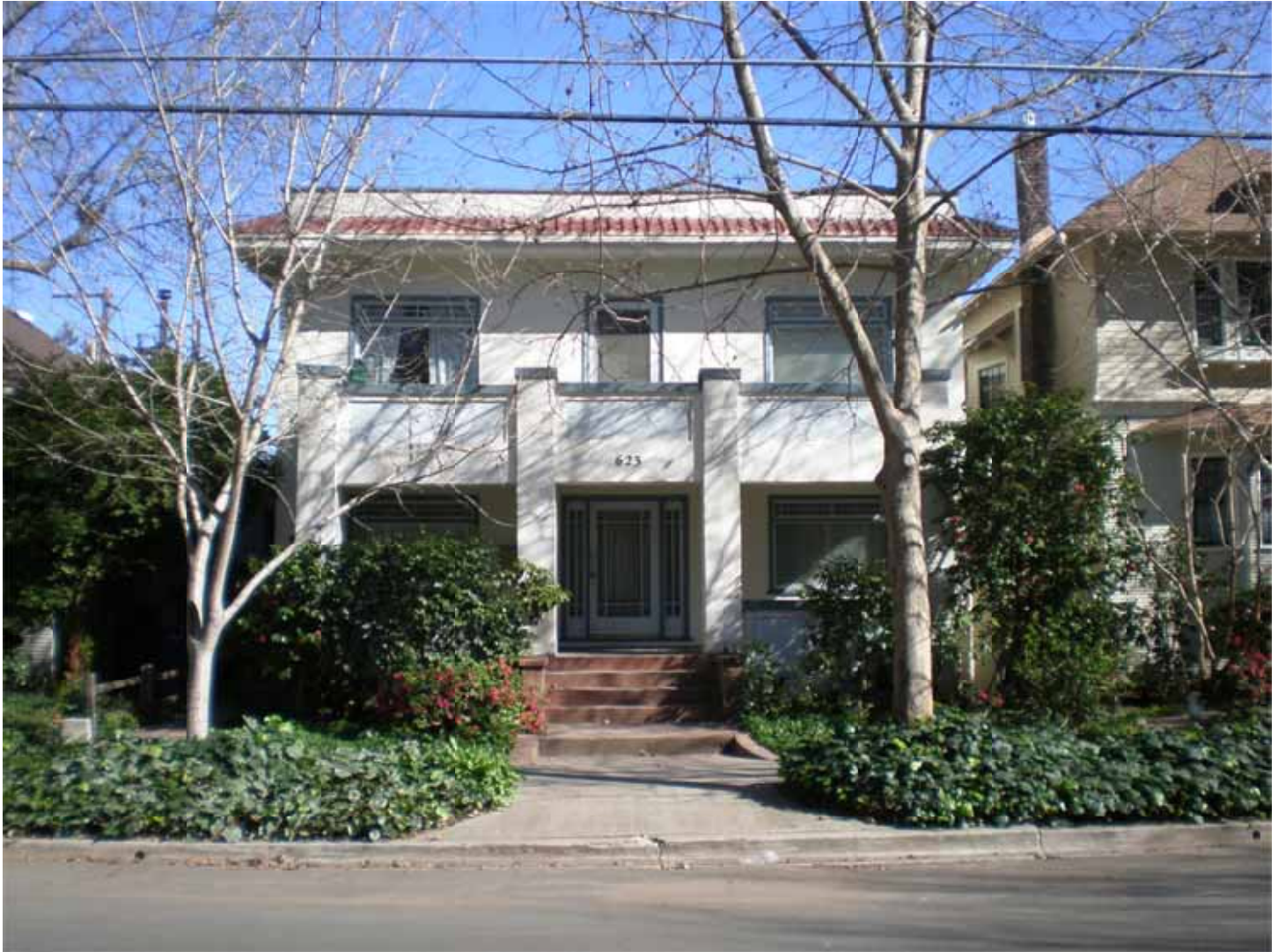
California_Sacramento_Boulevard Park_0013 Spanish Colonial Revival apartment building, 623 22 nd Street, facing east