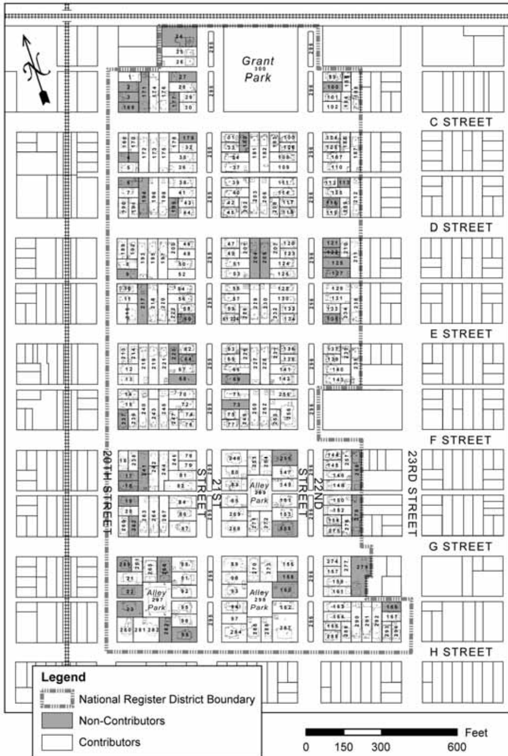
Boulevard Park Boundary Map, Indicating Contributors and Non-Contributors