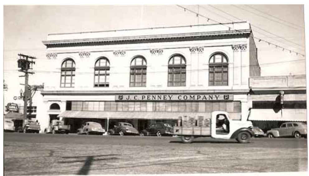
Figure 2: Historic photo of Masonic Hall, circa 1945