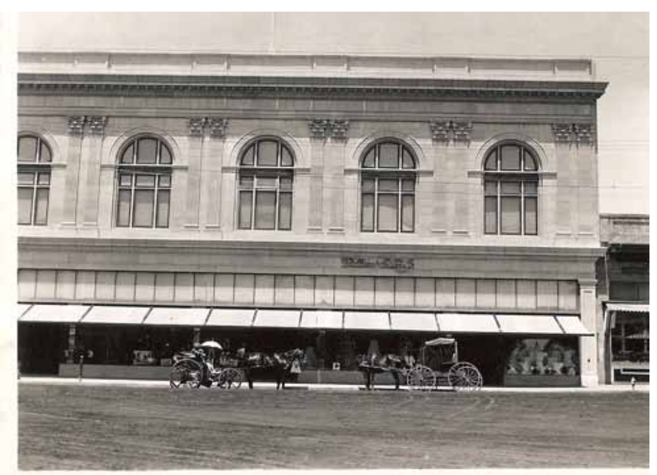
Figure 1: Historic photo of Masonic Hall, 1916