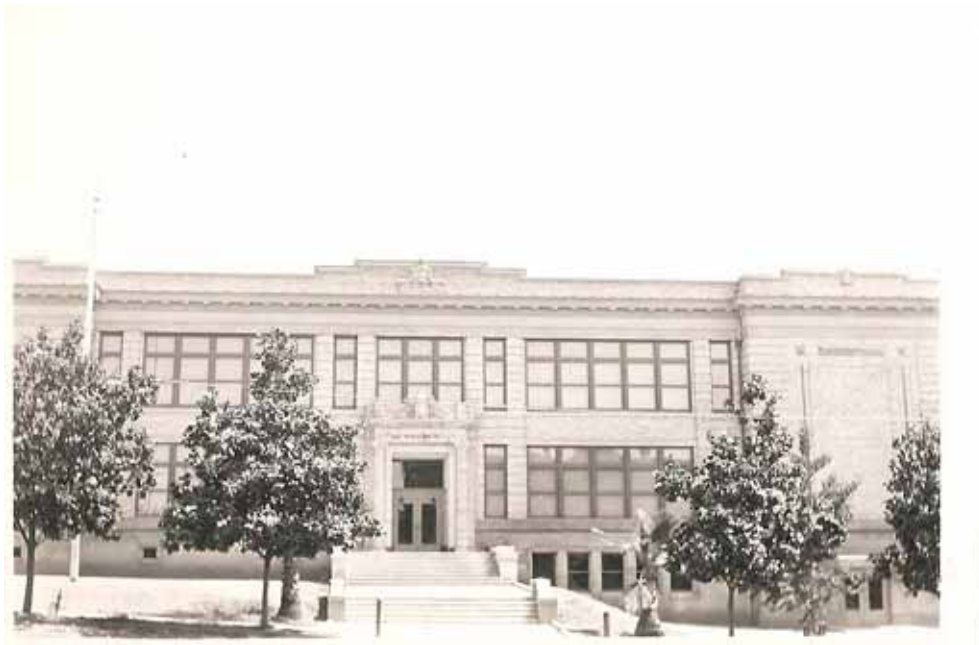
Figure 1: Auburn Grammar School circa 1920