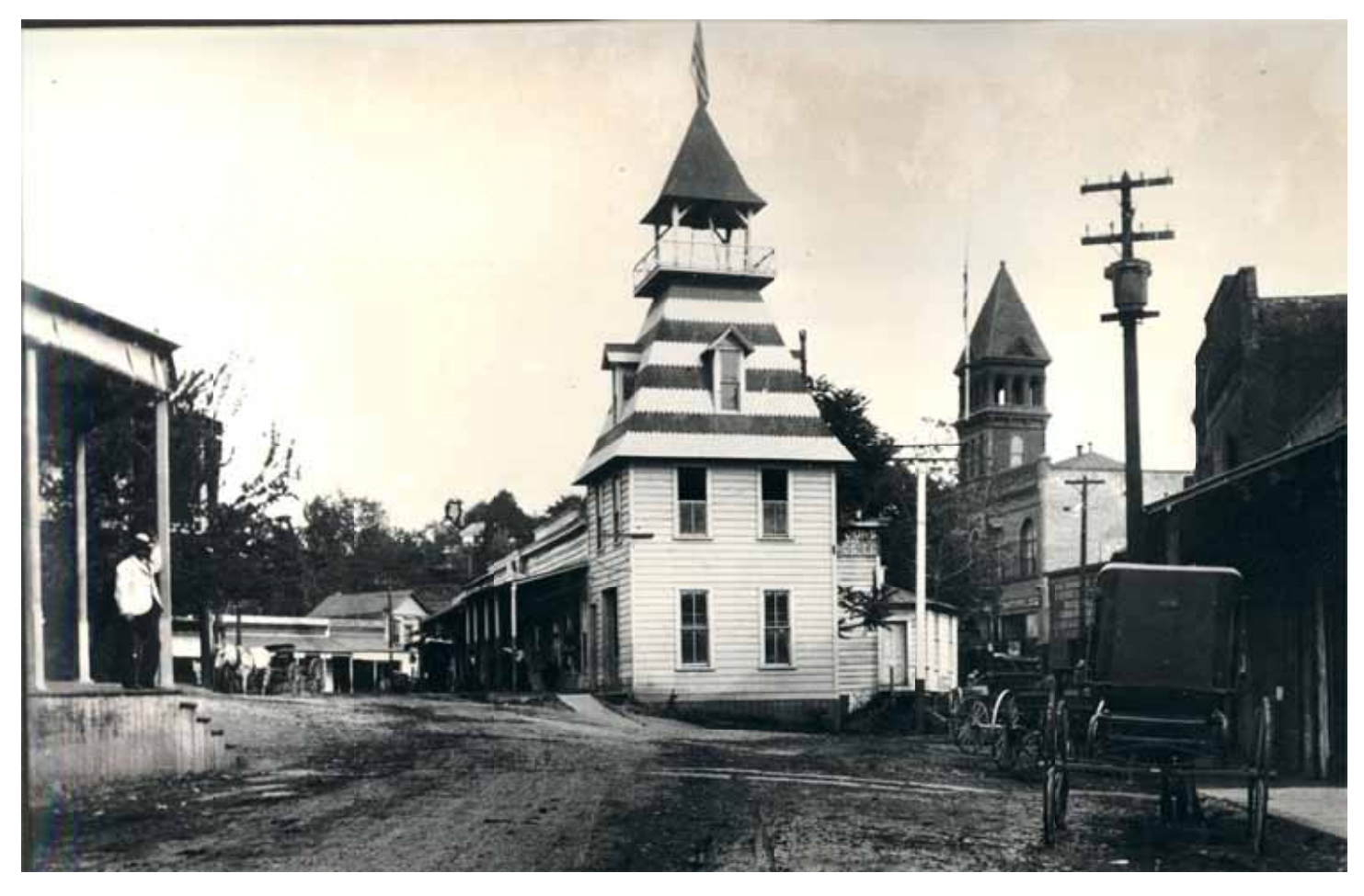
Figure 1 of 4 Historic Fire House No 2 c 1896

Figure 1 of 4 Historic Fire House No 2 c 1896 Figure 2 of 4 Historic Fire House No 2 c. 1940 Figure 3 of 4 Historic Fire House No. 2 c.1954 Figure 4 of 4 Historic Fire House No. 2 c 1960