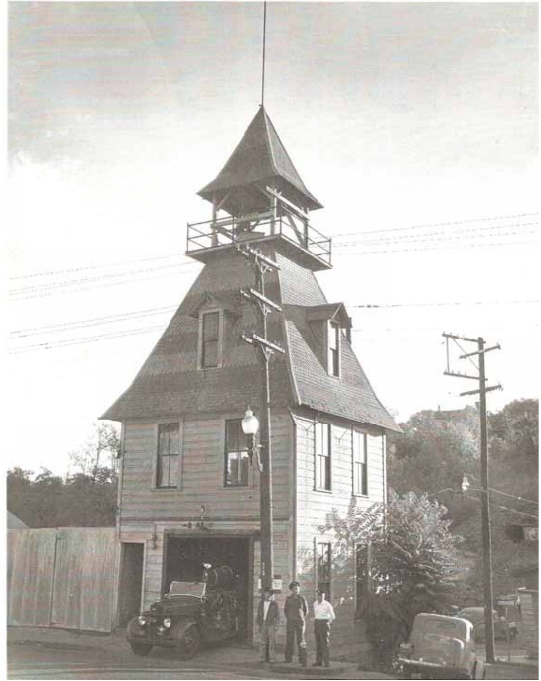
Figure 2 of 4 Historic Fire House No 2 c. 1940