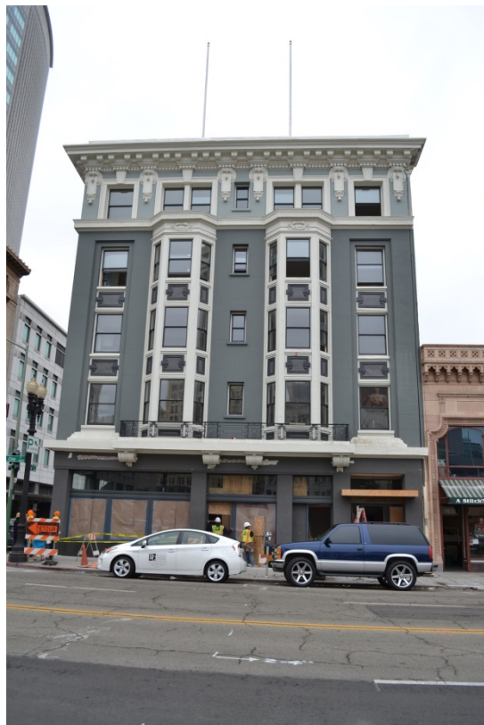
Alameda County Building and Loan Association Building, Alameda County