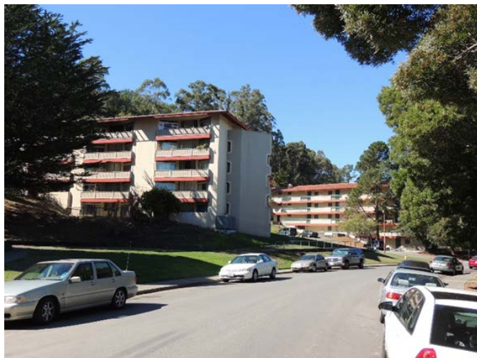
Marin City Public Housing, Marin County