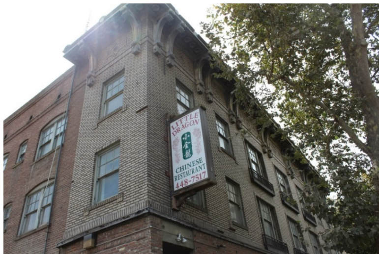
American Cash Apartments, Sacramento County

built apartment buildings with ground-floor retail, and, as such, introduced a new type of residential building to Sacramento.