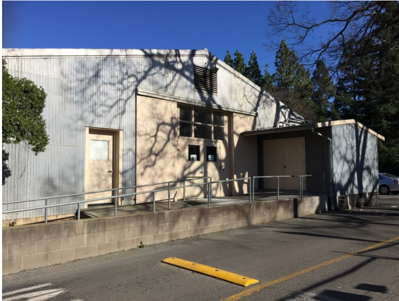
TB-9, Yolo County