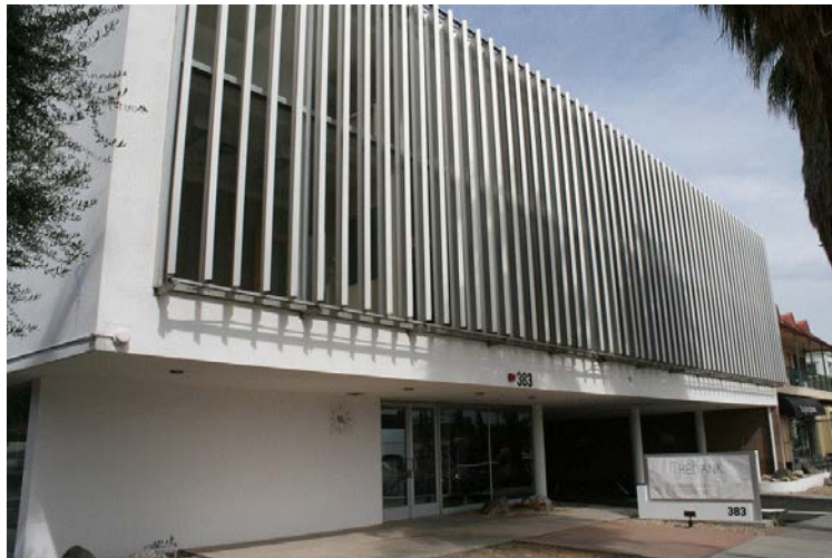
Coachella Valley Savings #1, Riverside County