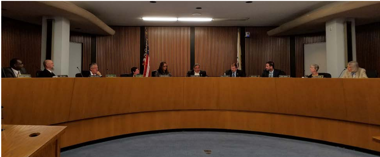
State Historical Resources Commission Meeting, Resources Building, Sacramento, October 27, 2017