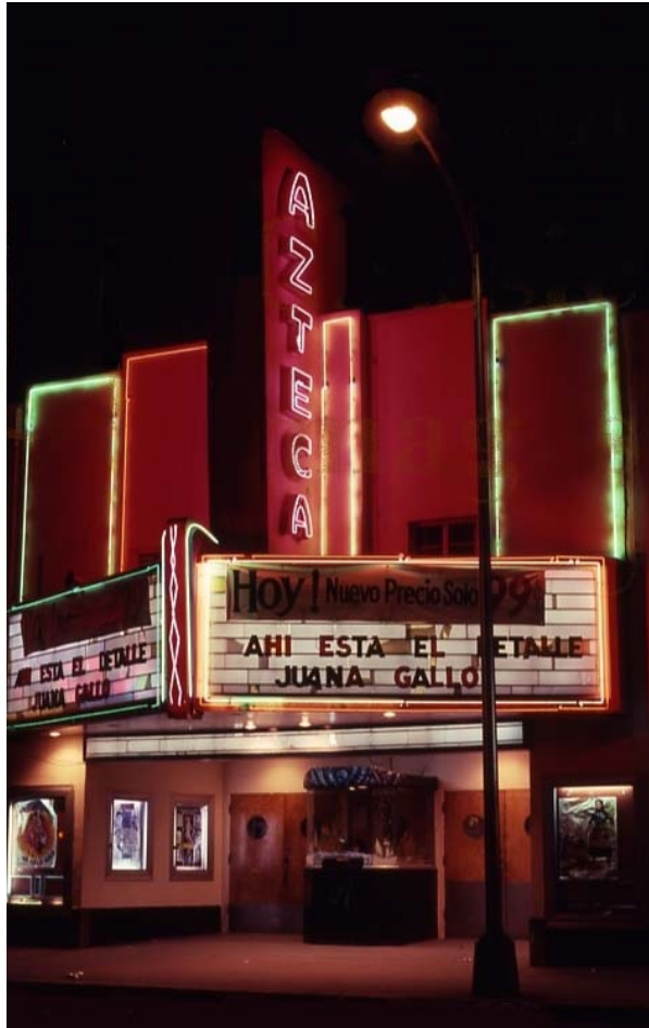
Azteca Theater, Fresno County

the residence is also unusual in that it was discovered circa 2000 as one of his commissions.