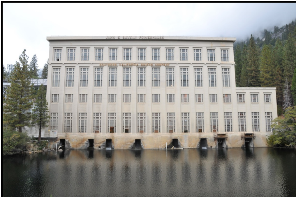
Big Creek Hydroelectric System Historic District, Multiple Counties