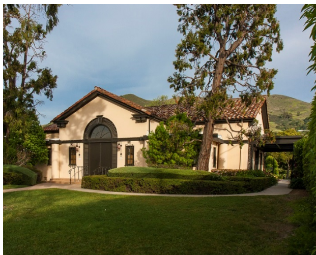
Monday Club of San Luis Obispo, San Luis Obispo County

borders on each side of the tower are the original borders from the Blue Diamond sign. The building was rehabilitated and converted to a winery between 2010 and 2014.