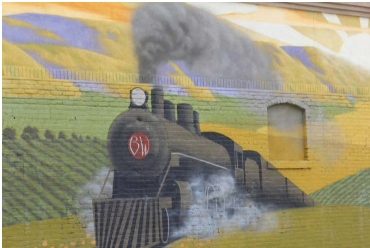
Mural, 360 Orange Street, Historic Downtown Redlands, October 27, 2016

In October 2016, after an administrative session, co-hosts Redlands Conservancy and Redlands Area Historical Society led a tour of Redlands' historic downtown, followed by a reception at Morey Mansion.