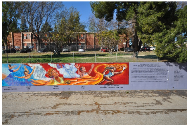
Great Wall of Los Angeles, Los Angeles County

This Mediterranean Revival style five-story, H-shaped building was constructed in 1913 as a residential hotel in the Venice neighborhood of Los Angeles. Built during a time of demographic shifts for Venice—an influx of new residents and lessening of a dependence on traditional housing situations—these types of buildings offered a novel alternative to the city's new residents, and relates to the broader theme of commercial development in the city in the 1910s and 1920s.