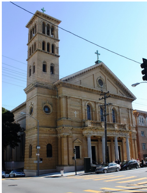
Sacred Heart Parish Complex, San Francisco County