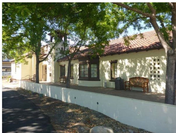
Yountville Grammar School, Napa County

This Mission/Spanish Colonial Revival style building was constructed circa 1920. Character defining elements include a Mission-style bell tower, a single prominent arched front entry doorway, multi-light wooden casement windows, wooden lintels and lug sills, a red clay tile roof, a hipped, angled bay window, and Spanish Eclectic decorative wooden vents located within the bell tower. One of only three buildings in this style remaining in Yountville, in 1977 the school was repurposed as Yountville Town Hall.