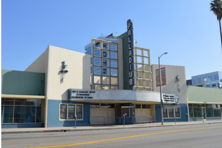
Hollywood Palladium, Los Angeles County