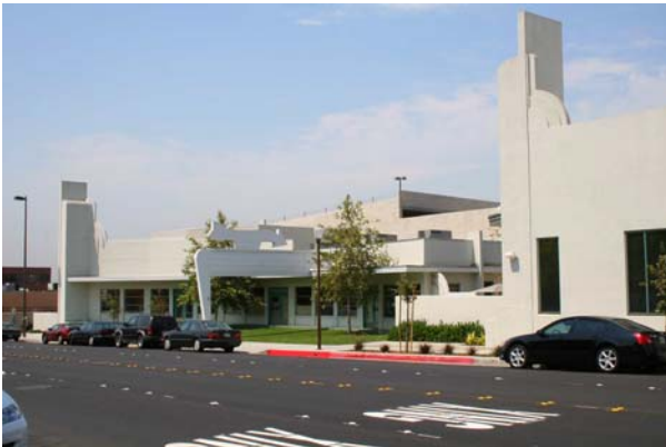
Royal Laundry Complex, Pasadena, Los Angeles County, listed September 27, 2007

Royal Laundry Complex consists of three buildings and a "drive-up" sign. The complex was listed in the National Register at the local level of significance under Criterion C in two historic contexts. The Main Plant, constructed in 1927, was listed for its high artistic merit. The Drive-up Building, Annex, and "drive-up" sign were listed under the Multiple Property Documentation for Early Auto-Related Properties in Pasadena. This property was previously certified by the National Park Service for a federal tax credit as a rehabilitation project.