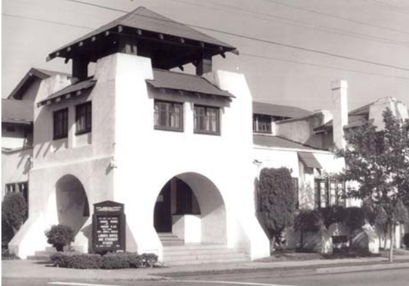
South Berkeley Community Church, Berkeley, Alameda County, listed November 15, 2007