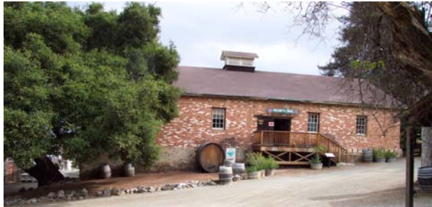
Picchetti Ranch Winery.

In 2002, a small but select group of historic preservation projects was funded from the California Heritage Fund and administered by the Office of Historic Preservation, which usually does not have grant funds available.