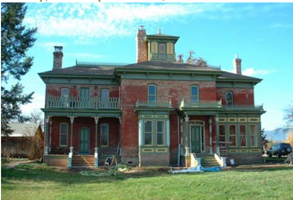
Spotswood House near Potter Valley, Mendocino County, listed September 27, 2007