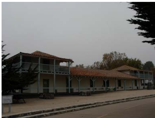
Landmark Number 1, the Customs House Monterey

to install, or re-dedicate, any of the hundreds of Landmarks that have no official plaques. OHP will