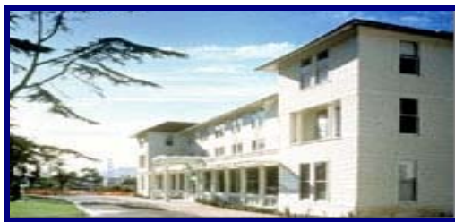
Thoreau Center, Presidio, San Francisco, CA (Ledy Maytum Stacy Architects)

The architectural unit of OHP looks forward to the challenge and reward of assisting in innovative preservation projects that incorporate sustainable