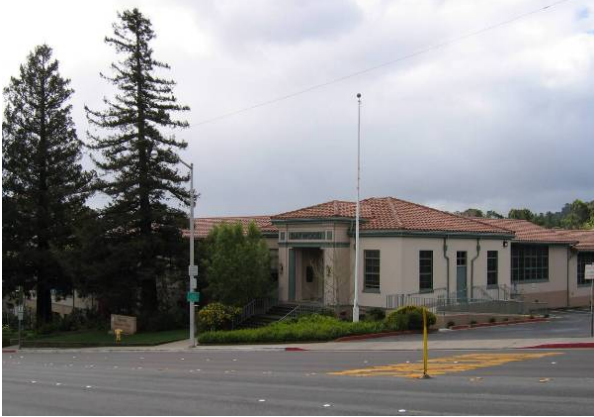
Baywood Elementary School, San Mateo, listed August 3, 2007