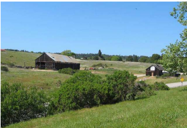
Cowell Lime Works Historic District, Santa Cruz County, listed November 21, 2007

Cowell Lime Works Historic District consists of a concentration of industrial and ranch-related buildings, structures, and objects constructed of wood and limestone masonry. All the resources relate to limestone quarrying and lime production including lime kilns, a cooperage, supporting barns, and residential buildings, dating to the latter half of the nineteenth century and early decades of the twentieth century. Throughout its years of operation, 1853 to 1920, the Cowell Lime Works was the largest lime manufacturer in Santa Cruz County, providing lime for mortar for brick and stone buildings, fireplaces, chimneys, and foundations in the San Francisco Bay Area, and for exporting. The district was listed in the National Register under Criterion A in the area of industry.