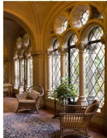
Berkeley Women's City Club.

sales, wine tasting, and public events. The $50,000 grant plus match to the non-profit Open Space District was used to seismically retrofit the historic un-reinforced masonry building and provide public access for the disabled.