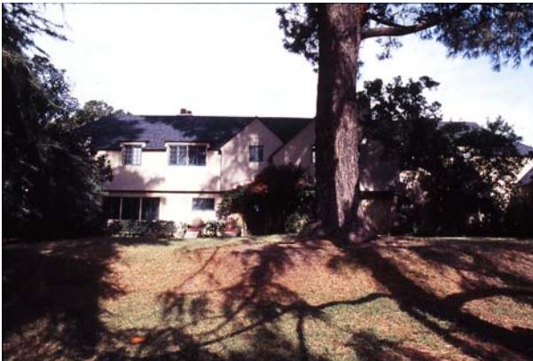
Buffum House, Altadena, Los Angeles County, listed August 3, 2007

The Buffum House was designed by master architect Wallace Neff in 1924. This French Provincial style house was listed in the California Register in the area of architecture as a good example of its style, and as the work of a master architect. Neff is recognized as one of the preeminent architects of the Spanish Colonial-Revival style in Southern California. The Buffum House is an example of his less common design choices and is the only known local Neff-designed house in the French Provincial style.