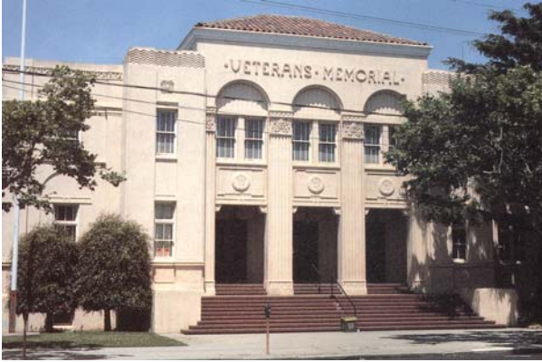
Alameda Veterans' Memorial Building, Alameda, listed September 27, 2007