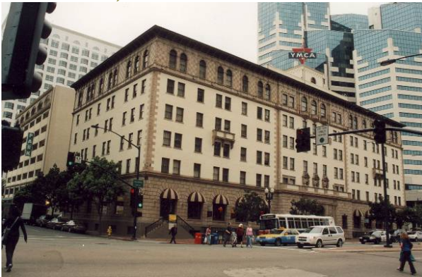
Armed Services YMCA, San Diego, listed November 15, 2007

San Diego Armed Services YMCA was listed at the local level of significance. Constructed in 1924 in the Italian Renaissance style by architect Lincoln Rogers, the building derives its historical significance in the area of social history from its unique role in providing a variety of religious, physical, cultural, educational, social, and outreach programs to San Diego's military personnel and its architectural significance as an excellent mid-1920s example of the Italian Renaissance Revival style. This property was previously certified by the National Park Service for a federal tax credit as a rehabilitation project.