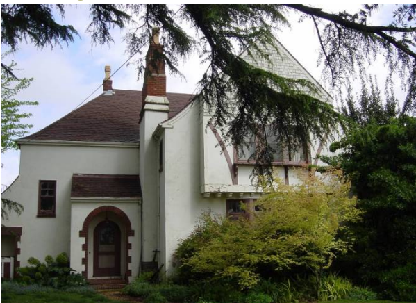
Gerald Frye House, Yuba City, Sutter County, listed August 3, 2007

The Gerald Frye House was listed in the California Register for its architecture. This Period Revival House reflects Tudor design as seen in its gable roof, decorative half-timbering, tall narrow windows, and massive chimneys topped with decorative chimney pots. It is a rare example for a rural ranch home. The house is also the first to be designated by the City of Yuba City for inclusion in its Official Register of Historical or Architecturally Significant Sites.