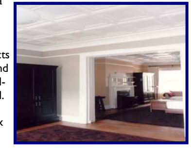
Fort Baker, Sausalito

Although tax credit program regulations may be somewhat