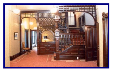
San Dimas Hotel, San Dimas

Sometimes, a completely different use can be successfully implemented to save a historic building whose original use is outdated or no longer needed in a current market place. The most common adaptive reuse over the past several years in California has been the conversion of historic office buildings to