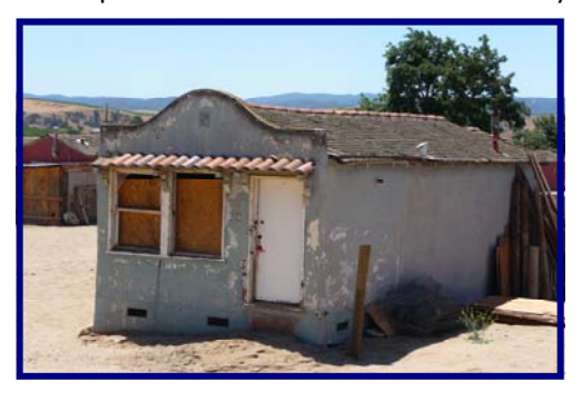
Labor Camp, Monterey County

Los Angeles: $25,000. Prepare an Industrial Development Context and Reconnaissance Survey