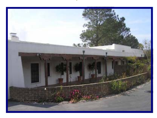
William Black House, address restricted San Diego County Listed November 13, 2009

The William Black House was designed by master architect William Lumpkins and constructed in 1952. The house sits on a prominent mesa overlooking the Pacific Ocean. The house is U-shaped in plan, and was designed in the Pueblo Revival style. The house underwent a series of additions on the ocean-facing side during the 1960s, 1970s, and 1980s, but the house retains its integrity.