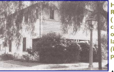
Harada House, Riverside (1918), tested constitutionality of alien land laws in CA (Five Views, p. 194)

Cultural diversity is one of ten issues addressed in the 2006-2010 Update to the California Comprehensive Statewide Historic Preservation Plan (Plan), available on the OHP website at http://ohp.parks.ca.gov/?page_id=21756. Cultural diversity has been an issue identified in the Plan since 1995, and a subject of significance since 1979 when OHP initiated a survey project to identify cultural resources associated with the five largest ethnic minority groups in California during the 50 years after 1848. The results of the survey were compiled and published as Five Views: An Ethnic Historic Site Survey for California in 1988. As stated in the Plan, "Five Views was originally conceived in order to broaden the spectrum of ethnic community participation in historic preservation activities and to provide better information on ethnic history and associated sites. This information can help planners identify and evaluate ethnic properties, which have generally been underrepresented on historic property surveys."