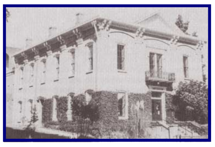
Lake County Courthouse, birthplace (1917) of voting rights for California Indians not living on large reservations, (Five Views, p. 33)

Preservation is more effective when it better reflects the diversity and multiculturalism of our communities. A shared public understanding of the value of a historic resource better protects the resource. In the absence of a shared public understanding, when the perceived value of a resource is uncertain, misunderstood, or contested, sometimes the forces are too great for the defenders of the resource, and it cannot be saved.