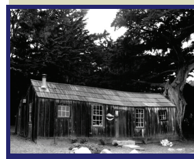
Whaler's Cabin, Monterey County, listed May 9, 2007