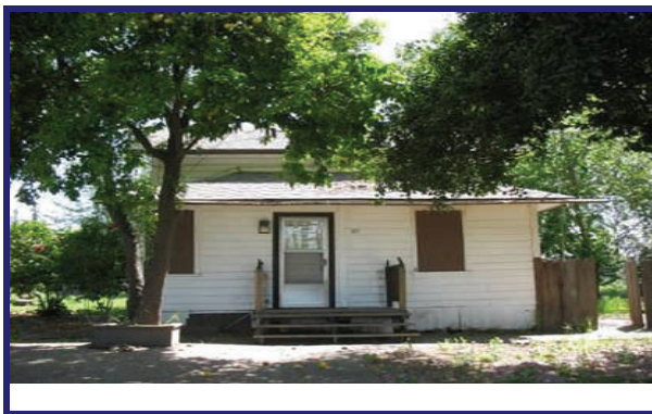
Southern Pacific Railroad Superintendent House, Folsom, Sacramento County, listed June 13, 2008

Southern Pacific Railroad Superintendent House was built in 1915. Listed in the National Register on June 13, 2008 under Criterion A, at the local level of significance, in the area of transportation, the building is one of the few tangible resources remaining in Folsom showing the integral connection SPRR maintained with the local Folsom community and exemplifies the direct presence of the railroad in the lives of its employees. Folsom was the terminus for California's first railroad, the Sacramento Valley Railroad and the town's railroad association substantially shaped subsequent development. The property was previously determined eligible for the National Register of Historic Places by the State Historic Preservation Officer through a Section 106 consensus determination of eligibility.