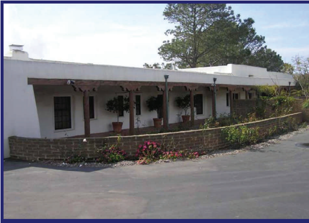
William Black House--SDM-W-12, listed May 2, 2008

Black, William, House--SDM-W-12 was listed in the National Register May 2, 2008 under Criterion C for architecture and under Criterion D for the prehistoric archaeological site's potential to yield important information. Black House was listed under Criterion C as an excellent example of the Pueblo Revival style designed by master architect, William Lumpkins. The period of significance is 1952. In Black House, Lumpkins successfully integrates the progressive attitudes and some features of Mid-Century Modernism into the Pueblo Revival style. This integration is seen in the stylistic difference between its public (street-facing) Pueblo Revival and private (ocean-facing) Mid-Century Modern facades. This well-crafted building includes virtually every character-defining feature of the Pueblo Revival style, but Lumpkins' design goes beyond a romantic revival or an effort in stylistic purity. Black House is significant because it blends traditional adobe construction techniques and details of a style based on Native pueblo architecture, with a spatial layout based on much older Spanish and California ranch plans and Modernist concepts of framed views and intimate connections with setting. The blending creates a viable model for contemporary living and building in the 1950s.