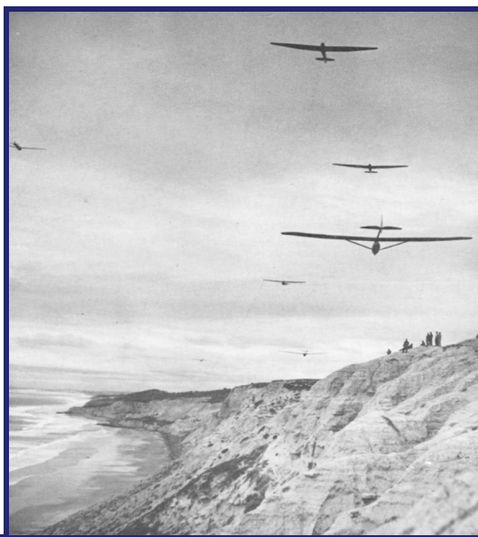
Gliders soaring above the cliffs at the Torrey Pines Gliderport in La Jolla, California.

Once again, as at Trestles, we are charting new directions for nominations to the National Register as we introduce another element into the realm of cultural and natural resources. Yes, you guessed it—air!