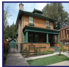
Hewlett Packard House and Garage, Santa Clara County, listed April 20, 2007