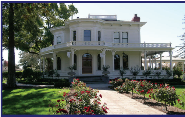
Orange Lawn, Sonoma, Sonoma County, listed June 9, 2008

Orange Lawn is a Victorian residence, designed in the Italianate style and dates to 1872. Native and exotic trees dating from the nineteenth century grace the grounds of Orange Lawn. The house was renovated in 1996 and it retains integrity of setting, workmanship, materials, feeling and association which convey its significance for architecture within the historic context of Sonoma and the San Francisco Bay area. The property was listed in the National Register June 9, 2008 at the local level of significance under Criterion C as a good, representative example of Italianate architecture that displays the distinctive characteristics of that style and possessing high artistic value. The building also represents the work of an unknown master craftsman whose sawn ornament achieves significance as sculptural folk art.