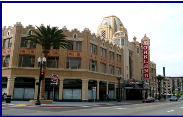
Oakland Fox Theater

OHP management decided to spread the CHF Prop 12 grant funds around as much as possible so as to fund more projects, given there were 114 applications requesting a total of $35,711,120. Successful applicants had to match the state grant, and projects received less funding than requested. Both situations meant that recipients had to seek additional funding. Some CHF projects received other state bond funds as match, such as CCHE and California State Parks' Local Assistance grants, and Save America's Treasures (SAT) federal grants were used. The National Park Service also required a match for SAT grants. (Stockton Fox Theater, Oroville State Theatre, Estudillo Mansion, and Casa Grande projects received SAT grants).