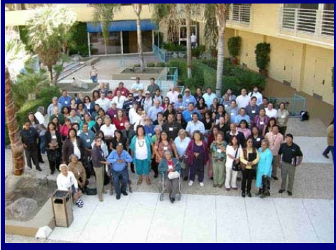
NATHPOs, hosted by the Agua Caliente Band of Cahuilla Indians, at Agua Caliente, October, 2007

allotments, and leasing contracts. By 1900, the Indian Agent had, in effect, become the tribal government.