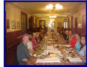
SHPO/THPO Summit July 15, 2009 Sacramento

Like the National Conference of State Historic Preservation Officers (NCSHPO) , in 1998 the National Association of Tribal Historic Preser-