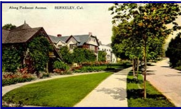
Postcard of Piedmont Avenue, c. 1915 Berkeley, California