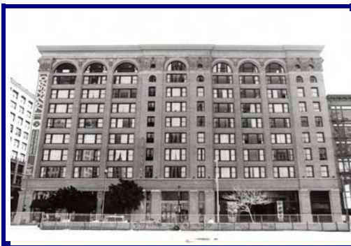
Pacific Electric Building Los Angeles, Los Angeles County Listed April 9, 2009

Marguerita Lane is a narrow private street in the southern part of Pasadena off South Marengo Avenue. The subdivision was conceived as an artists' colony, and all of the houses were developed in a two-year period between 1927 and 1930. The sixteen houses in the district are similar in style, scale, and materials, but unique in design. The houses are primarily one-story in height, and all are Spanish Colonial Revival in style. Common features include wood-framed structures, stuccoed walls, multi-paned casement windows, and roofs covered with red-clay tiles. The houses are all relatively small (ranging in size from 900 to 1,500 square feet) although they occupy a high percentage of their lots. The edge of the lane has a variety of features, including six-foot stuccoed privacy walls, tall hedges, and small planter strips. The asphalt street has no streetlights, curbs, or gutters, or sidewalks. The district has a strong consistency in character and retains a high level of integrity. Marguerita Lane Historic District was listed under Criterion C as an excellent collection of small-scale Spanish Colonial Revival single-family houses that is unique because it was developed as a unified tract of houses in similar styles on relatively small lots and because it remains virtually unchanged since construction.