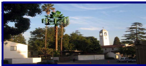
Photo Simulation of a Monopalm Installation St. Elizabeth of Hungary Catholic Church Altadena, California