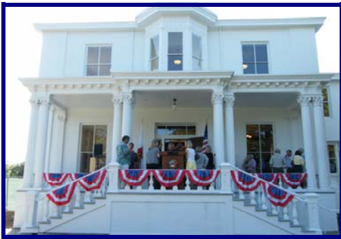
Benicia Commandant's Residence Rehabilitation

At nearly the same time, California's economy plummeted into a severe recession, causing an unprecedented deficit in the state budget. Californians began hearing about national budget crises in trillions of dollars and a state deficit in many billions. California state government was severely impacted by the ballooning budget crisis. For the first time, state bond funds were frozen December 17, 2008 by the State Pooled Money Investment Board. Grantees were instructed to stop work unless the projects could be continued with other than state funds.