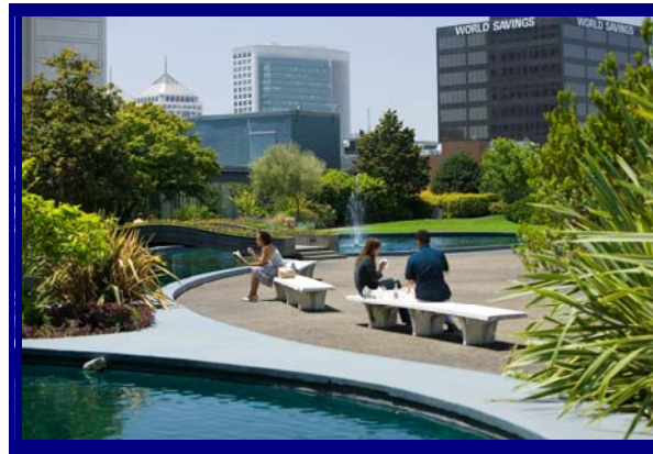
Henry J. Kaiser Rooftop Garden, Oakland

The group's accomplishments include an impressive array – done almost exclusively by volunteers. We have selected three sites for HALS documentation. These include the Henry J. Kaiser Roof Garden in downtown Oakland, Piedmont Way in Berkeley originally conceived by Fredric Law Olmsted, and the Mary Burdell Victorian Garden at Olompali State Historic Park in Novato.