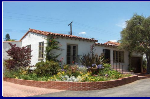
Marguerita Lane Historic District Pasadena, Los Angeles County Listed April 10, 2009

Marguerita Lane is a narrow private street in the southern part of Pasadena off South Marengo Avenue. The subdivision was conceived as an artists' colony, and all of the houses were developed in a two-year period between 1927 and 1930. The sixteen houses in the district are similar in style, scale, and materials, but unique in design. The houses are primarily one-story in height, and all are Spanish Colonial Revival in style. Common features include wood-framed structures, stuccoed walls, multi-paned casement windows, and roofs covered with red-clay tiles. The houses are all relatively small (ranging in size from 900 to 1,500 square feet) although they occupy a high percentage of their lots. The edge of the lane has a variety of features, including six-foot stuccoed privacy walls, tall hedges, and small planter strips. The asphalt street has no streetlights, curbs, or gutters, or sidewalks. The district has a strong consistency in character and retains a high level of integrity. Marguerita Lane Historic District was listed under Criterion C as an excellent collection of small-scale Spanish Colonial Revival single-family houses that is unique because it was developed as a unified tract of houses in similar styles on relatively small lots and because it remains virtually unchanged since construction.