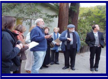
HALS Meeting, February 10, 2009 Lakeside Park Garden Center, Oakland

Our first quarterly meeting was held at the office of PGAdesign inc in November, 2004. Since that time, the group has met quarterly and membership has grown to 98. Our membership includes: 22 landscape architects, 13 architects and allied professionals, 12 state and national park staff members, 12 persons from various universities, 8 historians and other persons interested in cultural landscapes.