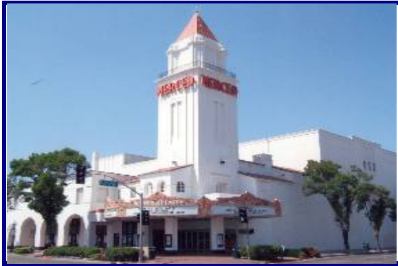
Merced Theatre, Merced County, Listed May 1, 2009

The Merced Theatre is a multi-level white stucco building in downtown Merced. The complex's most prominent feature is the 100-foot high tower and marquee. In 1931, the Golden State Theatre Company commissioned the Reid Brothers, prominent San Francisco architects, to design the building. Using elements of the Spanish Colonial Revival Style, the brothers created an outstanding example of early 20 th century theatre architecture. The Theatre's multiple roof lines mimic the form of a Spanish village. Stucco walls, clay roof tiles, archways, decorative ironwork, and colorful ceramic tile manufactured by the Hispano Moresque Tile Company of Los Angeles all add to the building's character. The interior most notably features a mural by A.B. Heinsbergen, famous for his work in hundreds of theatres and public buildings throughout the country. The Theatre was the place of dramatic performances, concerts, dance recitals, talent shows, and cooking demonstrations. High school graduations were also held there. Newsreels shown there kept Merced's residents abreast of current events. Throughout the Depression, World War II, and the post-war years, the theatre continued to be the cultural and social center of Merced and was listed under Criteria A and C at the local level, with a 1931-1958 period of significance.