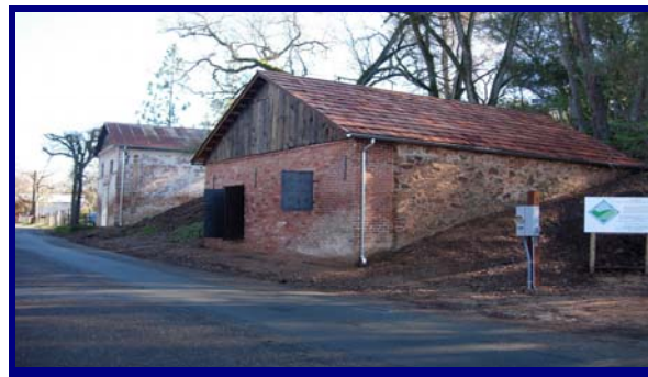
Fiddletown Chinese Buildings

The 51 grant projects comprised 19 th and 20 th century historic properties representative of multiple California historic themes, including military, transportation, government, agriculture, architecture, education, theater/arts, immigration, as well as cultural history interpretation projects. (A complete list of the projects with images can be