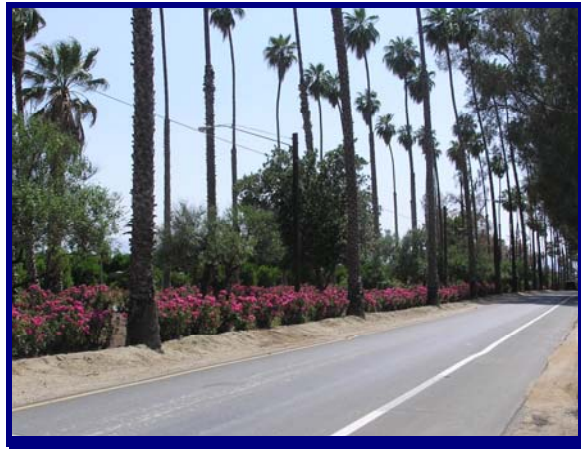
Victoria Avenue Restoration

Typically, the Investment Board funds bond programs and projects until state bonds are sold. Unfortunately, the State's severe