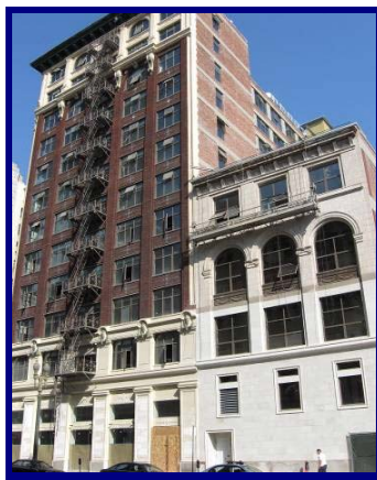
Brockman Building & New York Cloak & Suit House (Annex) Los Angeles County Listed May 21, 2009

The Merced Theatre is a multi-level white stucco building in downtown Merced. The complex's most prominent feature is the 100-foot high tower and marquee. In 1931, the Golden State Theatre Company commissioned the Reid Brothers, prominent San Francisco architects, to design the building. Using elements of the Spanish Colonial Revival Style, the brothers created an outstanding example of early 20 th century theatre architecture. The Theatre's multiple roof lines mimic the form of a Spanish village. Stucco walls, clay roof tiles, archways, decorative ironwork, and colorful ceramic tile manufactured by the Hispano Moresque Tile Company of Los Angeles all add to the building's character. The interior most notably features a mural by A.B. Heinsbergen, famous for his work in hundreds of theatres and public buildings throughout the country. The Theatre was the place of dramatic performances, concerts, dance recitals, talent shows, and cooking demonstrations. High school graduations were also held there. Newsreels shown there kept Merced's residents abreast of current events. Throughout the Depression, World War II, and the post-war years, the theatre continued to be the cultural and social center of Merced and was listed under Criteria A and C at the local level, with a 1931-1958 period of significance.