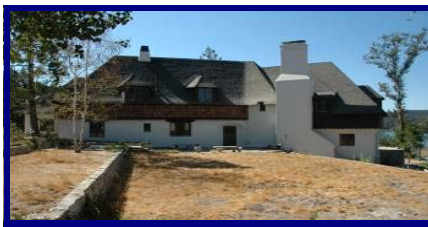
Shady Point, Lake Arrowhead San Bernardino County Listed October 5, 2009

Shady Point was listed under Criterion C at the local level as an example of French Revival residential architecture at Lake Arrowhead designed by Roland Coate. Constructed with high quality materials and exceptional craftsmanship, Shady Point is one of the outstanding examples of French Revival residential architecture at Lake Arrowhead. The demolition of the original Lake Arrowhead Village in the 1970s and the subsequent infill construction of many new residences of differing styles make Shady Point stand out as one of the oldest and best surviving examples of the original French Revival motif of the area, especially as applied to a lakefront estate.