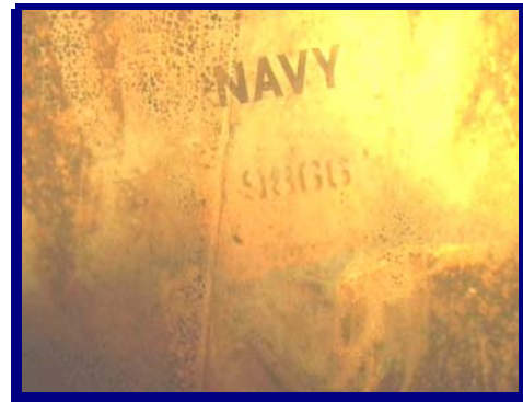
Helldiver 19866, Lower Otay Reservoir, San Diego County

However, since the Navy is responsible for the recovery of the SB2C and that the aircraft and/or site is considered a historical resource, Section 106 of the National Historic Preservation Act needs to be followed.