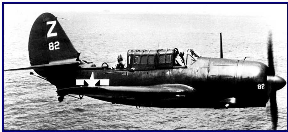
Curtiss SB2C Helldiver