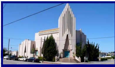
First Baptist Church of Ventura Ventura, Ventura County Listed July 3, 2009

The First Baptist Church of Ventura was listed in the National Register under Criterion C as an example of the Mayan Revival architectural style designed by architect Robert B. Stacy-Judd of Los Angeles, the style's most avid advocate. The building features numerous characteristics of the style and is dominated by a 56-foot-high tower consisting of eleven, layered pylons which project outwards and upwards in steps from the edges to the center. Mayan Revival style detailing in the sanctuary includes a ceiling characterized by a seven-stepped, four-sided corbelled arch terminating in a flat ceiling decorated in a geometrical textile pattern painted on perforated ceiling tiles. The altar/lectern features Mayan motifs in deep relief. Corbelled arched doorways flanking the podium are topped with inverted corbelled arches with Mayan-inspired cast grillwork of a geometrical design. The period of significance is 1932.