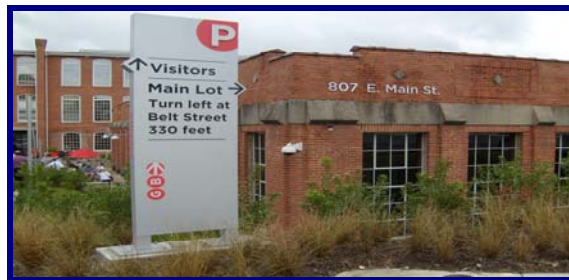
Monument Way-Finding Sign Golden Belt Manufacturing Plant, Raleigh

The NPS workshop is a valuable tool for state reviewers to connect with colleagues in other states and with the NPS Technical Preservation Services review staff. It also provides an update on facets of the tax incentives program and is a way to gain new ideas of advancements in conservation and environmental programs that may need to be balanced with historic conservation goals or which may assist in better rehabilitations.