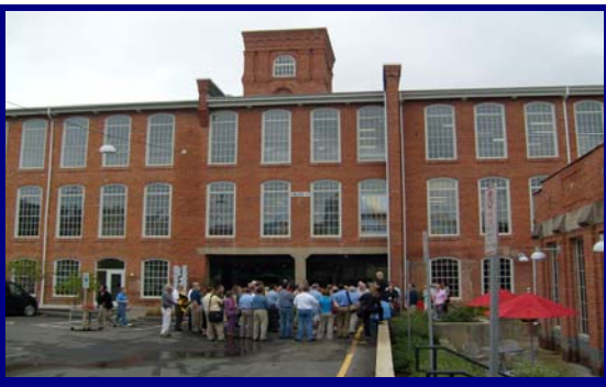
NPS Workshop Participants Touring Golden Belt Manufacturing Plant, Raleigh

September 23 rd was dedicated to a tour of local tax incentives rehabilitation projects, some with LEED components and several with multiple buildings within a single property. A highlight was the Golden Belt Manufacturing Plant, a textile mill associated with the tobacco industry. A grouping of historic brick mill buildings have been or will be converted into housing, offices, art programs, and small retail and restaurants using low-impact alterations and materials. The project is ongoing, with their LEED gold certificate expected shortly.