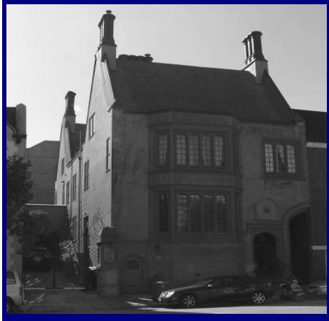
Tobin House San Francisco City & County Listed October 5, 2009

Tobin House was listed at the local level under Criterion C as the work of master architect, Willis Polk, one of the San Francisco Bay Area's most influential architects of the period. It is representative of Polk's penchant for medieval English architecture and restrained use of decoration as panaceas for what he deemed the architectural chaos of San Francisco's late nineteenth-century streetscape. The house also influenced the architectural development of the block during the 1940s and is unique in San Francisco—let alone Polk's oeuvre—for a Gothic style half arch that leads to a side yard to the west of the house.