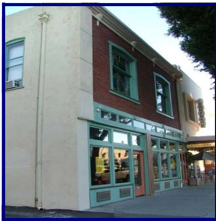
Jackson Building Riverside, Riverside County Listed July 31, 2009

La Laguna de San Gabriel , a playground located in the Vincent Lugo Park in the City of San Gabriel, was completed in 1965. The playground contains 14 concrete play-sculptures sharing a nautical theme designed by Benjamin Dominguez, a master concrete artist originally from Mexico. La Laguna Park was listed under Criterion 3. Its significance is based on its highly unique and masterfully rendered hand-sculpted concrete play structures. It represents the type of playground equipment designed and constructed during the post-World War II period, but executed by a hand that elevates the playground to the status of interactive art. The property is currently less than 50 years old, but liability concerns have caused the removal of similar playgrounds, making parks like La Laguna a rare and threatened resource.