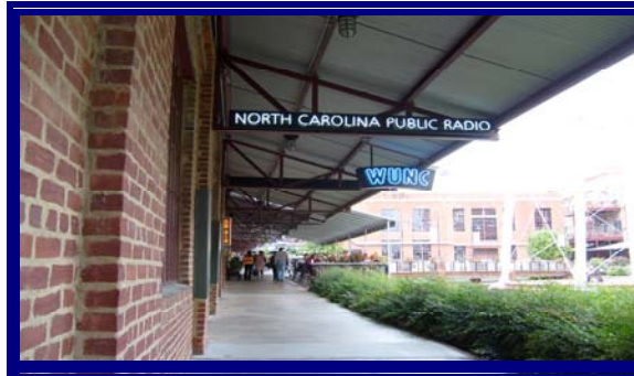
Low-Key But Visible Neon Signage American Tobacco Warehouse, Durham