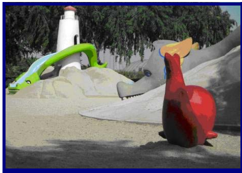
La Laguna Park San Gabriel, Los Angeles County Listed July 31, 2009

La Laguna de San Gabriel , a playground located in the Vincent Lugo Park in the City of San Gabriel, was completed in 1965. The playground contains 14 concrete play-sculptures sharing a nautical theme designed by Benjamin Dominguez, a master concrete artist originally from Mexico. La Laguna Park was listed under Criterion 3. Its significance is based on its highly unique and masterfully rendered hand-sculpted concrete play structures. It represents the type of playground equipment designed and constructed during the post-World War II period, but executed by a hand that elevates the playground to the status of interactive art. The property is currently less than 50 years old, but liability concerns have caused the removal of similar playgrounds, making parks like La Laguna a rare and threatened resource.