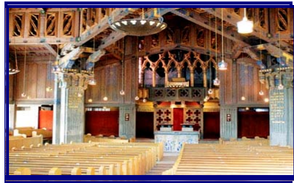
First Church of Christ Scientist, Berkeley Designed by Bernard Maybeck (1910) National Historic Landmark, 1977

western United States. The First Church of Christ, Scientist in Berkeley, designed by Bernard Maybeck in 1910, was recognized with National Historic Landmark designation in 1977 as "a monument of immense beauty and strength, literally a piece of timeless carved sculpture constructed with imagination and loving care" by one of the most important architects of the 20 th century. For perspective on national significance, consider that although the National Historic Landmarks (NHL) program is independent of the National Register, National Register Bulletins 15 and 16A ask that applicants use the National Historic Landmarks program criteria as the basis for evaluating properties for national significance.