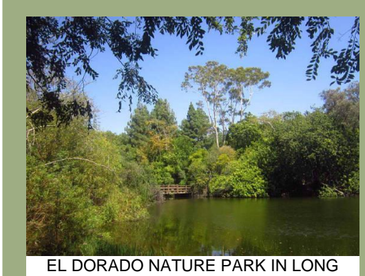
EL DORADO NATURE PARK IN LONG BEACH, A RIPARIAN AND RIVERINE HABITAT PROJECT

This competitive program awarded 35 grants to increase public recreational access, awareness, understanding, enjoyment, protection, and restoration of California's rivers and streams. Eligible projects included the acquisition, development, or improvement of recreation areas, open space, parks, and trails in close proximity to rivers and streams. All projects included a riparian or riverine habitat enhancement element and also provided for public access.