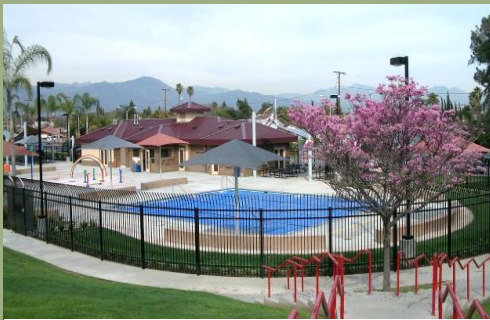
GARVEY AQUATIC CENTER IN THE CITY OF ROSEMEAD, A STATEWIDE PARK PROGRAM PROJECT

This program provided funds for acquisition and development projects for new park and recreation opportunities. Eligible applicants included cities, counties, districts, non-profits and joint-powers authorities located in park poor or low-income areas of California. Over 100 new parks will be created. Youth, seniors, and families determined what they wanted in these new parks through community-based planning. 900 applications requested $3 billion for the available $368 million.